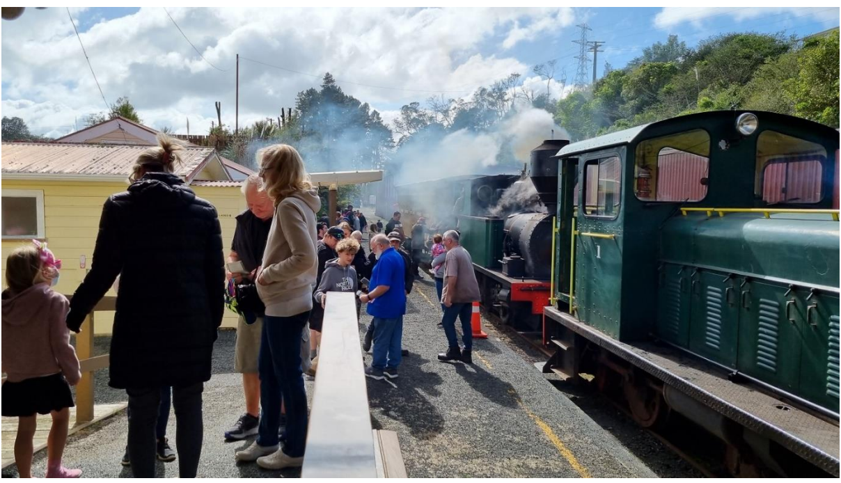
A busy September Open Day (K. Kopa)