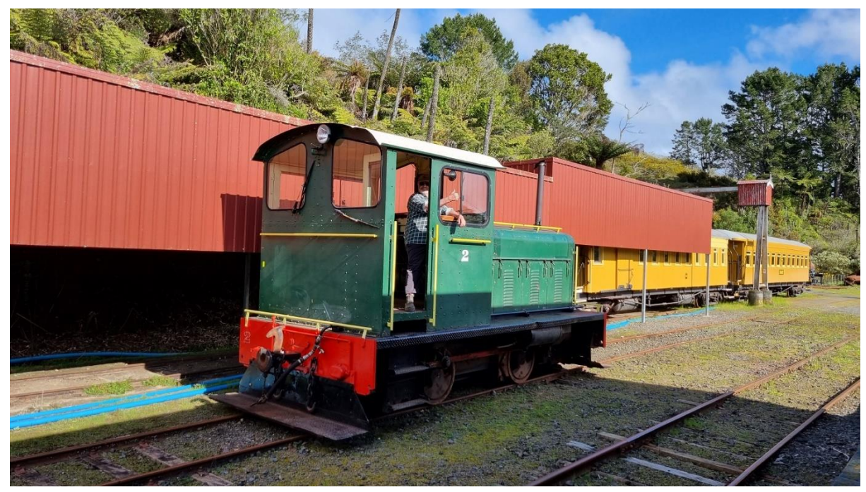
Meremere 402 with driver Geoff (k.Kopa)