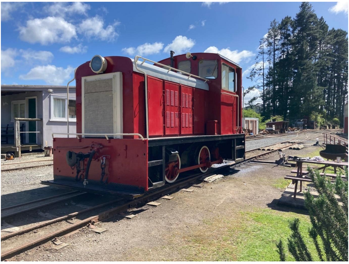
Above - Tr105 \ seen \ outside \ the \ woodwork \ shop \ for \ the \ first \ time \ in \ 2022. \ Below - The \ Price \ "E" \ has \ a \ new \ smokebox \ wrapper \ (RStratford)