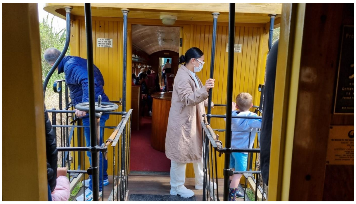
September Open Day – the balcony of "Mary" (K.Kopa)