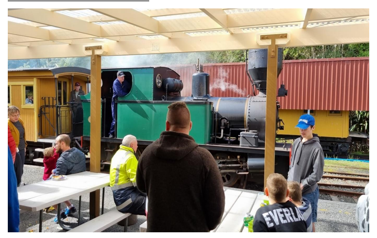
Peckett and train at PJ -September Open Day