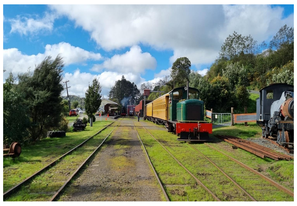
A Meremere diesel shunts the carriages prior to a recent open day

Charter trips: By the time you receive this newsletter, we will have run a charter trip for a group from Hamilton. We have also had another enquiry.