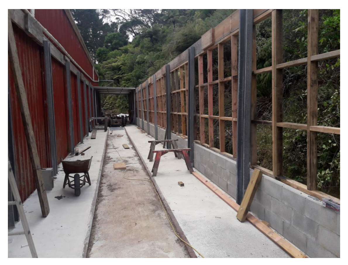
The woodwork shop lean-to a work in progress above (T. Townsend) and below (I.Jenner)