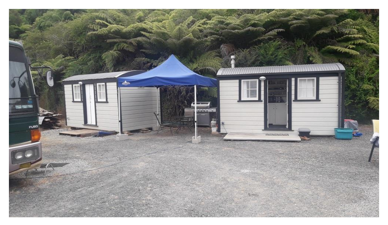
The two new recently built huts now on site