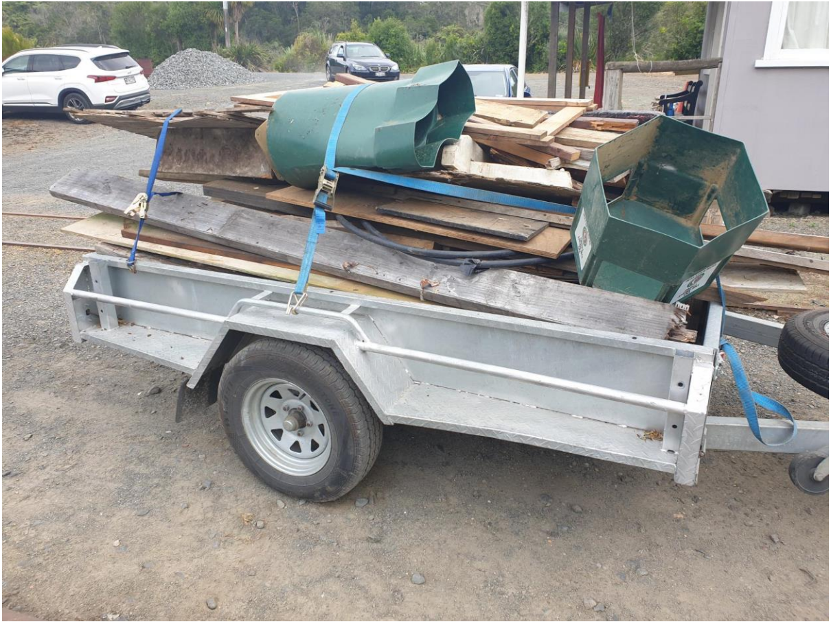
(Above & below) - Removal of unwanted material was a feature of the recent working bee (I.Jenner)