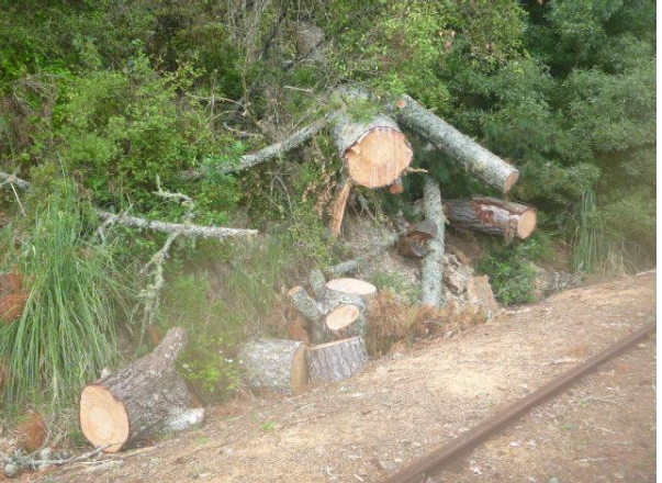
New steel ramps to load our digger onto the large flat wagon plus a photo of our never-ending tree clearance (I. Bettison)