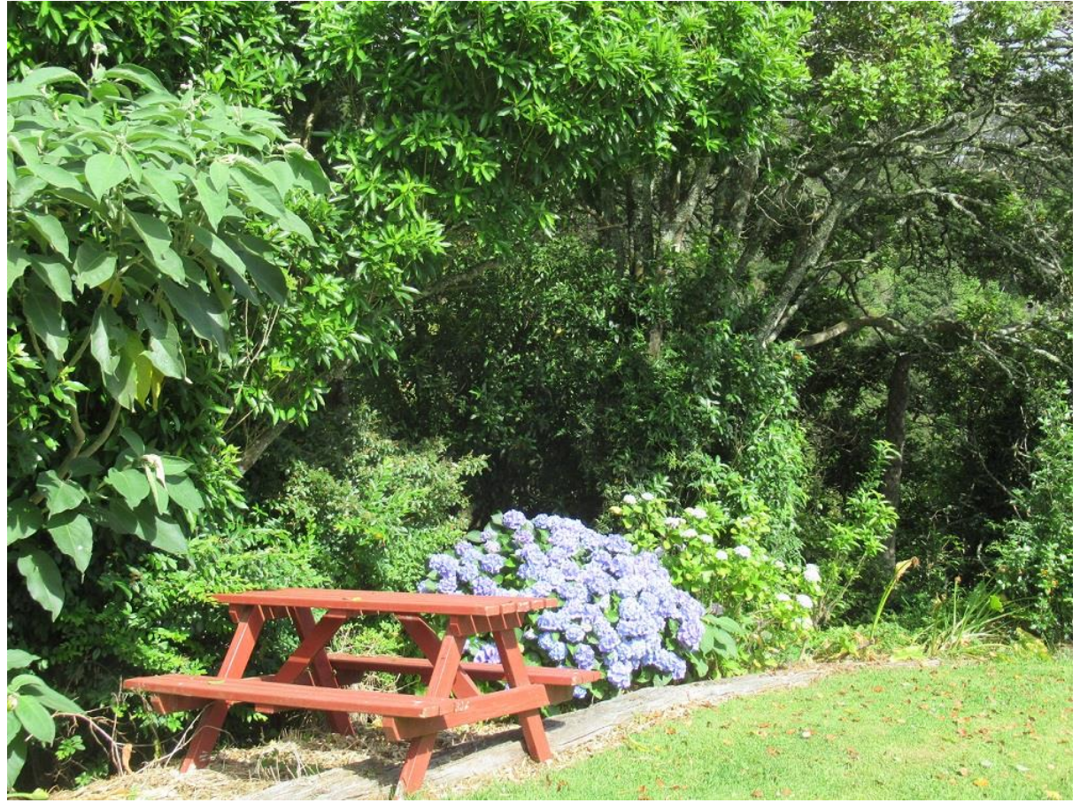
The gardens at PJ currently look very healthy (I. Bettison)