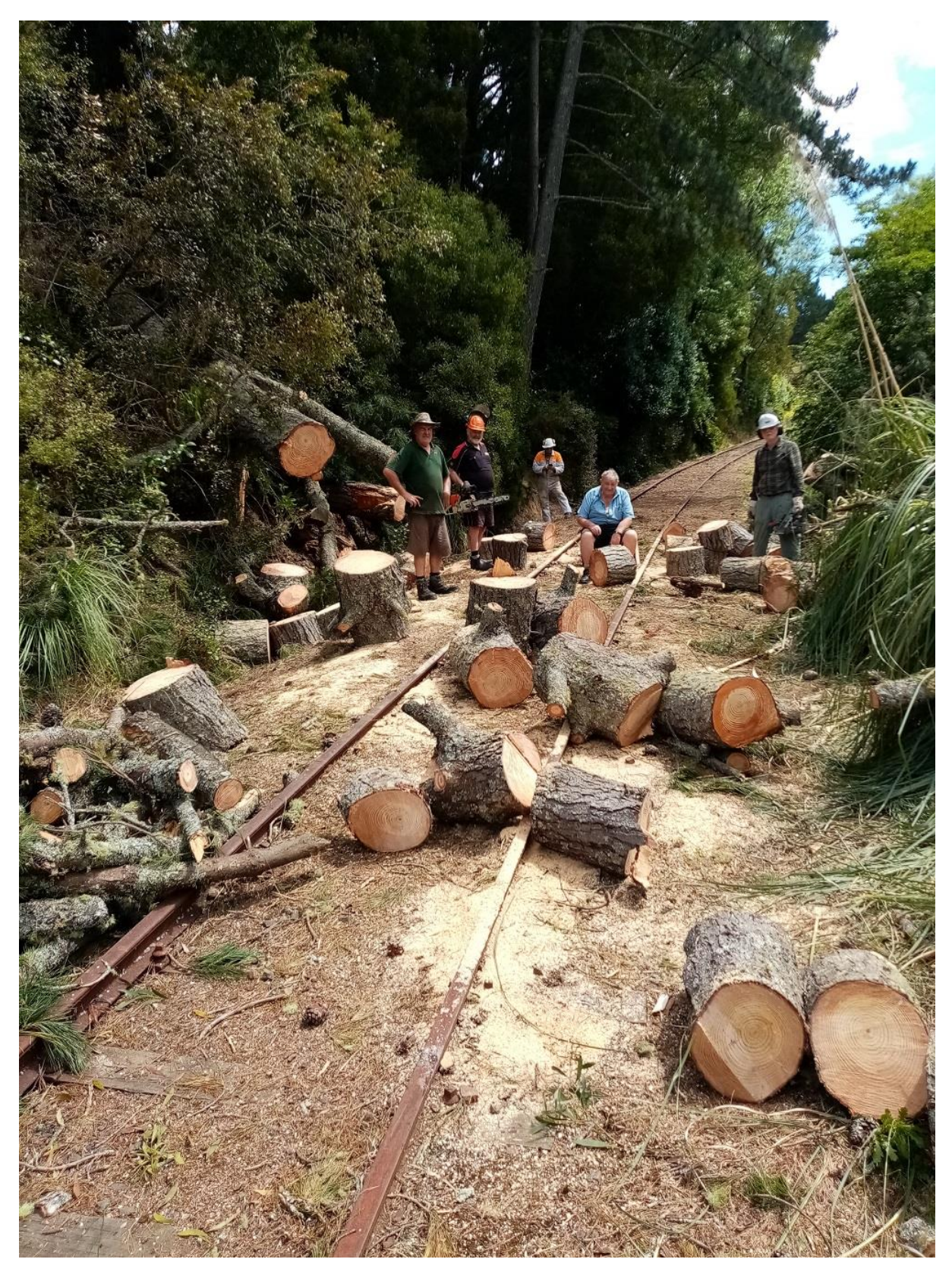
The team take a break from chopping up a tree near the ex-Jenner residence on 7th November (R. Webb)

Russell W has cleaned & painted the 2 gates- one at the bottom of the drive & the other behind the station.