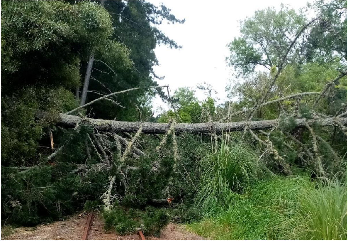
Tree over the line near Glen Afton in early November (R.Webb)