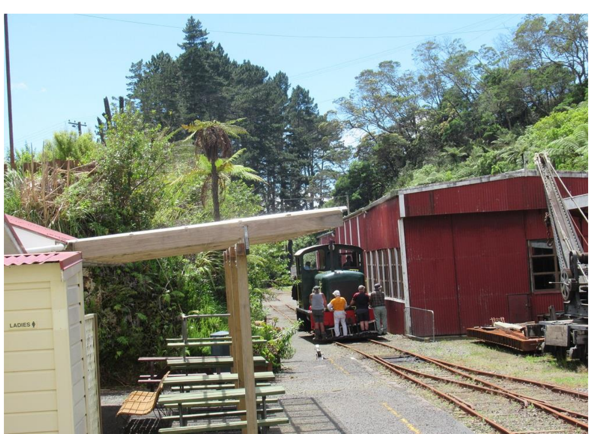
A Meremere diesel in early November moves away from the station towards the shanty (T. Bettison)