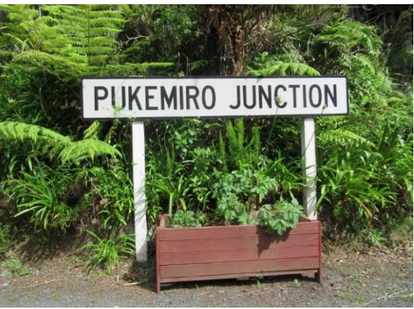
Weedkiller wagon on standby and the station sign and foliage looking good in December 2021 (I. Bettison)