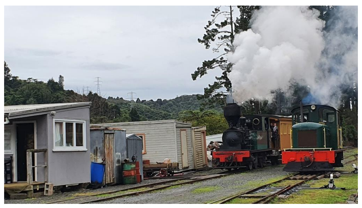
The June Open Day train passes Meremere 401 as it approaches Pukemiro Junction (R. Ellis)