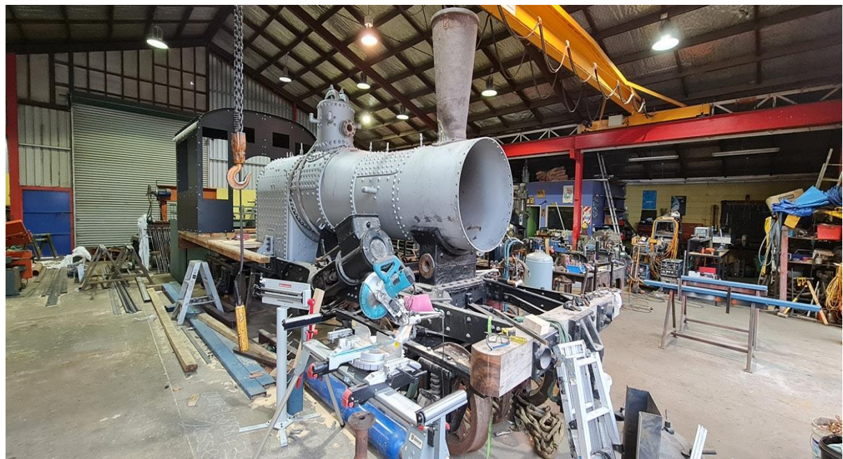
The Climax approaches completion in Te Kuiti 1 (C. Mann)

"F" locomotive: The F was recently moved out of the shed for the first time in 5-6 years. The move was to allow the Westinghouse brake pump to be removed. This pump will be used on the Climax locomotive. The F loco was reluctant to move after sitting in one place for so long. A lot of oiling got the loco over the pit where some more had the loco moving very freely. It was good to see this loco out in the sun again.