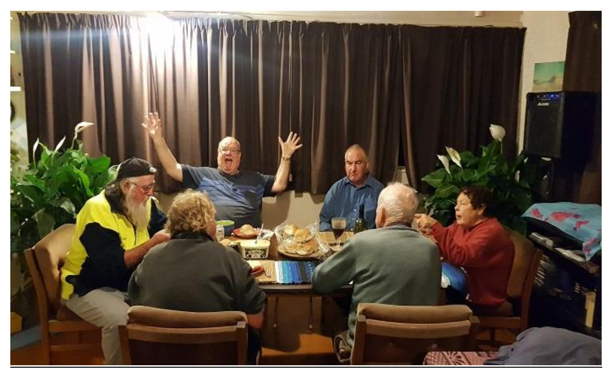
Several BTC members recently enjoyed a mid-week evening meal at the (upper) Junction (K. Kopa).