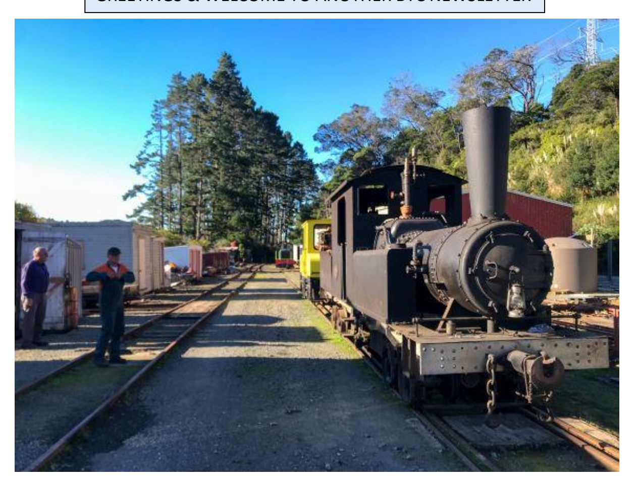
The Cb seen at the May Open Day