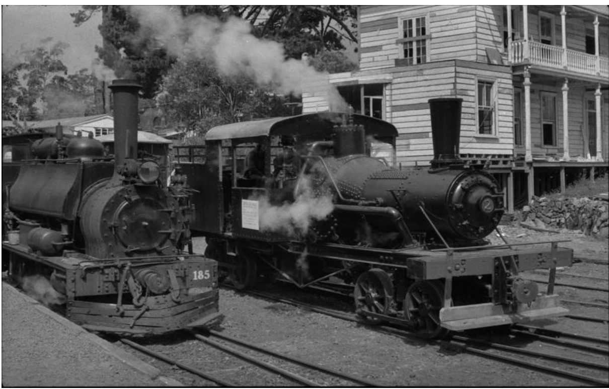
Our F185 and the Heisler as seen at MOTAT in the dim & distant past