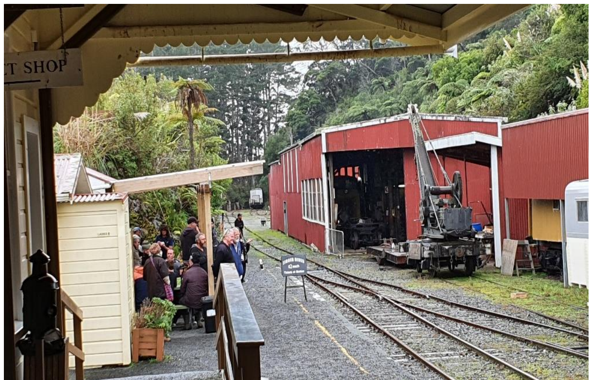
The café awning with appreciative patrons at the June 2021 Open Day