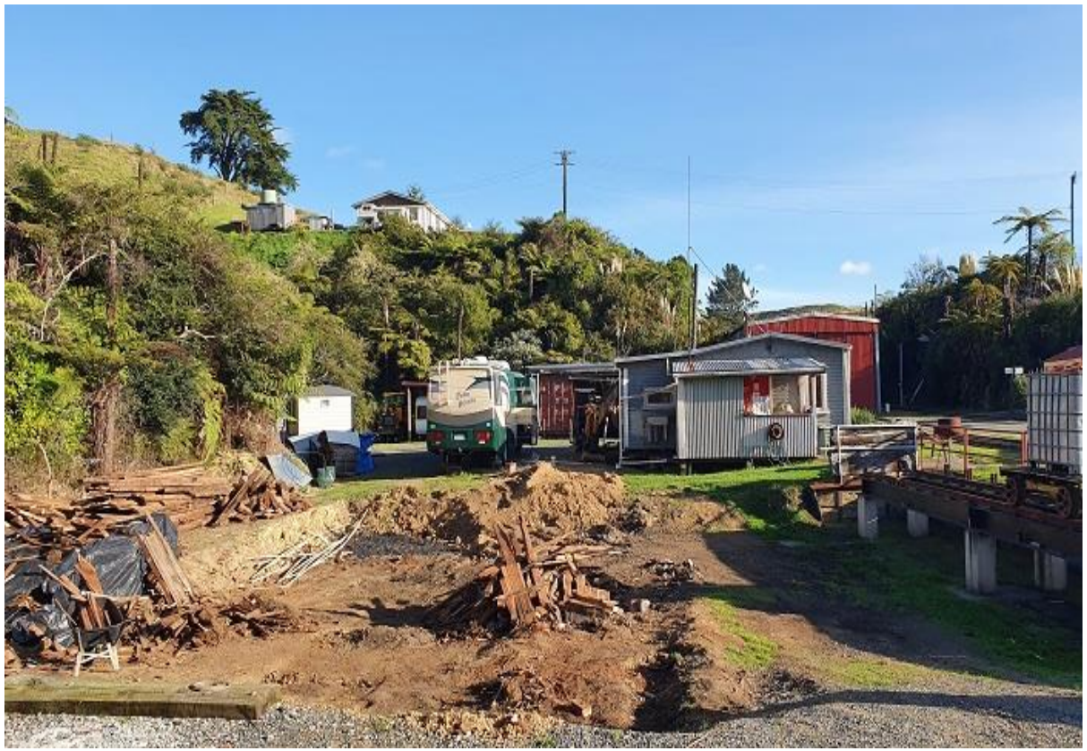
The PJ Hall area after the Hall floor had been removed (R. Ellis)