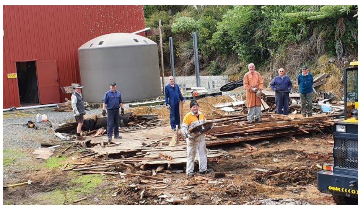
Members at the May working bee cut up the old Hall floor (R. Ellis)

We still have some firewood for sale @ $100 per trailer load.