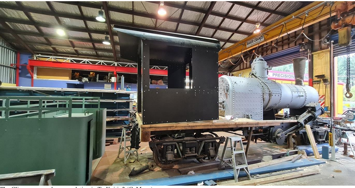
The Climax approaches completion in Te Kuiti 2