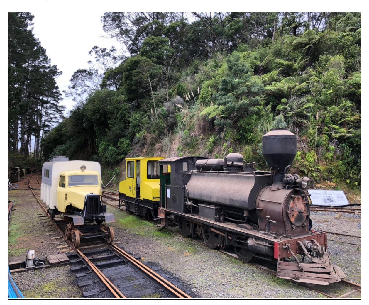
The "F" had a recent outing from the loco shed...seen here with a jigger and the battery loco in the yard