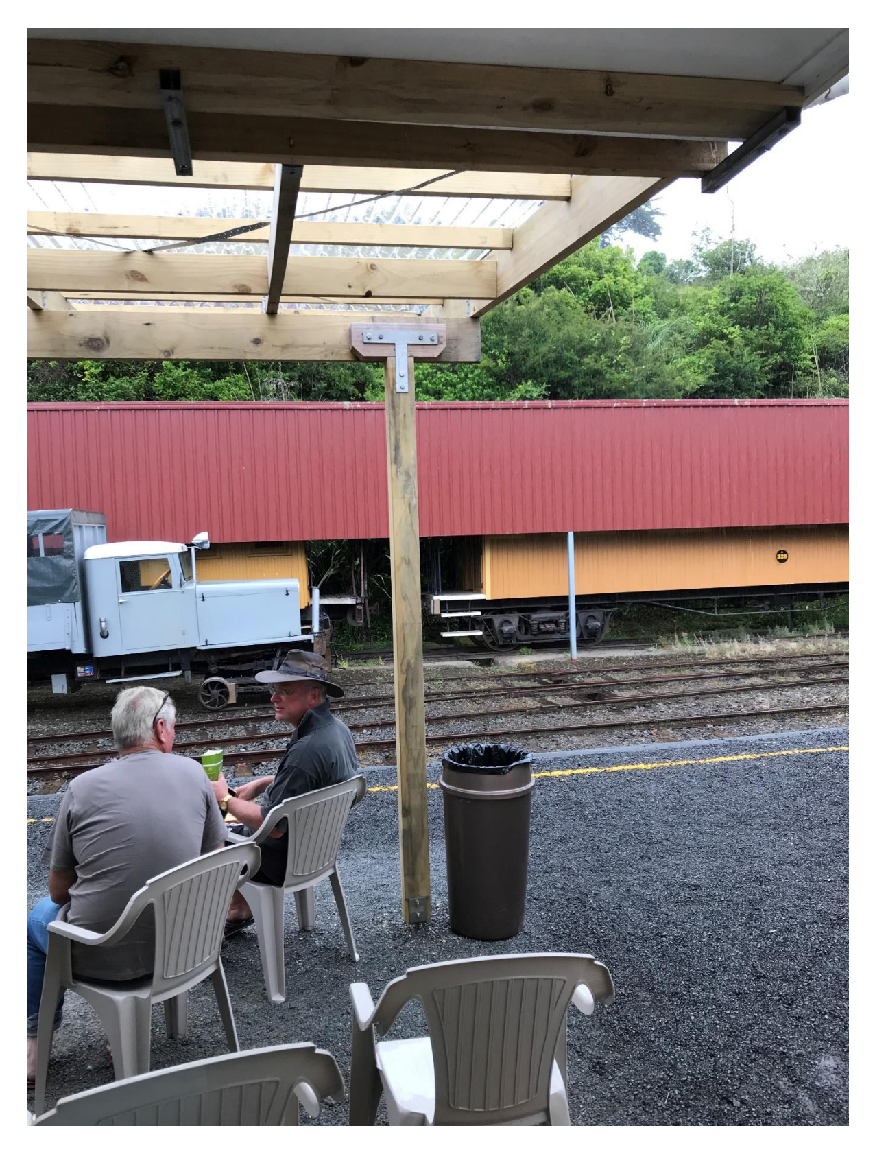
Members congregate under the new café awning (Elliot Baptist)