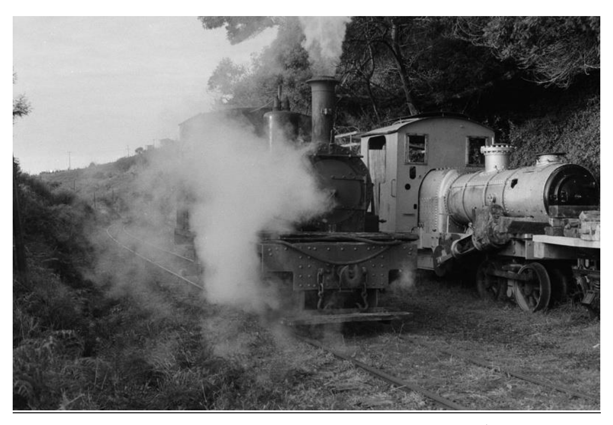
Above & next page (upper): The BTC as seen in the 1970's.