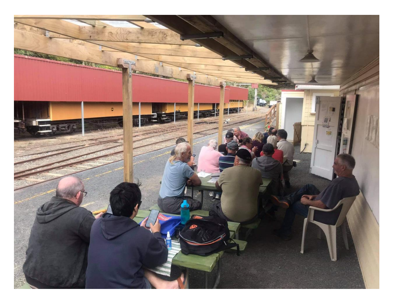
Members attend the AGM in March