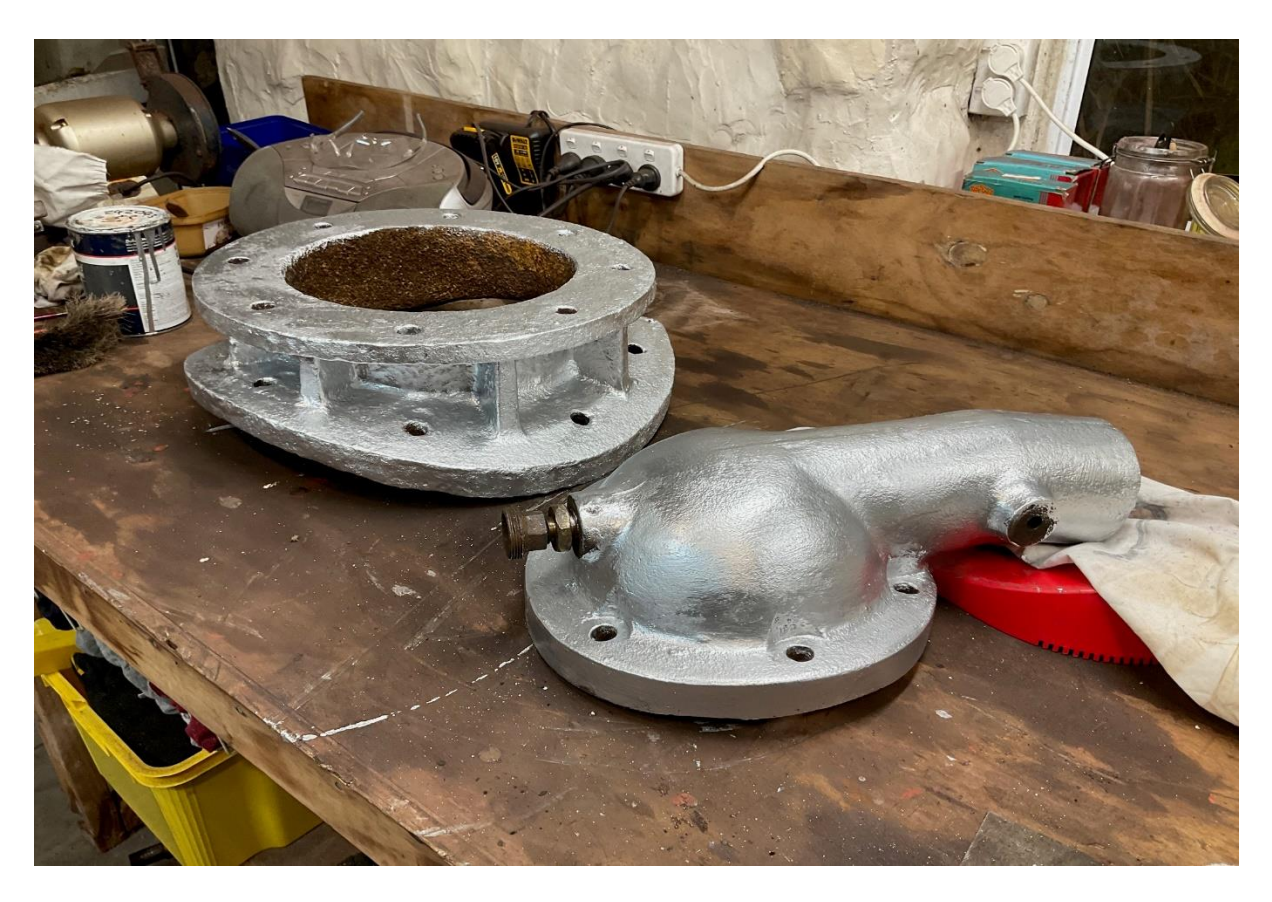
Above & next page (upper): smokebox componentry has been cleaned up for the Heisler project & shipped off to Paekakariki to be installed on the new Heisler smokebox