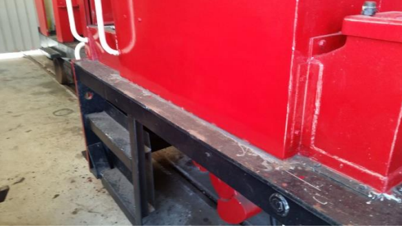
Tr 105 (Tr367) has recently had its rear shunter's footplate & cabside repaired