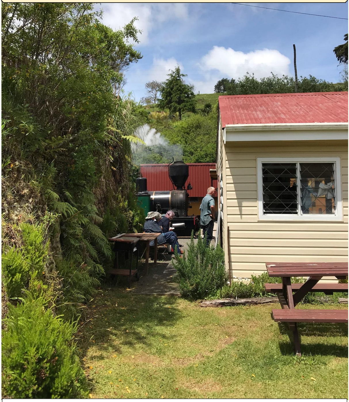
A bush setting view shows the Peckett – here seen from the back of the hill & the cafe