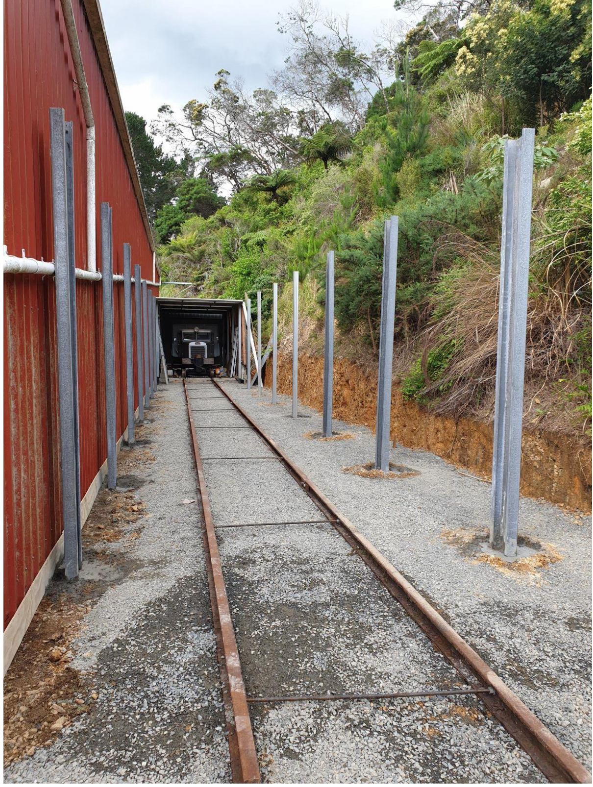
Progress on the woodwork shop "lean-to" showing the rails in place and posts concreted in