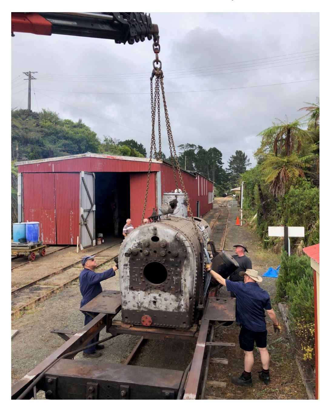
The Heisler boiler in the process of being lifted from its chassis, prior to being moved south

To make a donation see our website <a href="www.bushtramwayclub.com">www.bushtramwayclub.com</a> for details.