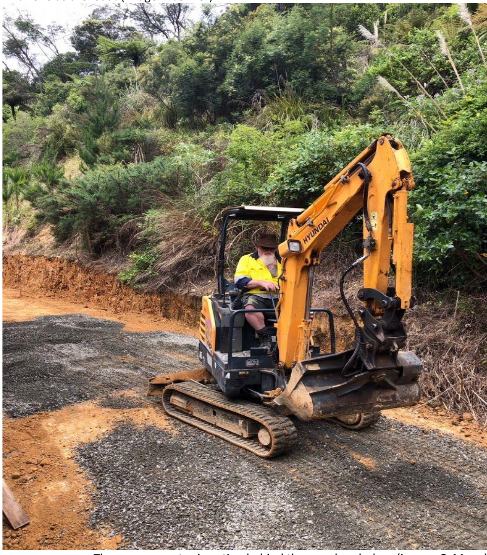
The new excavator in action behind the woodwork shop