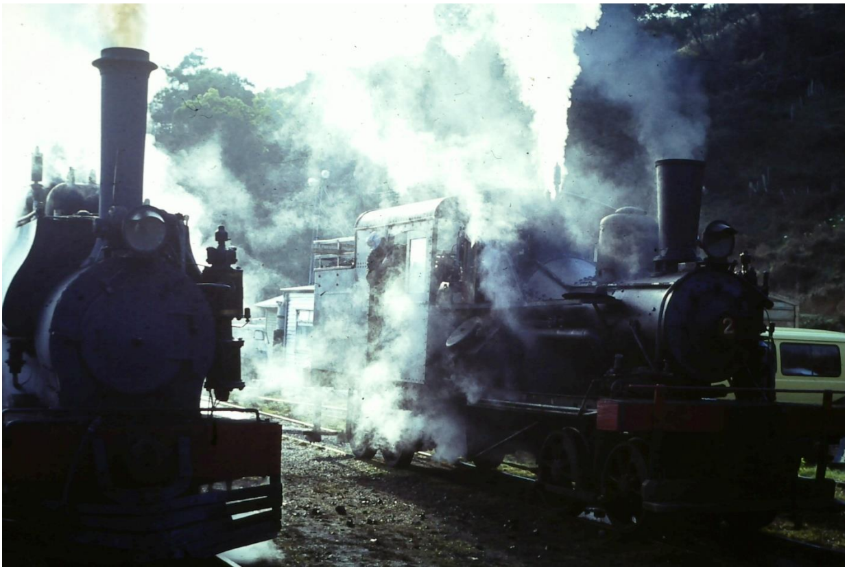
"F" & Heisler firing up for an Open Day at Pukemiro Junction in around 1985