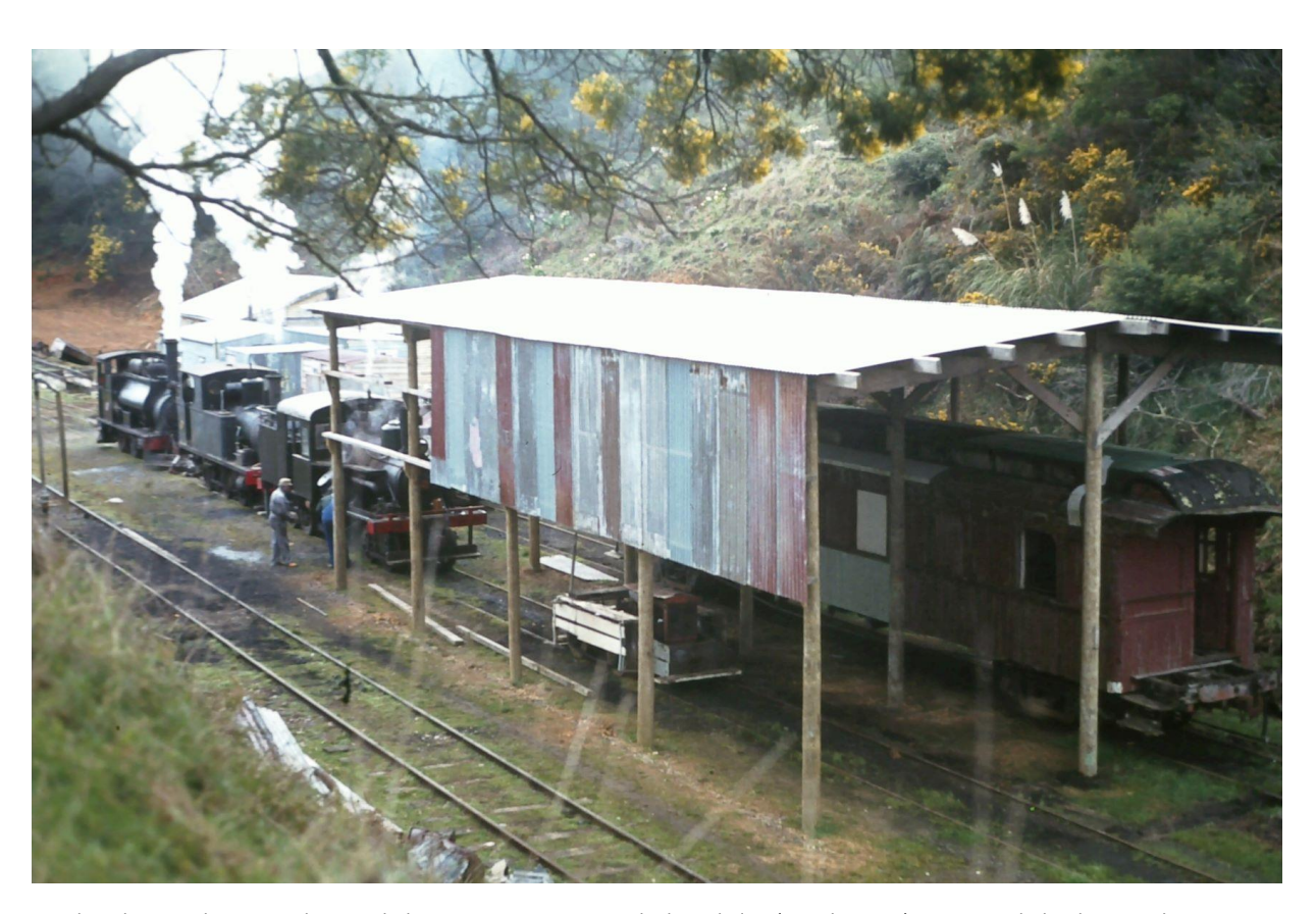
Our then three working steam locos with the Manawatu carriage at the loco shelter (as it then was) in 1985. with the shanty in the distance