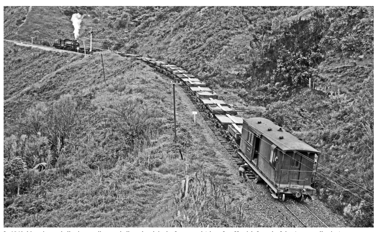
In 1949 this train was ballasting our line....a ballast plough in the foreground