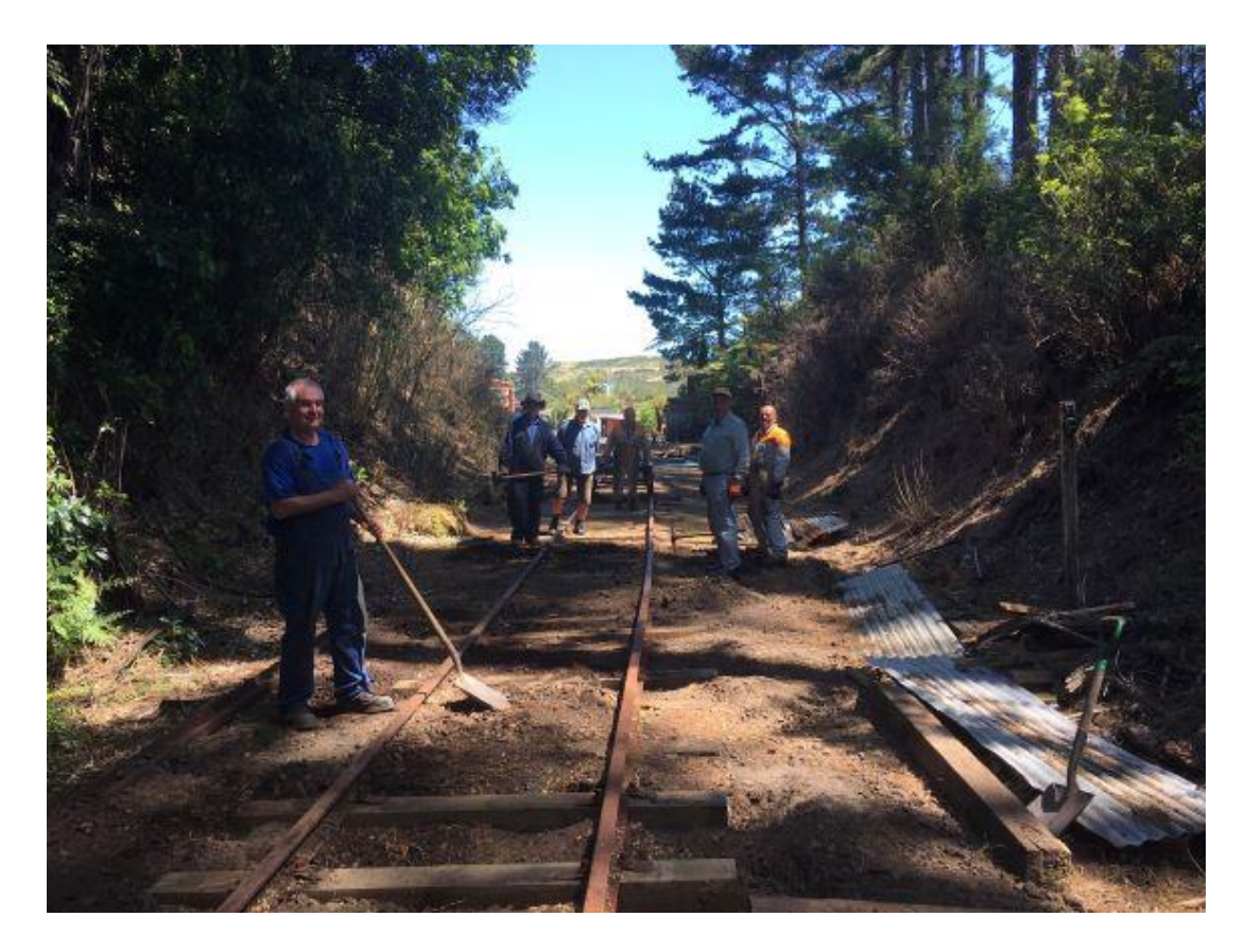
The BTC track gang hard at work at the October working bee

We also had a very successful track gang working bee in October...many thanks to those who were able to be there.