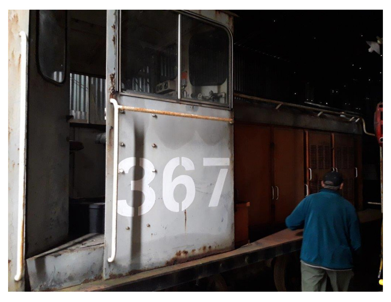
Tr 367 seen at Pukemiro Junction

<u>Climax 1650</u>: Alistair has spent most of a week welding on this boiler.