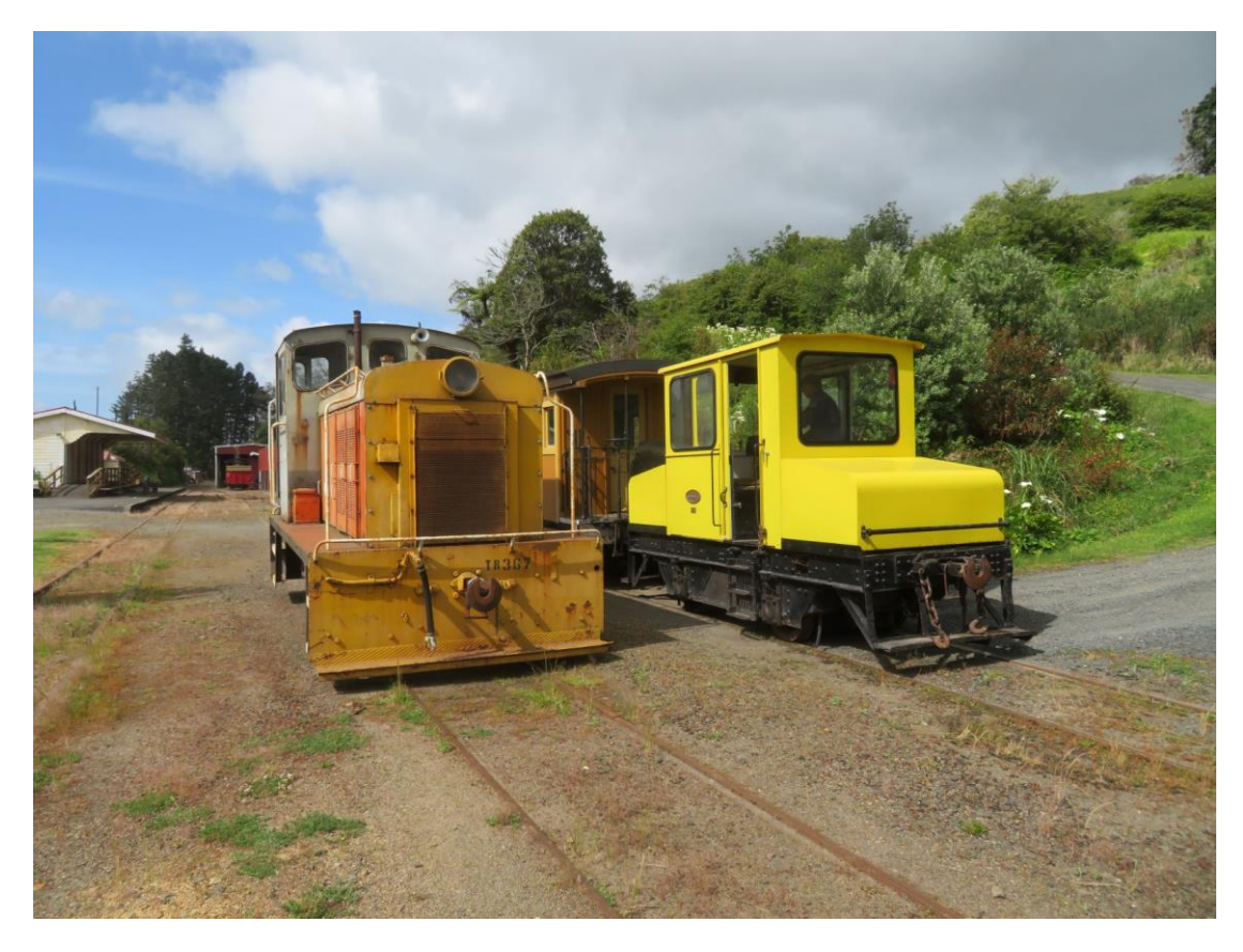
The new Tr367 acquisition is seen with the Battery-electric loco on 1 November 2019

They were both built by A & G Price's in Thames for NZR, one in 1958 & the other a couple of years later. They are both fitted with Gardner 6 LW engines.