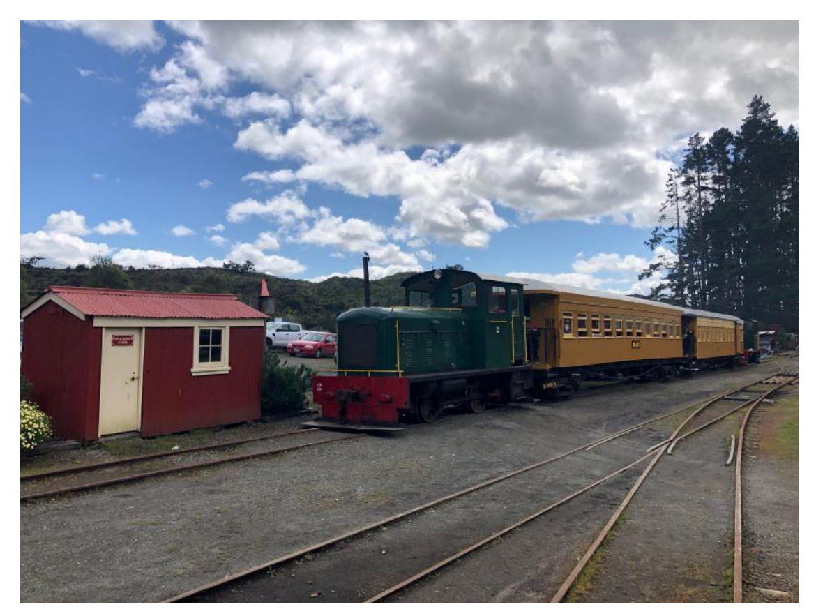
The Meremere locos & train at the October Open Day