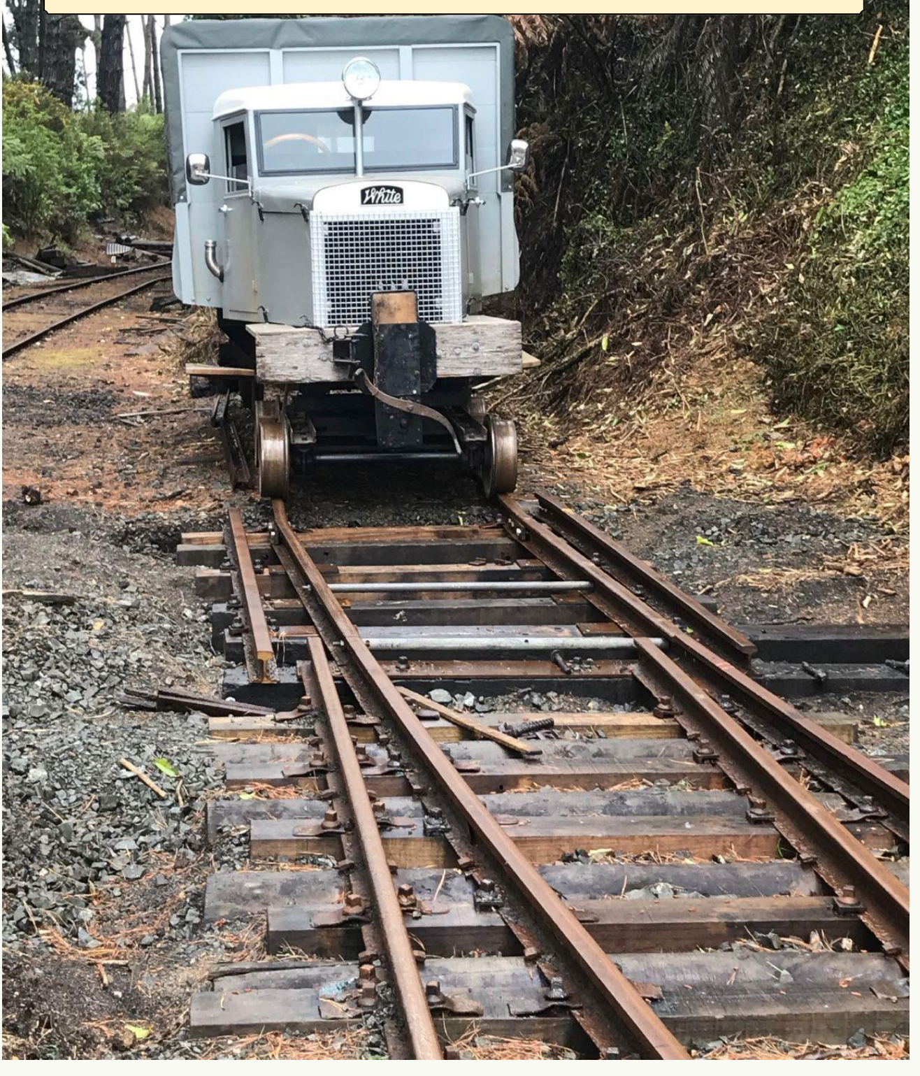
The front page shows the Bush Jigger No.1 and the unusual new stub point behind the Woodwork Shop