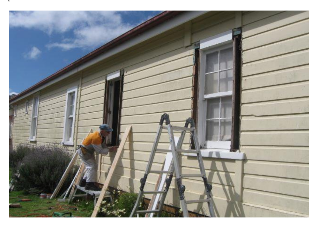
(Upper) Ashley & Bruce repairing the Platform edge; (Lower) Repairing the station windows