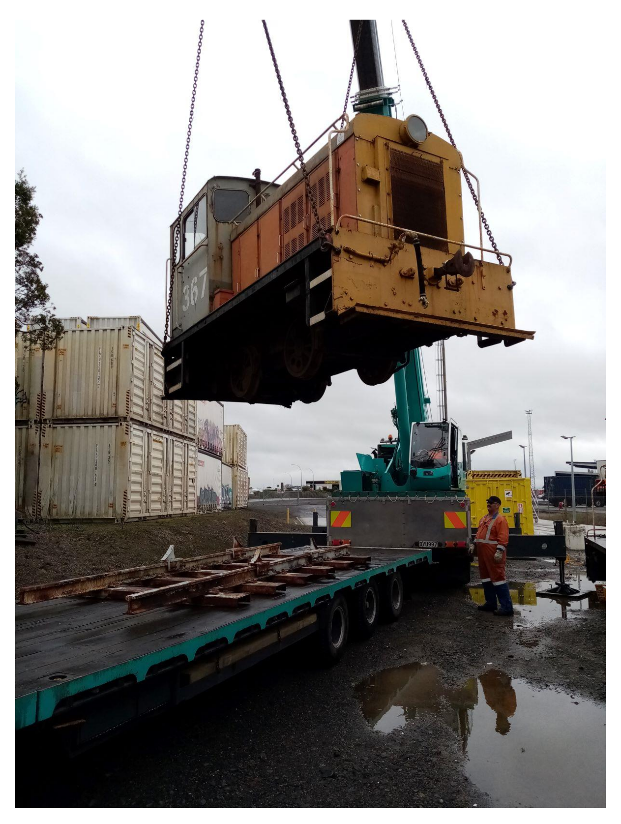
The new acquisition 367 seen being craned onto a low deck truck at KiwiRail Te Rapa depot