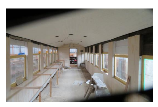
The interior of our A1477 "A" Class carriage is being lined with plywood prior to painting