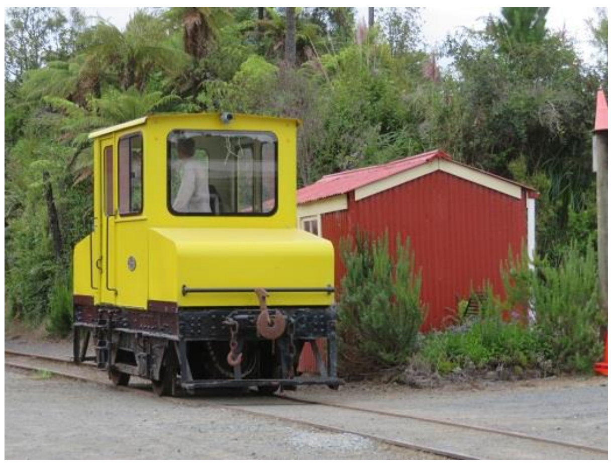
The battery- electric loco was recently and unusually seen in action at the Junction......(R. Ellis)