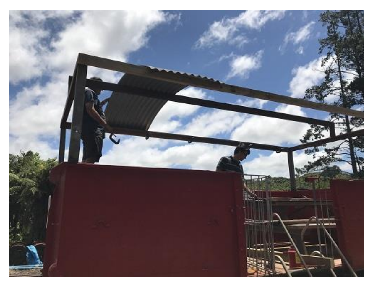
Work on the LA17313 wagon roof proceeds

La 17313 - Bruce McL & Jordan S. spent a day attaching timber to the steel roof supports to give the roof screws something to bite into. Bruce spent part of a day painting the steelwork of the roof supports.