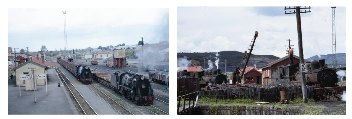
Ka 953 and Ka 956 at Huntly & (right) three Bb class at Huntly in 1966