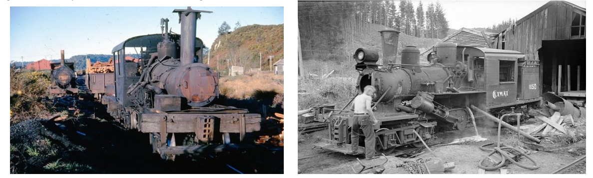
Heisler 1063 at Ngahere prior to dismantling & (right) Washout day at Ongarue. Climax 1650.

American practice log load-out facility on Matahina Tramway with a log loader and bogie wagons for the pulp-wood logs in the early 1950s & (right) Price Ca knocked about at Steel Bros Mamaku 1955