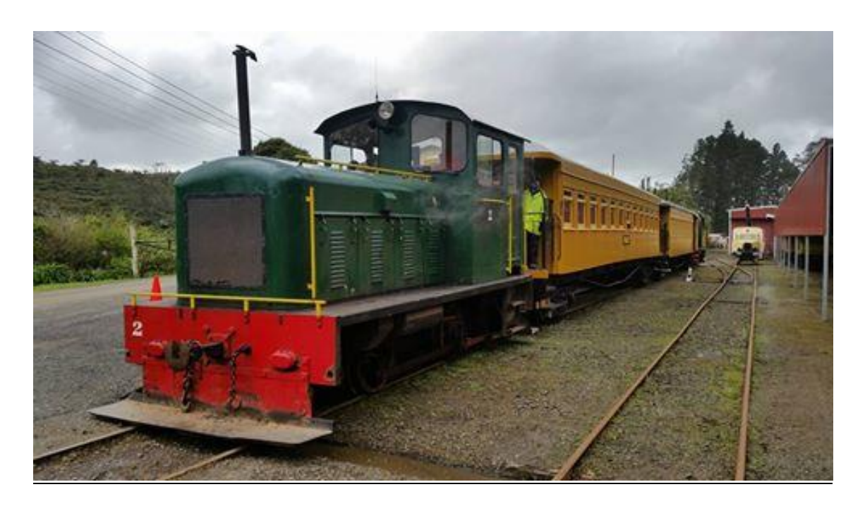
Meremere Diesel 402 at the September Open Day with its train