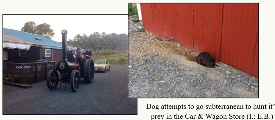
The Blue Rooms look new compared to this beauty! (I.: R.E.)