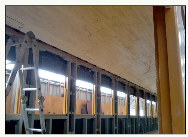
After much work, there is again a celling!