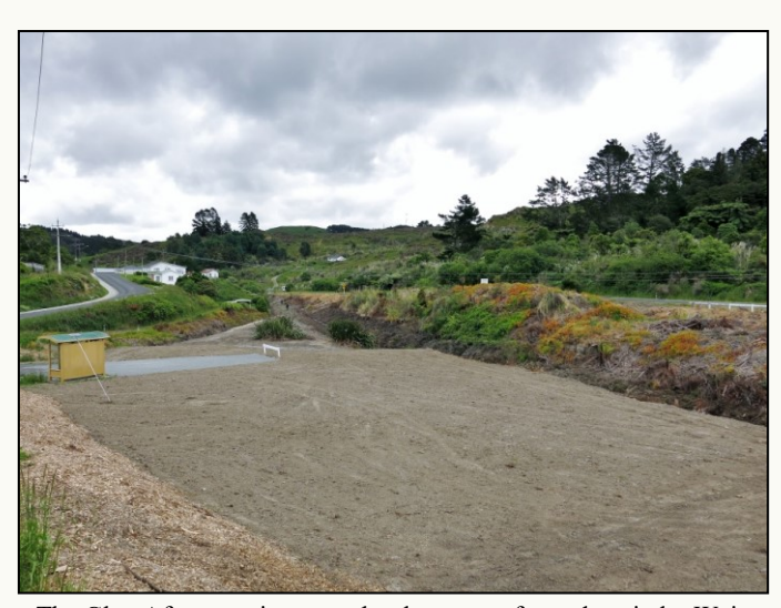
The Glen Afton terminus area has been transformed again by Waikato District Council work!

Please pencil this date on your calendars. Our usual shunting