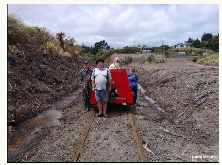
A very special jigger ride, The first rail vehicle to Glen Afton in 42 years. 11/12/2015

school for new and operating members will be held before the AGM.