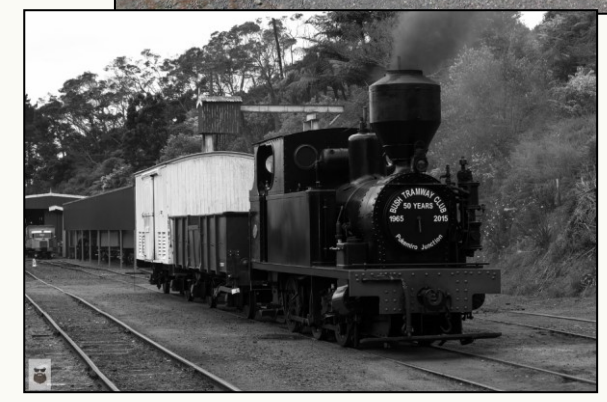
Looks rather dashing with it's 50th board on doesn't it? (I.: G.C.)