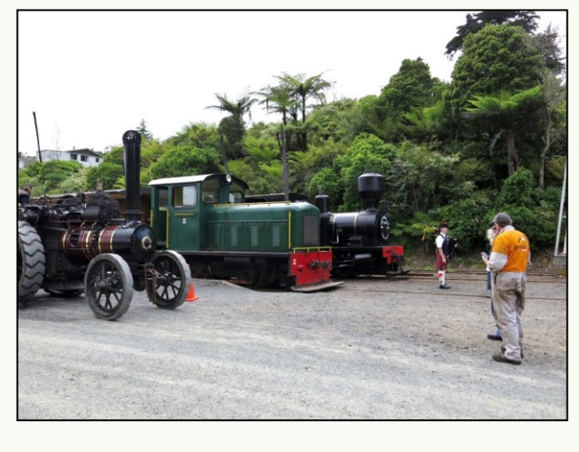
The big (as in tonnage, excluding the people) stars of the day. Nice to have steam out numbering diesel. 401 rams out so much smoke it should be an honorary steamer. (I.: E.B.)