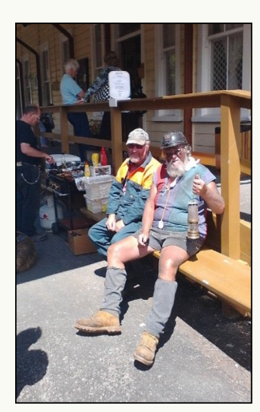
One of the "period" costumes of the day, a dirty young miner with helmet and lamp.

A special thanks to everyone who helped on this special day.