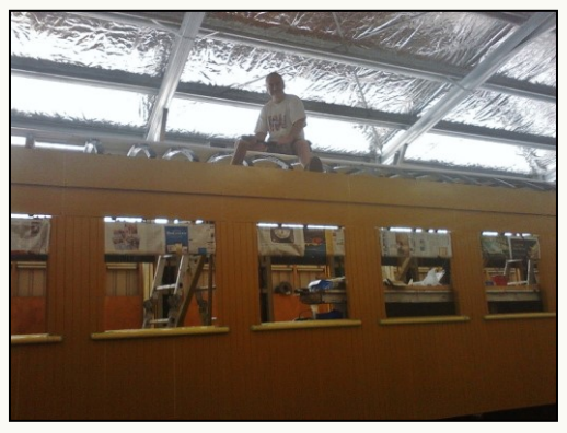
David on a lack of roof,. Is he building or is he demolishing?