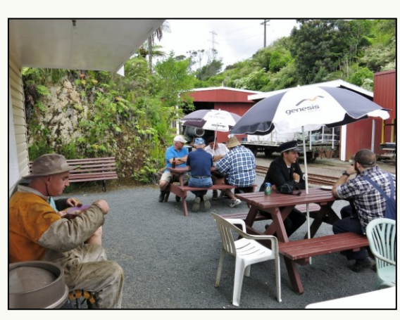
The end of year dinner was enjoyed greatly by those in attendance. With no worry of running out of deserts!