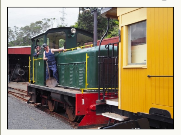
Just another miner on his way to work on the December Open Day