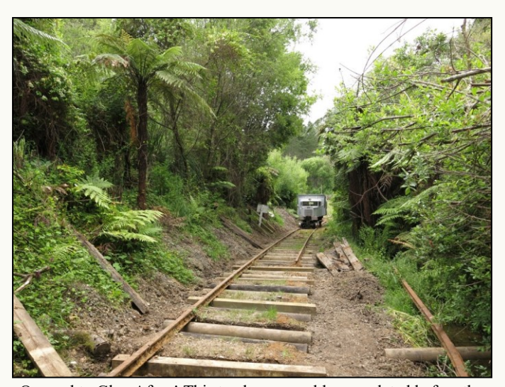
Onward to Glen Afton! This track presumably completed before the jigger trip to the end of the line.