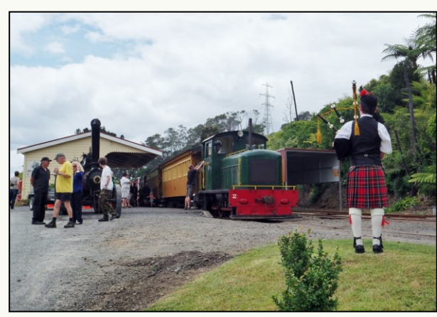
Thanks to piper Kevin O'Hara the departure and arrival of each train was met with the striking sounds of old.

Come along as there is always plenty to do.