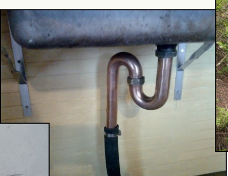
Copper U-bend, only in the shanty. (I.: R.E.)

The cutting to Glen Afton is the bushiest bush on the line. Hopefully we can keep it that way while making it operational. (I.: E.B.)