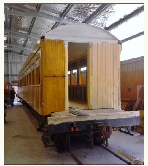
The new open air experience.

Once this was completed it was time to put a new set of timber on top of the rib to enable the steel roof to be fixed to it. All of this timber was painted before being fitted to the top side and the inside roof lining was tackled in a similar manner.