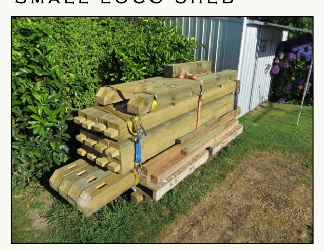
This is one kitset you wont be finding at the hobby shop.