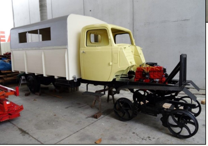
Mamaku Jigger No.2 up in Auckland. Cab, motor, passenger compartment, it's all coming along splendidly!

The cutting to Glen Afton is the bushiest bush on the line. Hopefully we can keep it that way while making it operational.