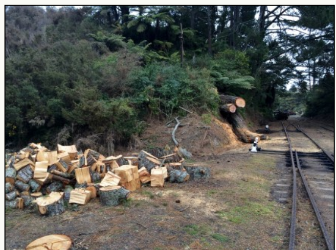
There are still some logs to be split for anyone who feels like some exercise.