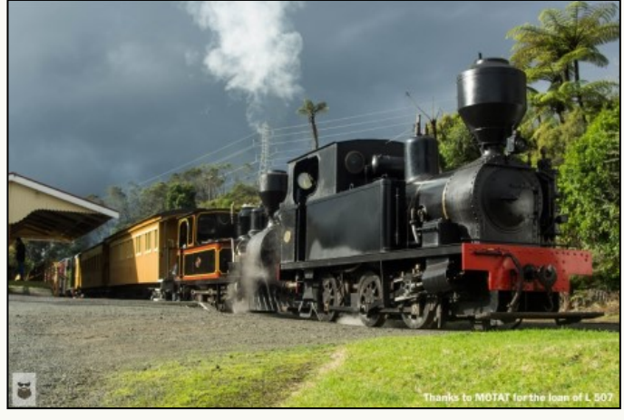
The Peckett and L 507 basked in rare winter sun on the Friends & Family Play Day.

Since the last newsletter we have run another charter trip. We have another 2 days of charters in the pipeline and enquiries for some more. Thanks to those who come out and