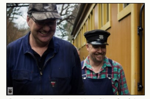
Days result: Two happy loco drivers.