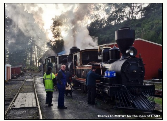
The L, the Peckett and behind them the Cb, steaming up in the cool morning together.

Just before our June open day we received our CB loco back from MOTAT followed a few days later by the L.