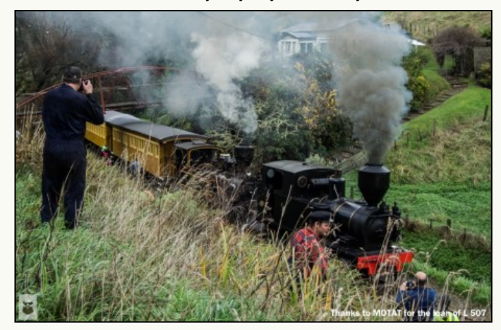
The hill swarmed with cameras when the F&F Play Day train reached the top of the line.