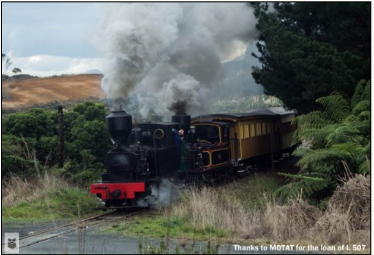
A double header of steam approaching the Hangapipi Rd crossing on the Friends & Family Play Day.