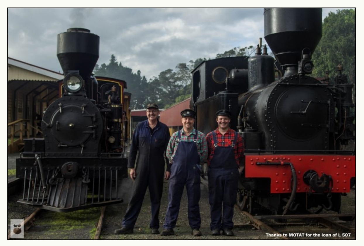
MOTAT's L 507 and our own Peckett at the junction, complete with drivers.

Duct tape is like the force. It has a light side, a dark side, and it holds the universe together. -Carl Zwanzig