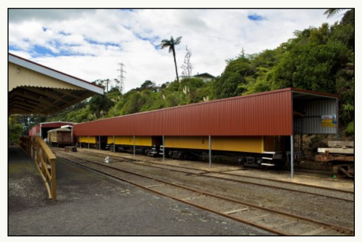
It's surprising how much bush is visible over the top

This was erected over eight days in early March and now holds the Bunk car and our two working carriages with a little room to spare. This is the first time in their long lives that the cars have been stored under cover.