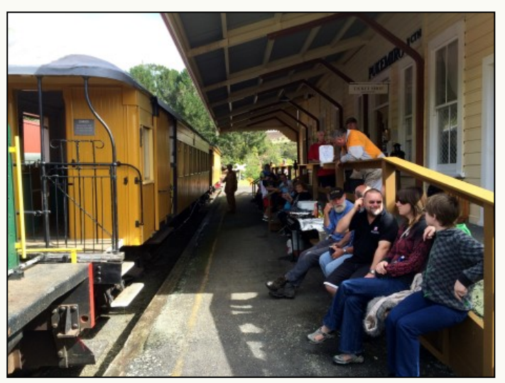
The first of many Open Days of this special year