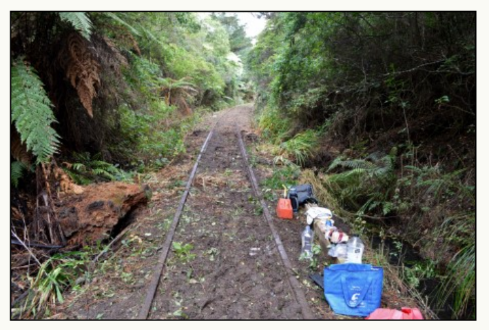
Looking back on the same section as above, transformed!