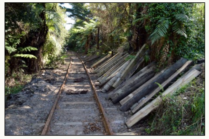
Once cleared the track can be re-sleepered