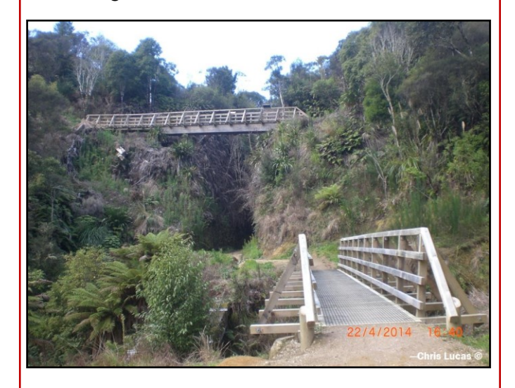
Answer on page 5