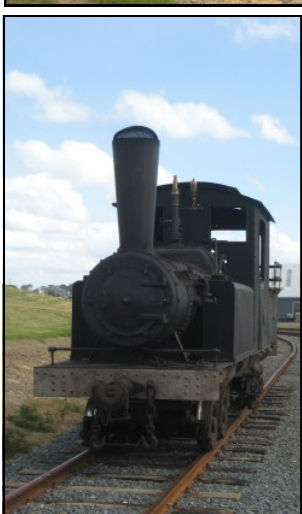
Adventures at MOTAT: January 27th

Clockwise from top left: Cb117 pulling a load of passengers in an L wagon away from the platform at the top station.