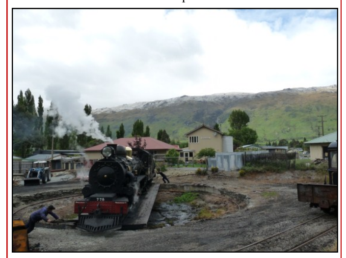
Clue: It's near a large lake.