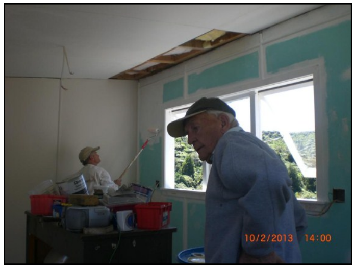
The second shanty is coming along nicely with the paint brushes (or rollers rather) being put to good use.