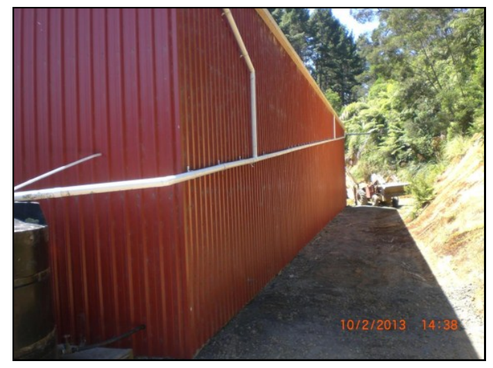
Above is the space where the new small loco shed is to be built and on the right is the relocated water tank which was formerly behind the shed.