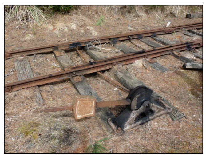
Our CW crew spent a day in mid-January replacing a rail on

the point into rotten row, at the top of the Pukemiro Junction yard. The web on this rail had rusted through so the head had collapsed.