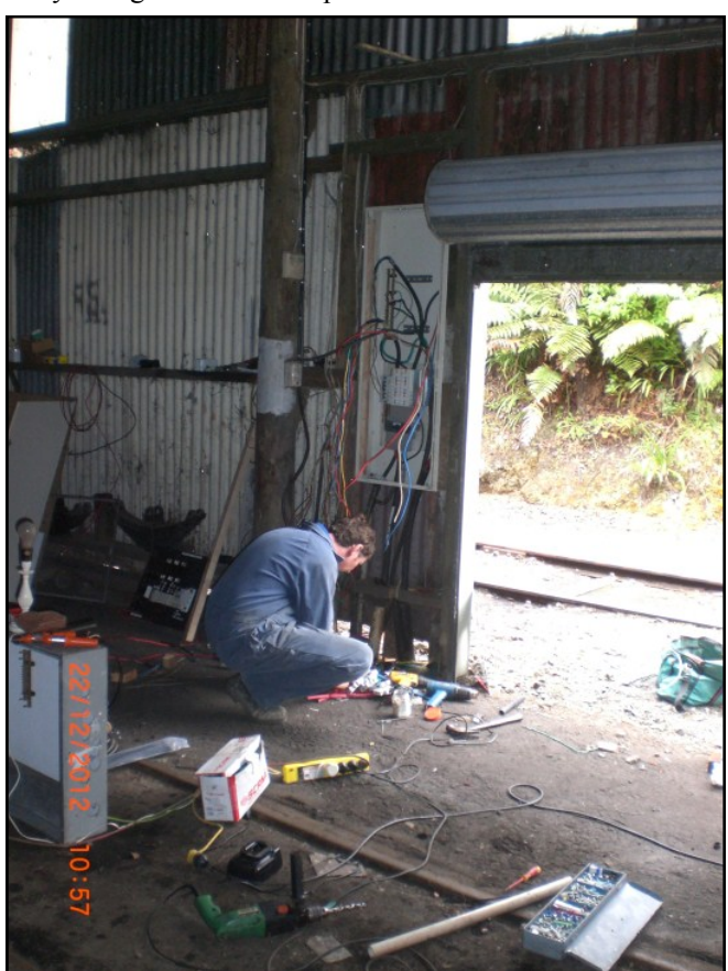
The job is largely completed, until we buy the new fittings.

Many years ago, in Lofty's days, we were told a new switch-board was urgent. We lashed out and purchased what he required and then it sat in the loco shed until Trev plucked up the courage to dismantle the old one and install the new one. To do this, he had to shut all power off, a job that took most of the day. Unfortunately, some of our new fittings aren't heavy enough so we had to purchase more.