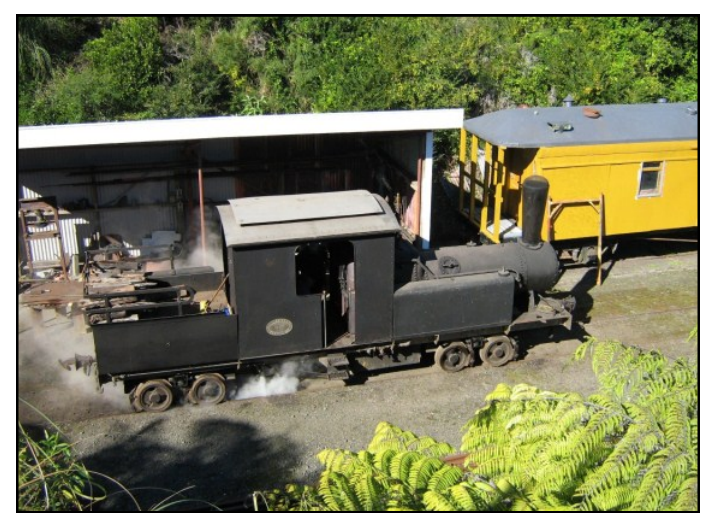
A lovely view of Cb 117 taken from the top of the hill on the May Open Day.