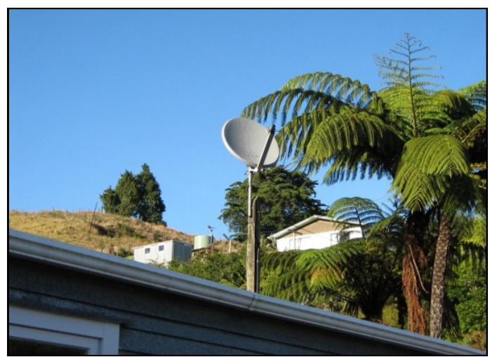
The club has joined the rest of the nation in the switch to digital with a satellite receiver. Now we just need something to decode the signal it's receiving from electronic non-sense!