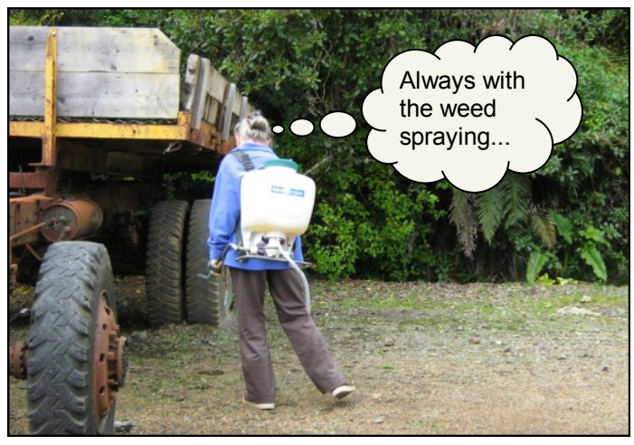
GRANT FOR PECKETT

A CW crew spent most of a day raking up and getting rid of pine needles at the top end of the yard.