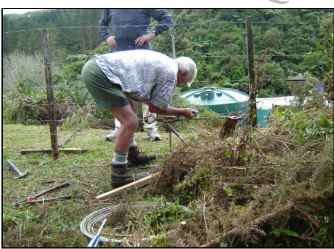
Here we have Kelly Gifford and Ian Hampton (well most of them) repairing the track boundary fence. A unpleasant but necessary job. Keep up the good work.