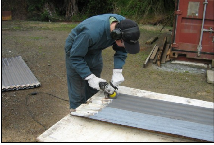
In what some might call a rare sight, here we have the editor at work with a grinder preparing the slightly used corrugated iron for the roof seen in the picture on the left.