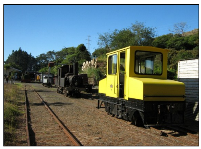
Another sight from the May Open Day: the Goodman, Cb, and Mamaku Jigger in a line, with 402 in the background.