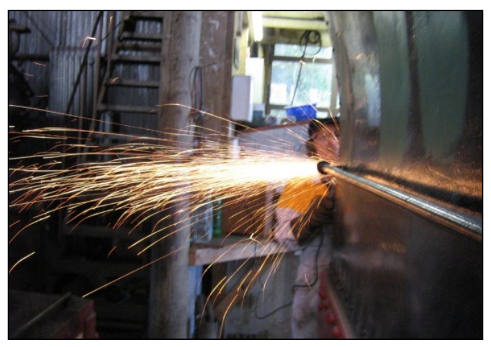
Ian B has 'tidied up' some cracks in the welds on the bunker patches.