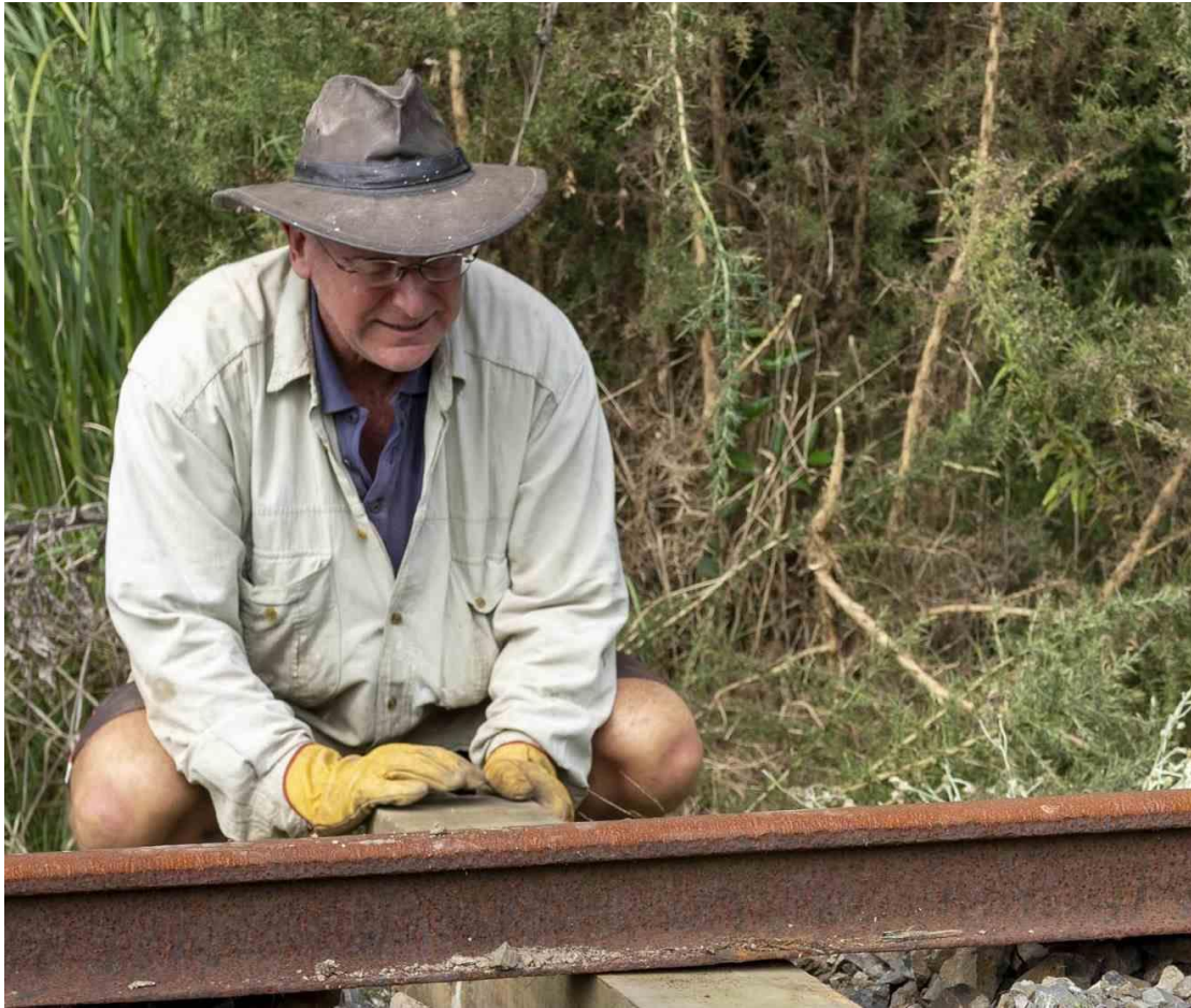
JS inserts a sleeper at the recent sandfill working bee (Kayne K)