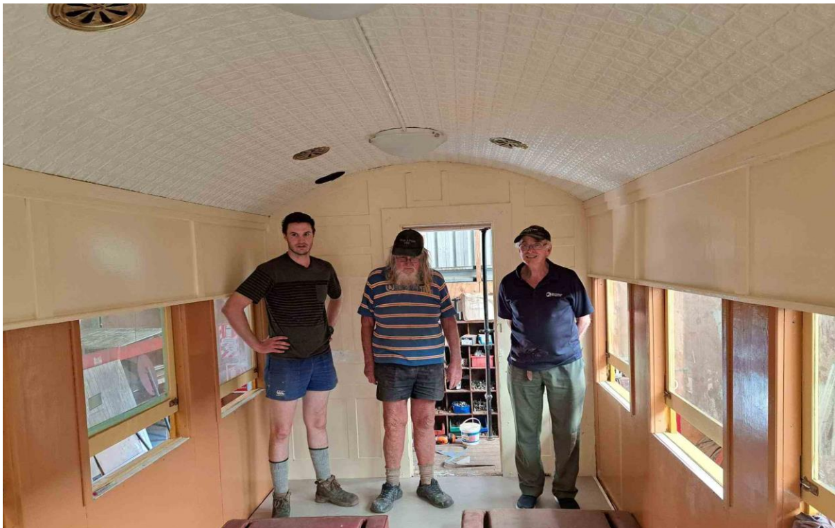
A1477 towards the end of the recent work – the new floor is installed c/w vinyl and the seat squabs purchased from Goldfields Railway demonstrate the somewhat narrow aisle that will eventuate once the seats are installed. The team spent a day vinyl gluing (R. E.)