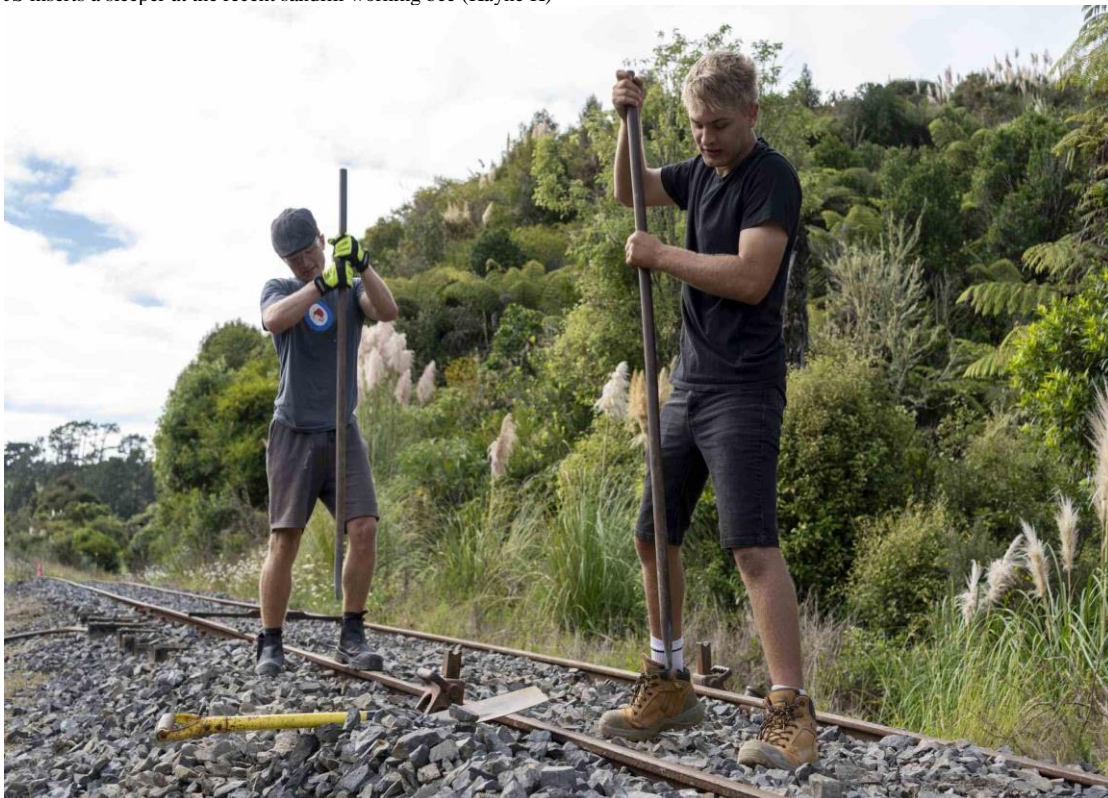
Sandfill action at the recent track working bee – this was highly successful as well as being hard work!