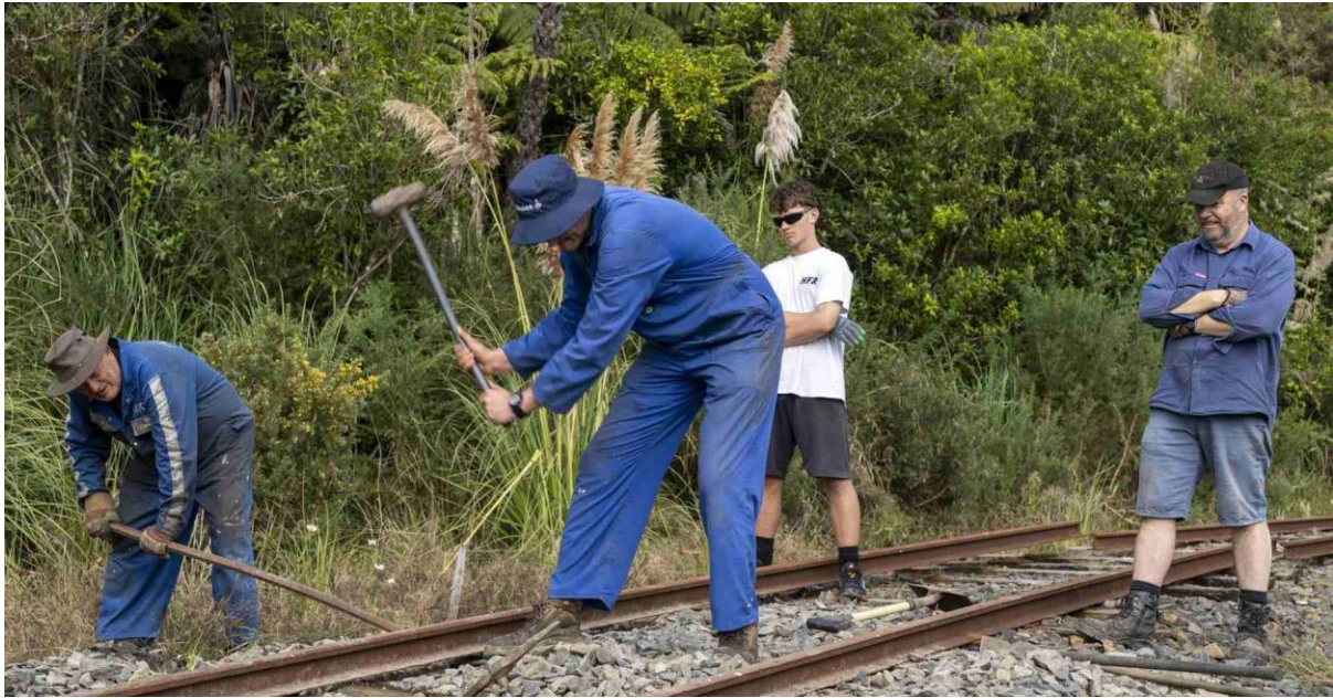
Activity in early April on the sandfill (Kayne K)

We have had another visit from the CW crews. This time they replaced 2 rails on the track leading into the woodwork shop where the webs had rusted out. They also replaced 6 sleepers under one of these rails. There are still a few more rails like this in Pukemiro yard that have to have the same treatment.