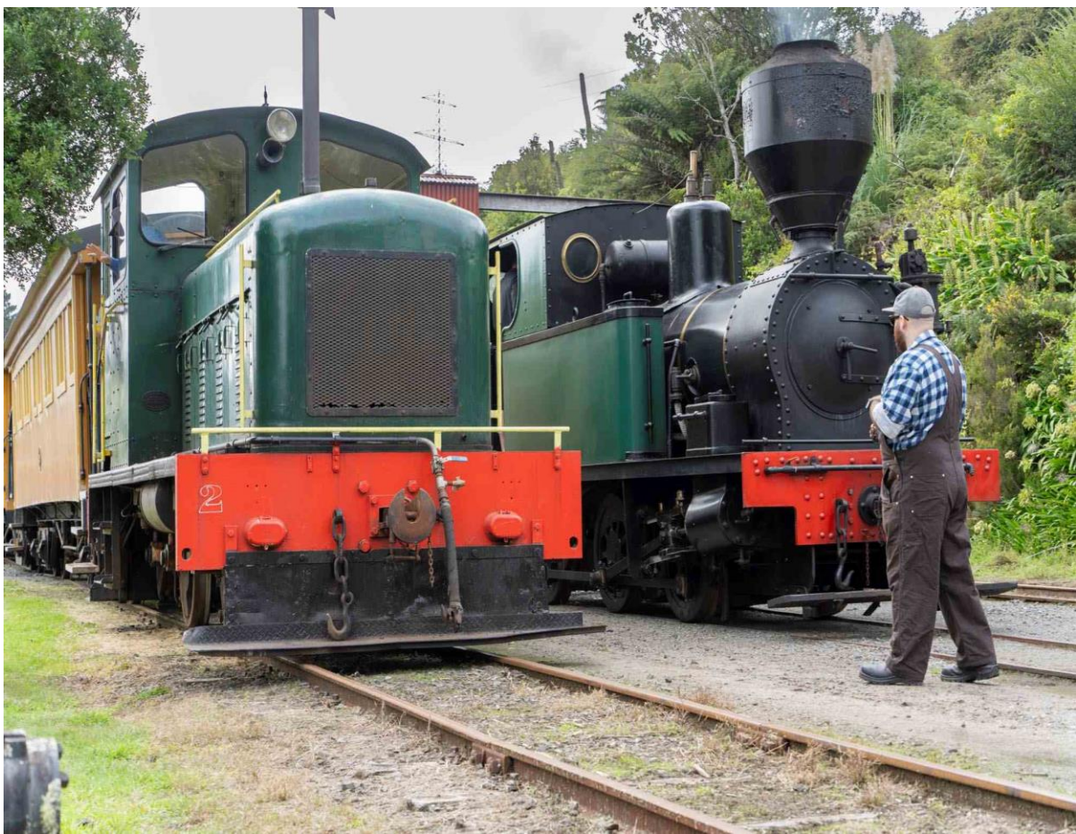
The Peckett & Meremere diesel 402 at a recent Open Day – Guy C looking on (Kayne K)