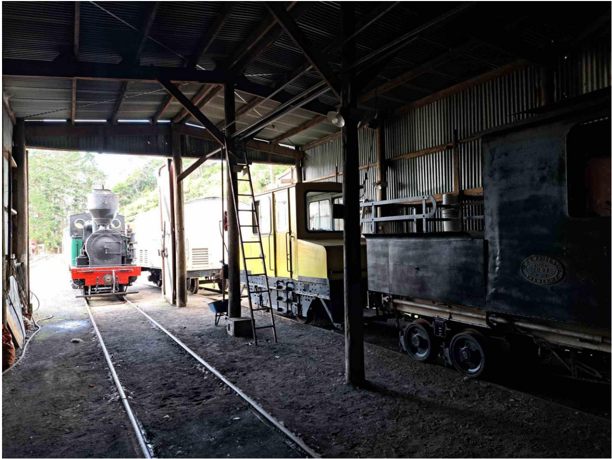
A recent view of the loco shed interior at the Shanty end