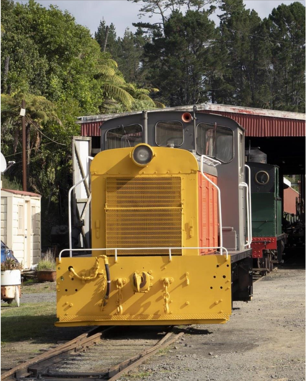
Tr459 outside the loco shed recently (Kayne K)