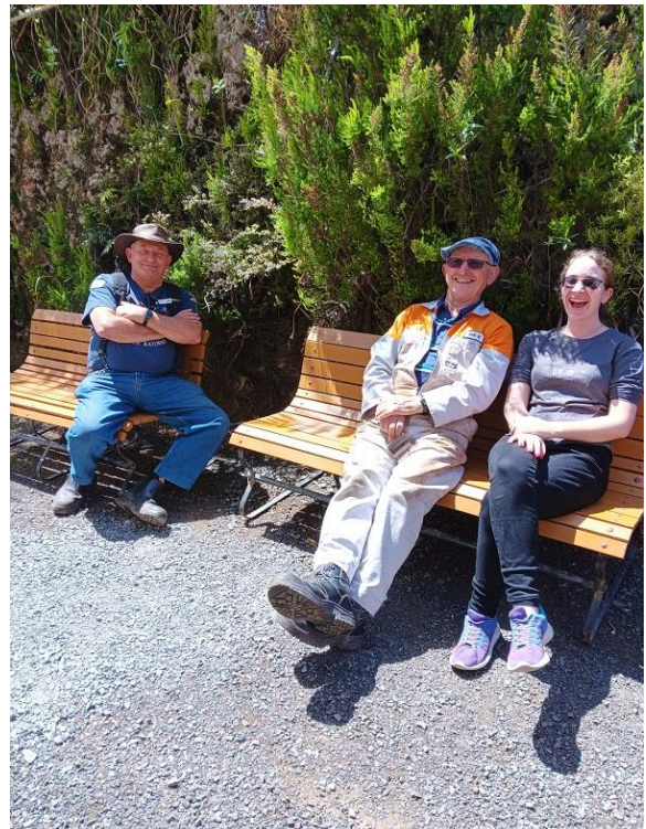
Members at the November Open Day in action...or simply relaxing.(R.Cook)