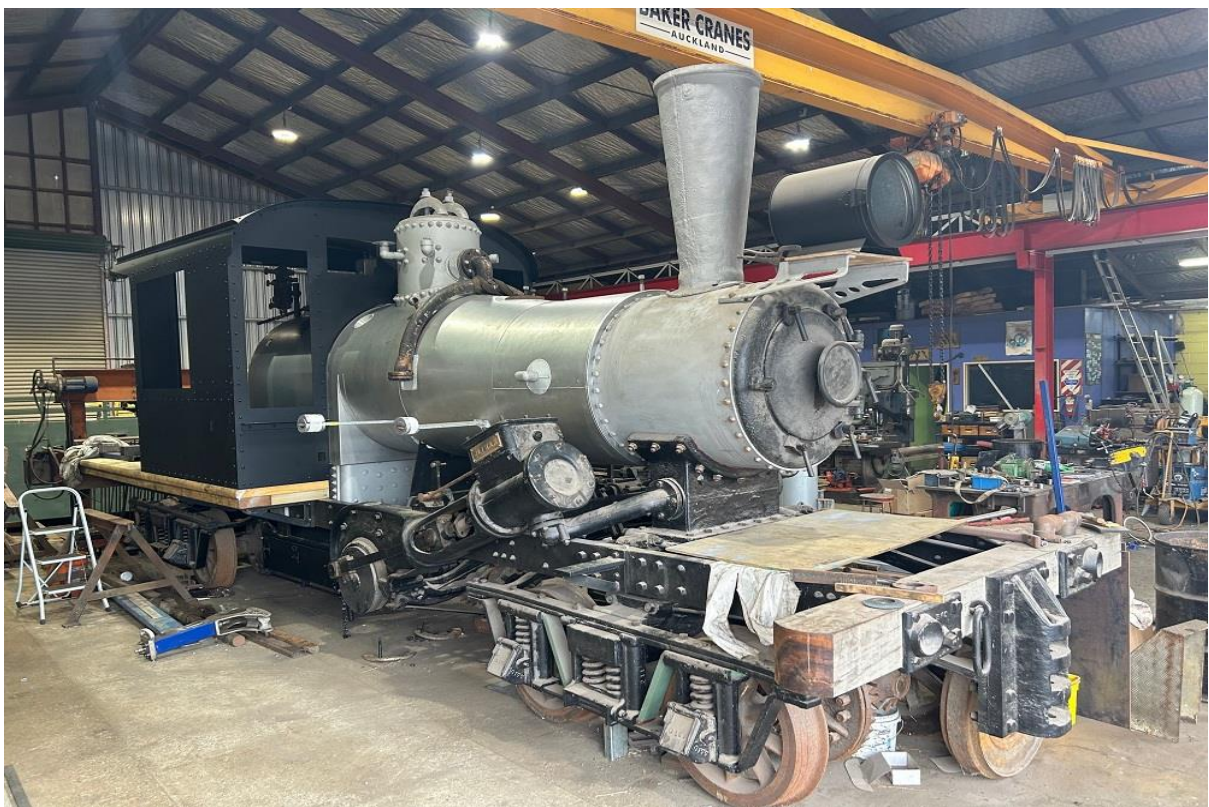
The Climax (off-site) has recently had new boiler cladding installed (C.Mann)