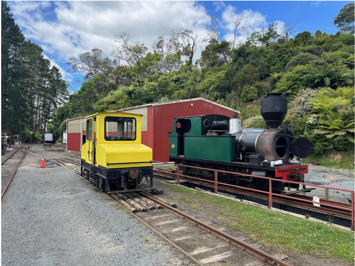
The battery electric loco and the Peckett which was being prepared for its annual inspection at the time