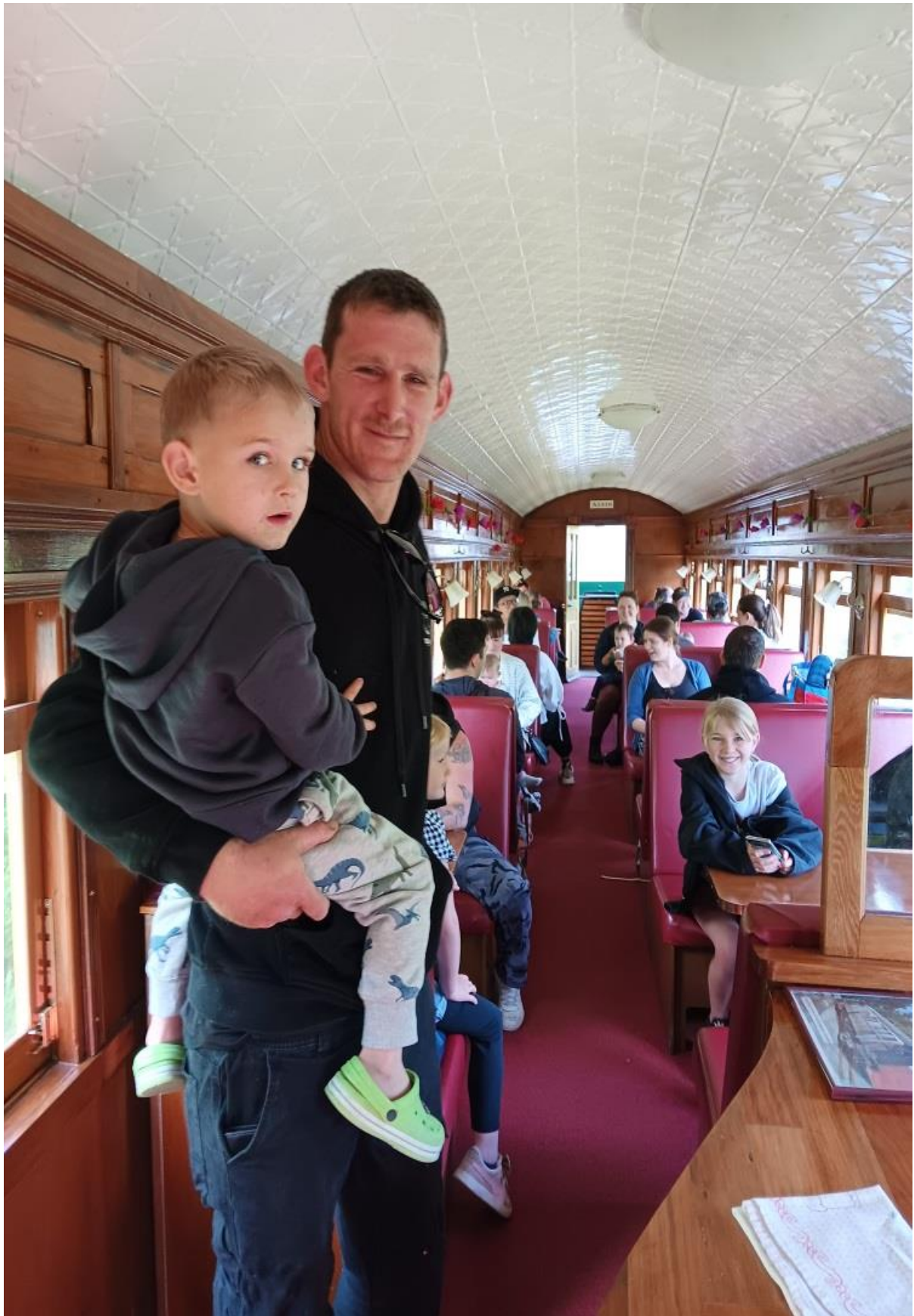
Family fun on an Open Day – a well patronised A1319 “Mary” loaded up with happy passengers in November