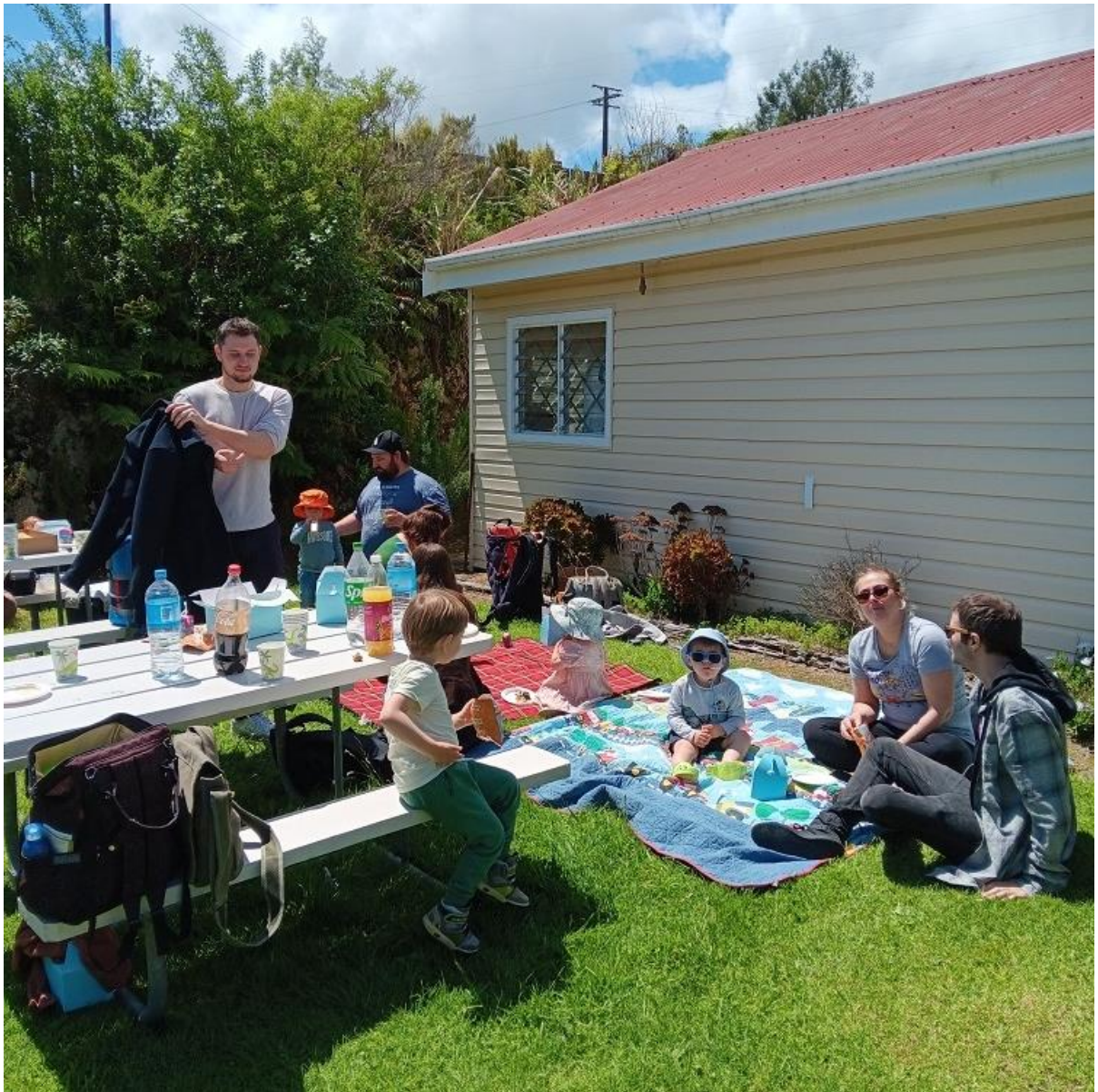
Visitors enjoy a birthday at our railway picnic area in November (R. Cook)