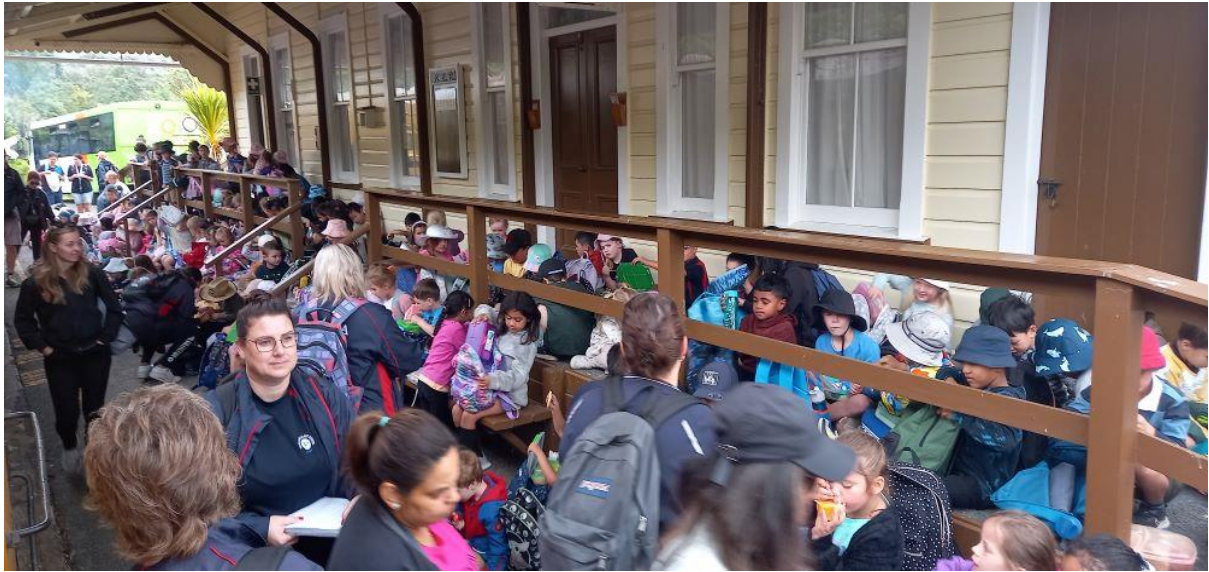
A large group from Te Rapa at the recent charter (A. Turner)