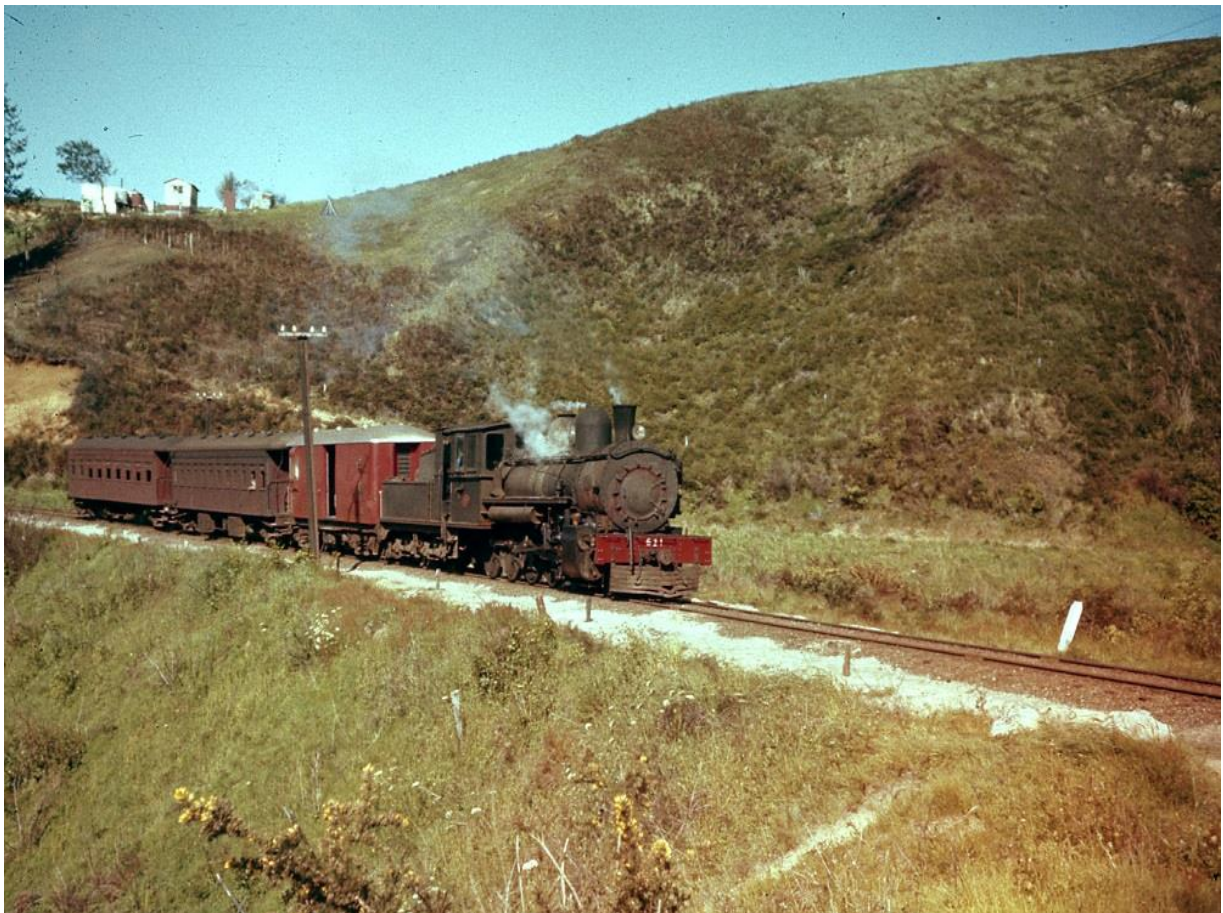
Bb 621 seen here in 1957 at Pukemiro