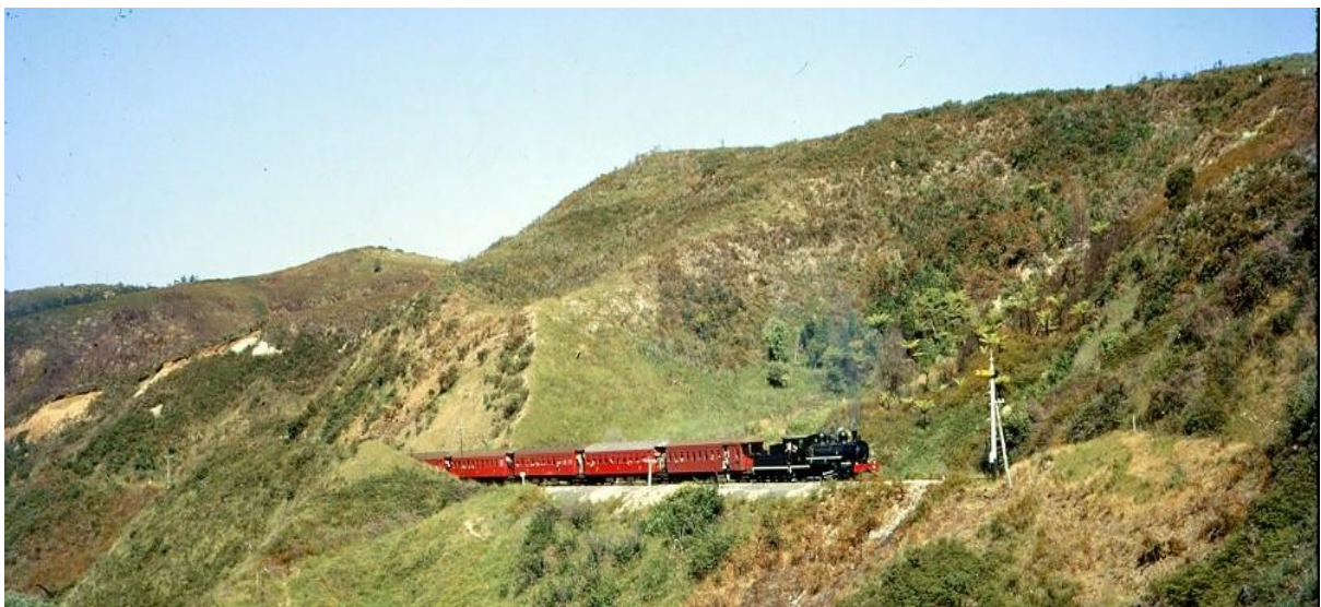
RES excursion up the Glen Afton line with Bb144 in 1961