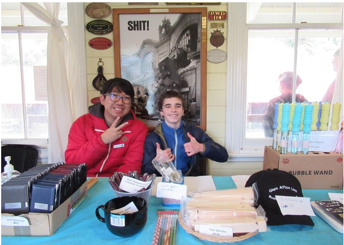
Enthusiastic Souvenir shop staff seen here at the June Open Day (T. Bettison)