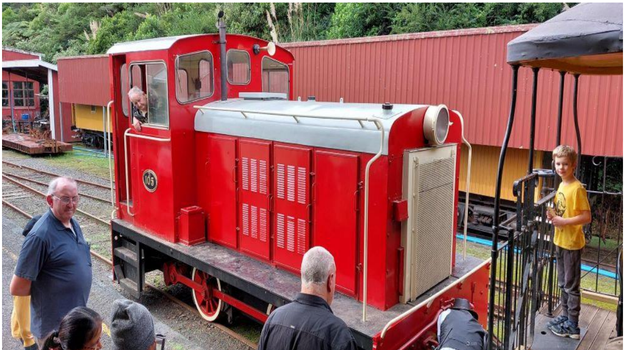
Tr105 is now able to be used on our Open Days after train brakes were fitted (Nampu)