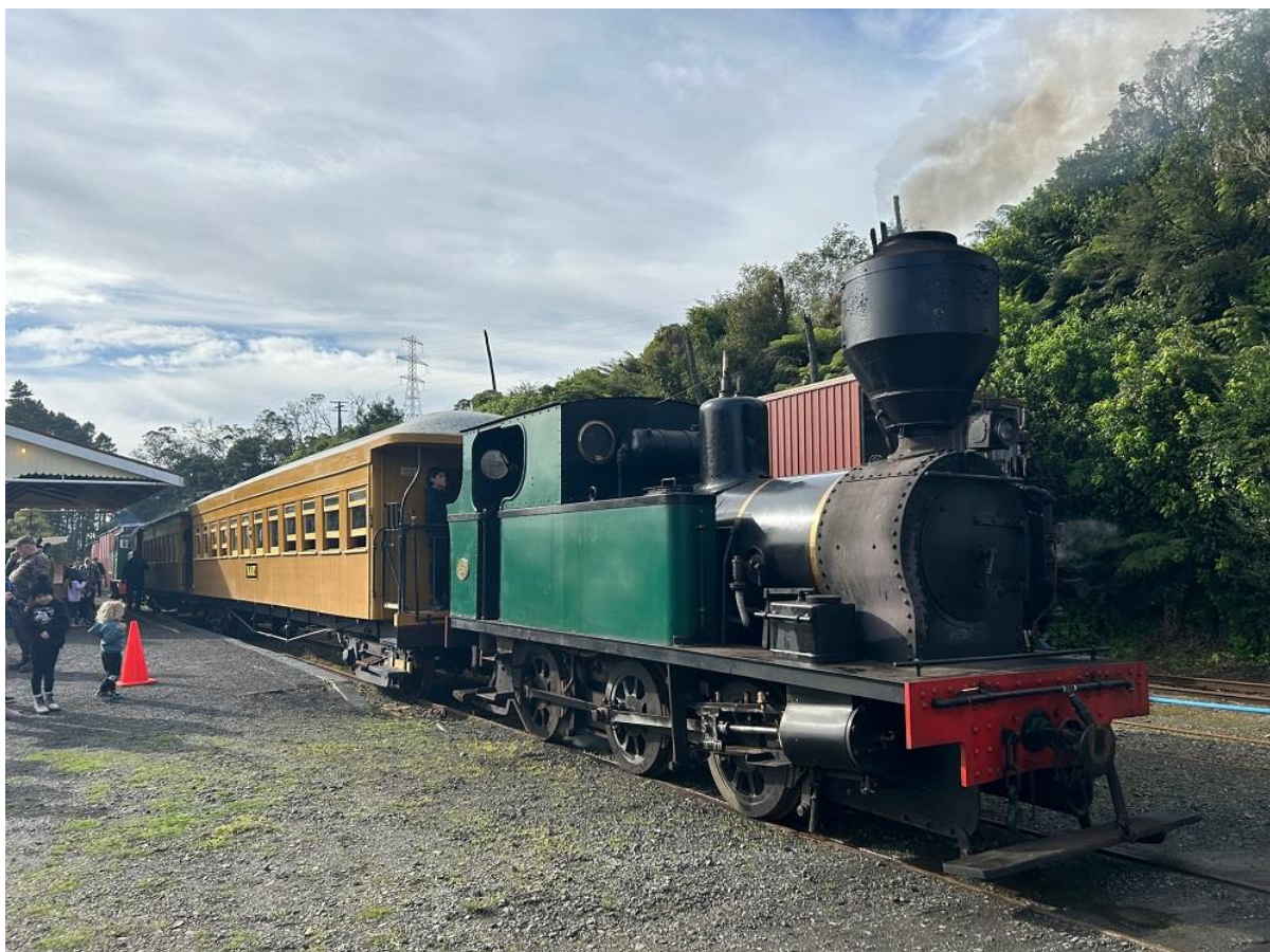
The Peckett with train at the June Open Day (C. Mann)

June Open Day: This can only be described as an extremely busy one. We also had quite a few of our regular members away. I'm told that this was the busiest day since 2017. During the day, we carried 436 passengers plus a bunch of pre-schoolers. The locos in use were the same as the May Open Day. The café sold out of most things; a fast trip to Huntly to restock was done but it still sold out again. A very healthy amount was banked.