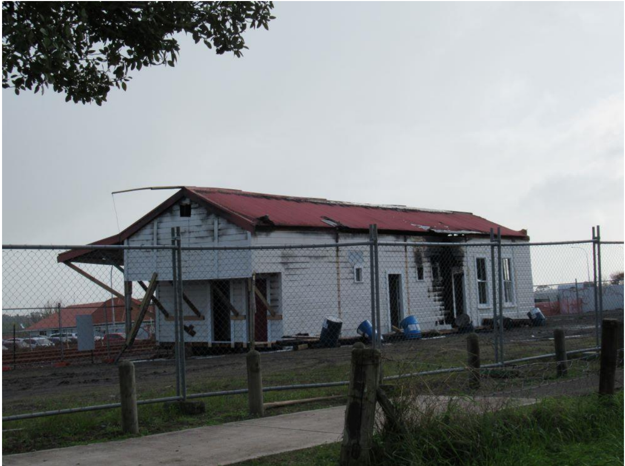
Readers may be aware that Huntly railway station was recently returned to (guess where?) Huntly railway station yard, whereupon it was promptly set on fire by local hooligans....apparently without serious damage (Teresa B)