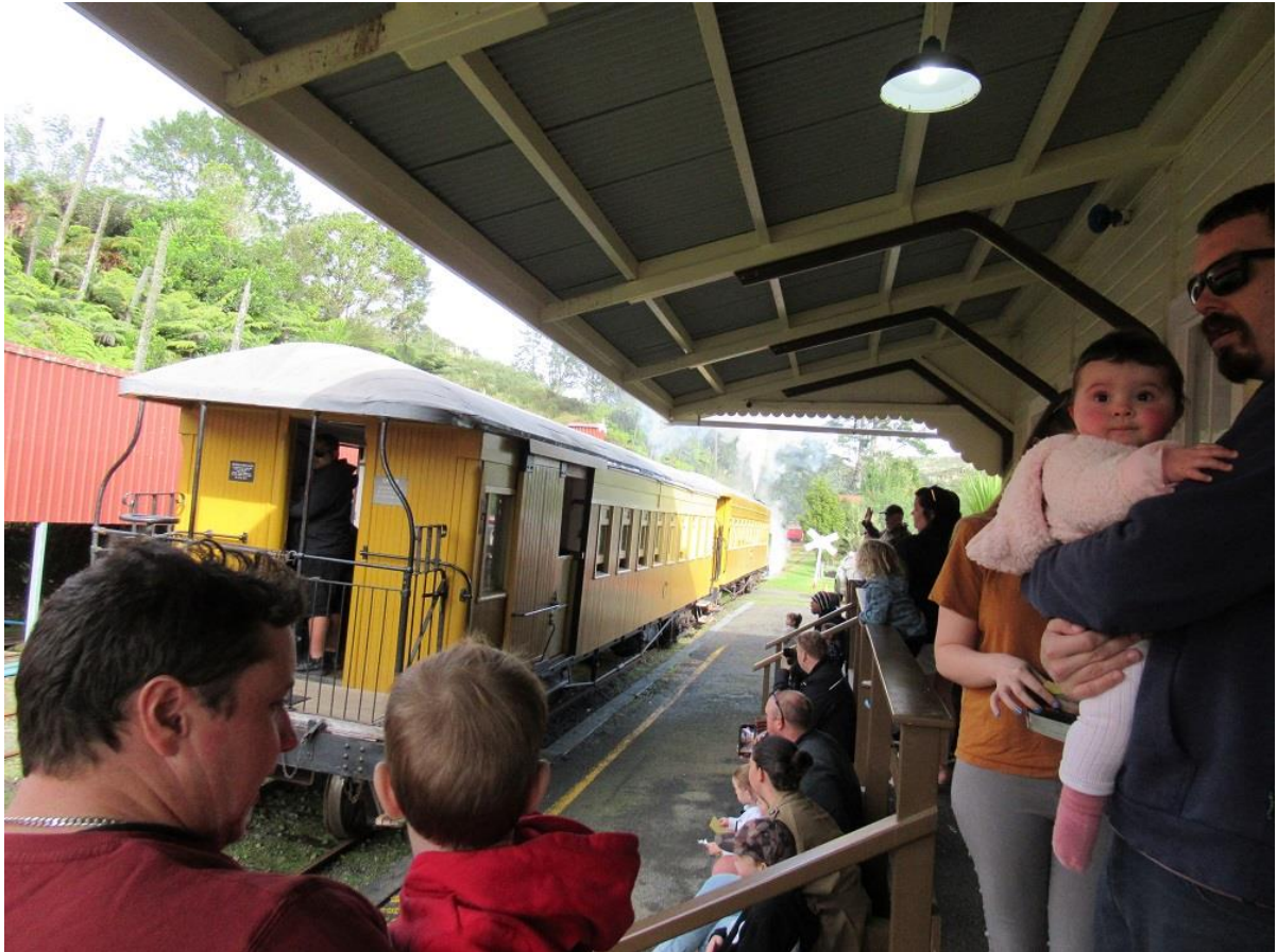
A large Open Day crowd was seen for both recent events (T. Bettison)