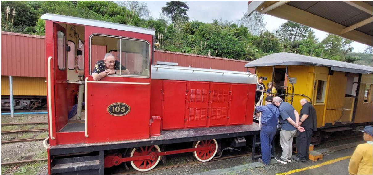
Above: New brass number plates set off the smart appearance of Tr105. . (Nampu). Below: New train brake valve on TR105 (R.Stratford)