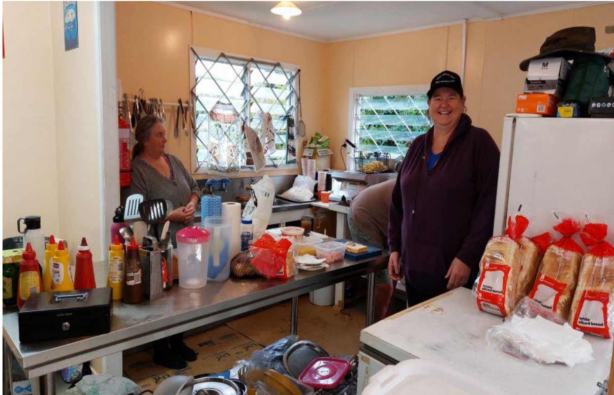
Our enthusiastic kitchen staff seen here at a recent Open Day make a great contribution to the club funds as well as satisfying the hungry visitors

Charter trips: Since the last newsletter, we have run 1 charter & have 4 more planned & a couple of enquiries. Thanks to all who come & make these trips run successfully.