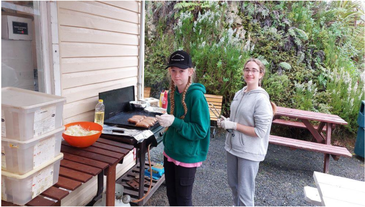
The sausage sizzle is always a great hit with the public (Nampu)