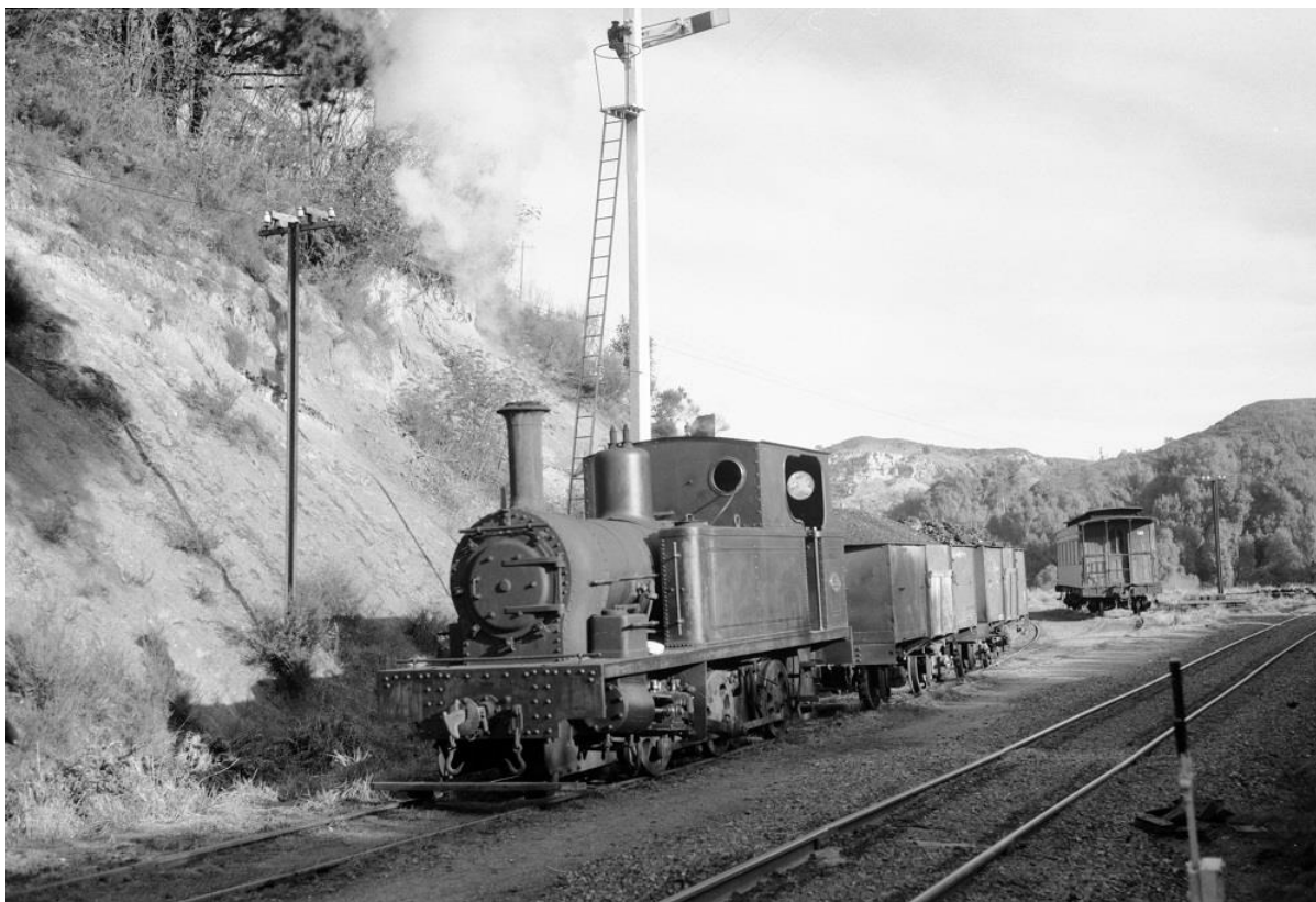
Our Peckett seen here in 1955 at Pukemiro Junction. Readers may not be aware that this locomotive is the only heritage locomotive in New Zealand to have never moved from its original workplace in preservation