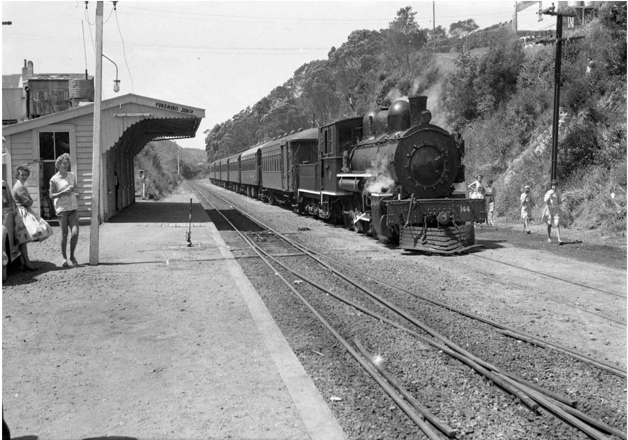
Bb144 with RES excursion train in 1961 at Pukemiro