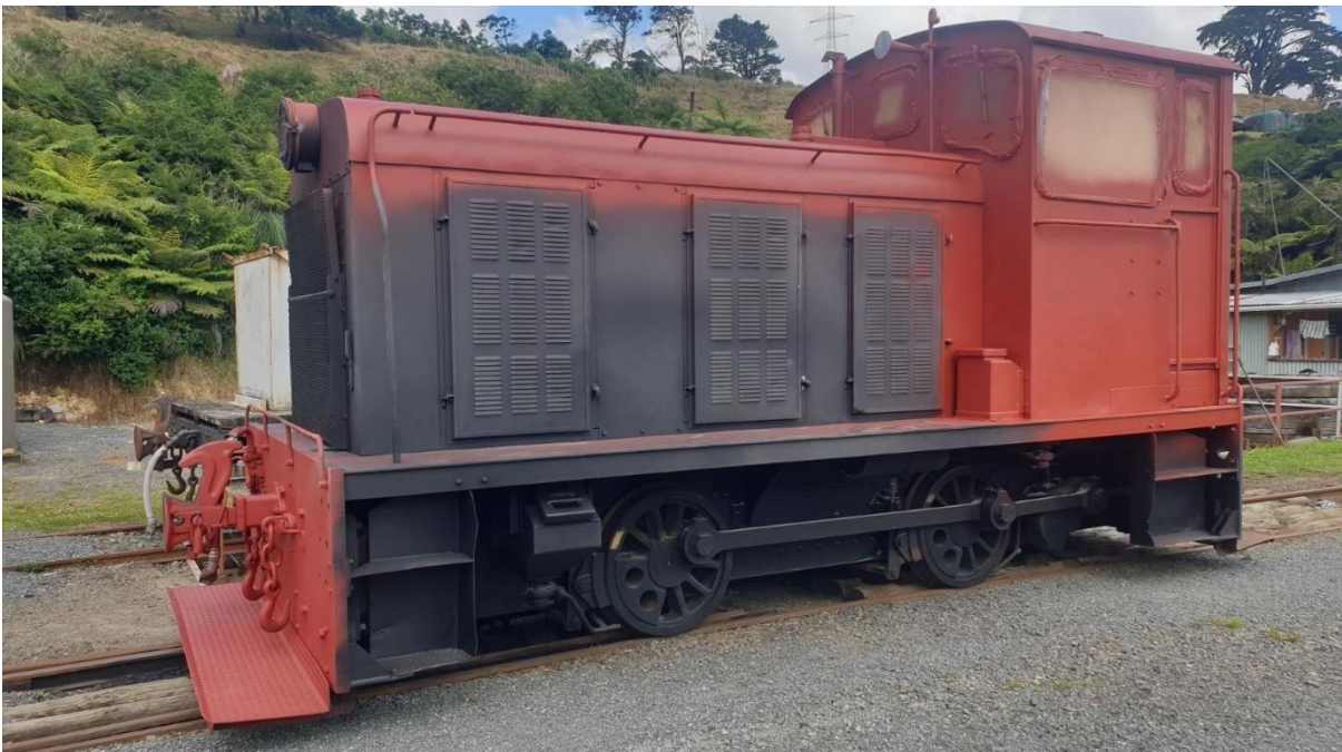
Tr459 seen here in primer after blasting (I. Jenner)