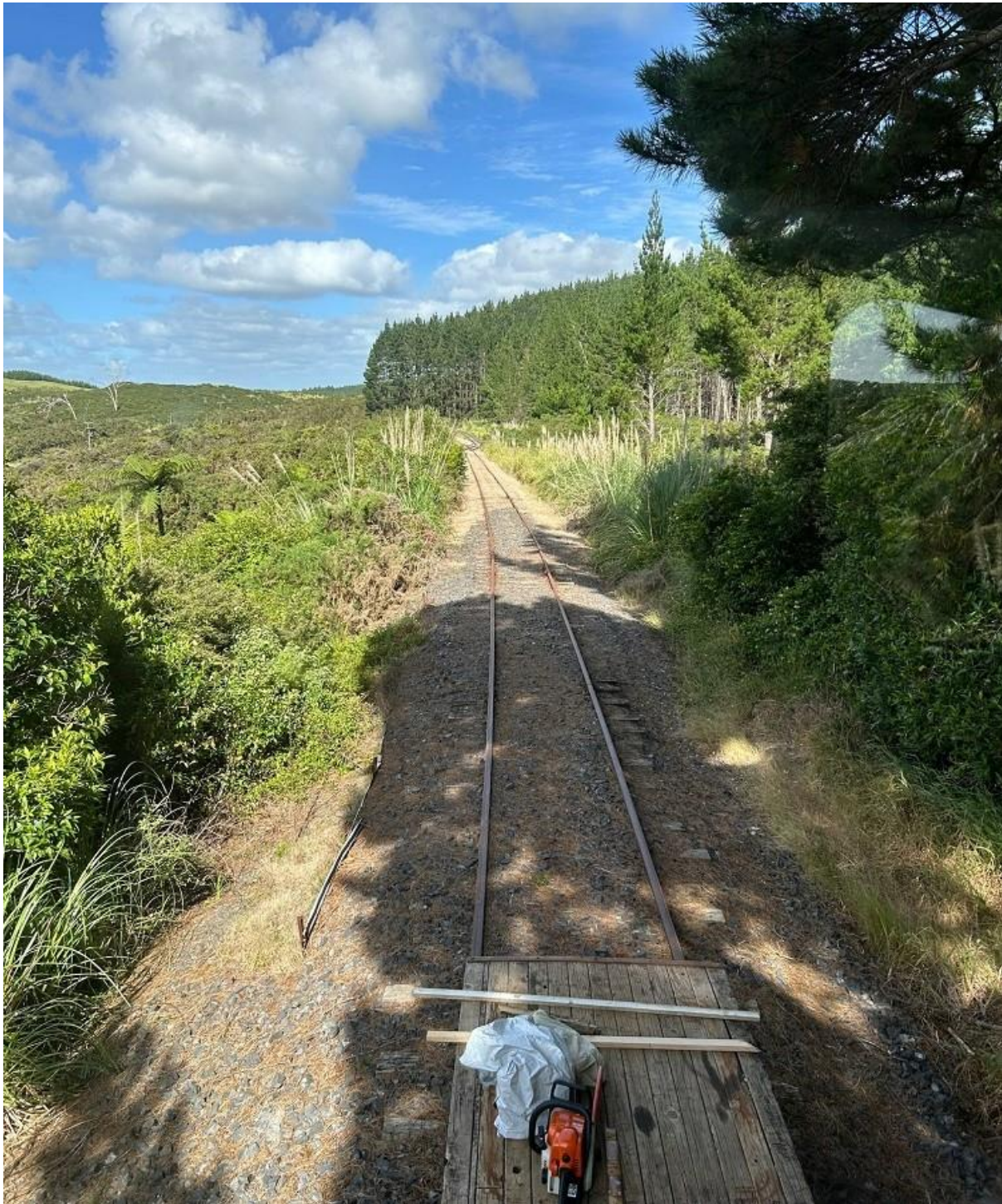
A clear view of our line, with the challenges of keeping the vegetation under control! (C.Mann)