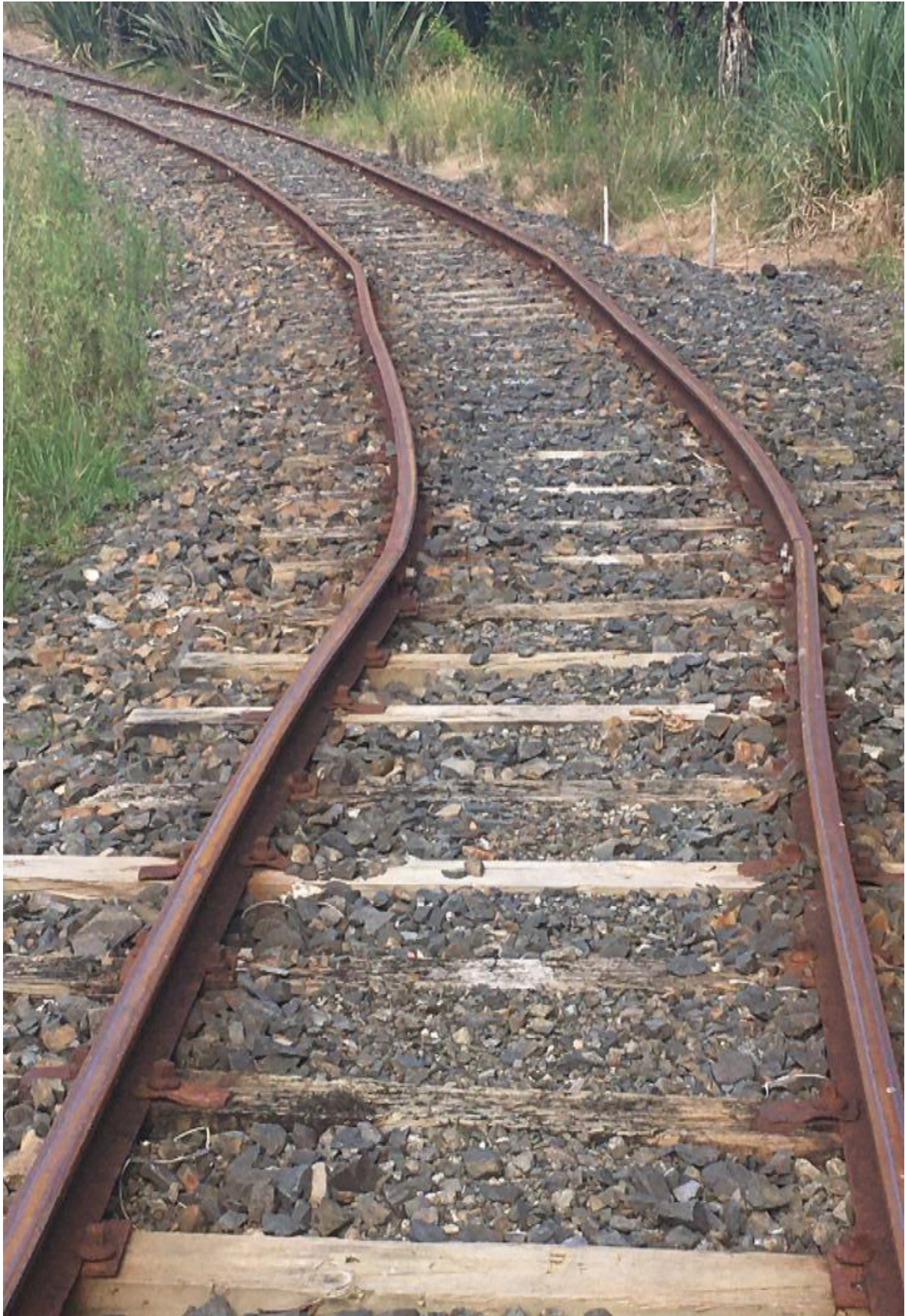
Track issues after the recent events (P. Cairncross)