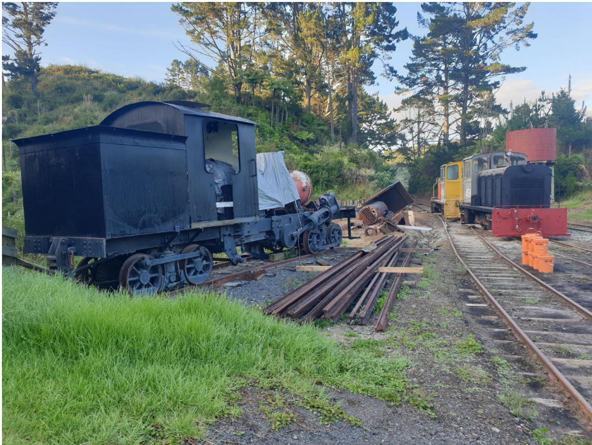
The Price "E" watches on whilst the Tr's get painted in primer at the top of the yard

Tr 105 was noticed during the February open day being driven up & down the yard.