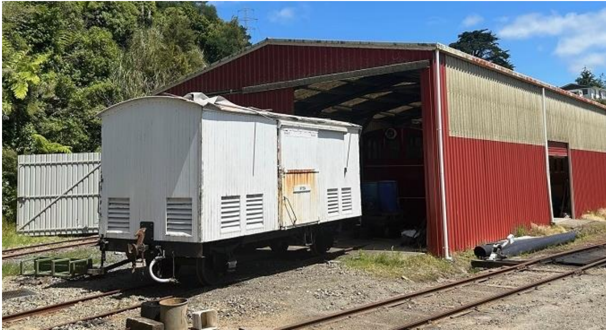
The box van outside the woodwork shop (C. Mann)