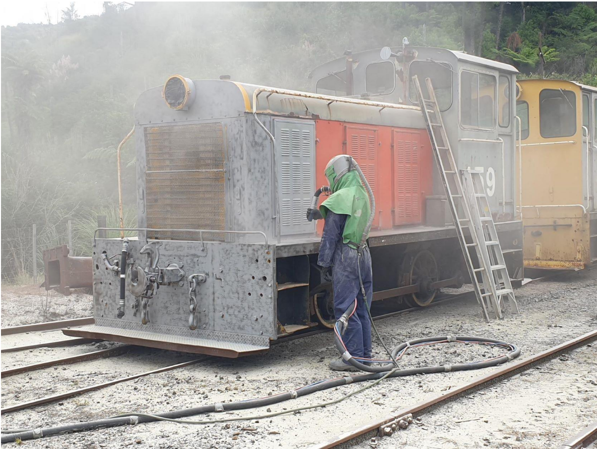
Tr459 gets blasted prior to painting (I. Jenner)

Diesel locos: Tr 459: This loco was glass blasted during the week of 6/2 & then a coat of under coat was sprayed on. Since then, the top coat has been started. Tr 436 is the next to be done.