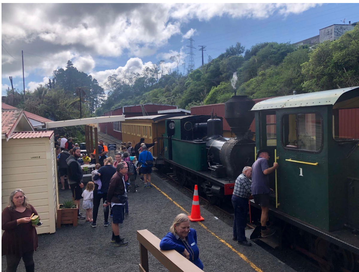
Scene at a recent Open Day

Thanks to all who turn up & help make these days a success.