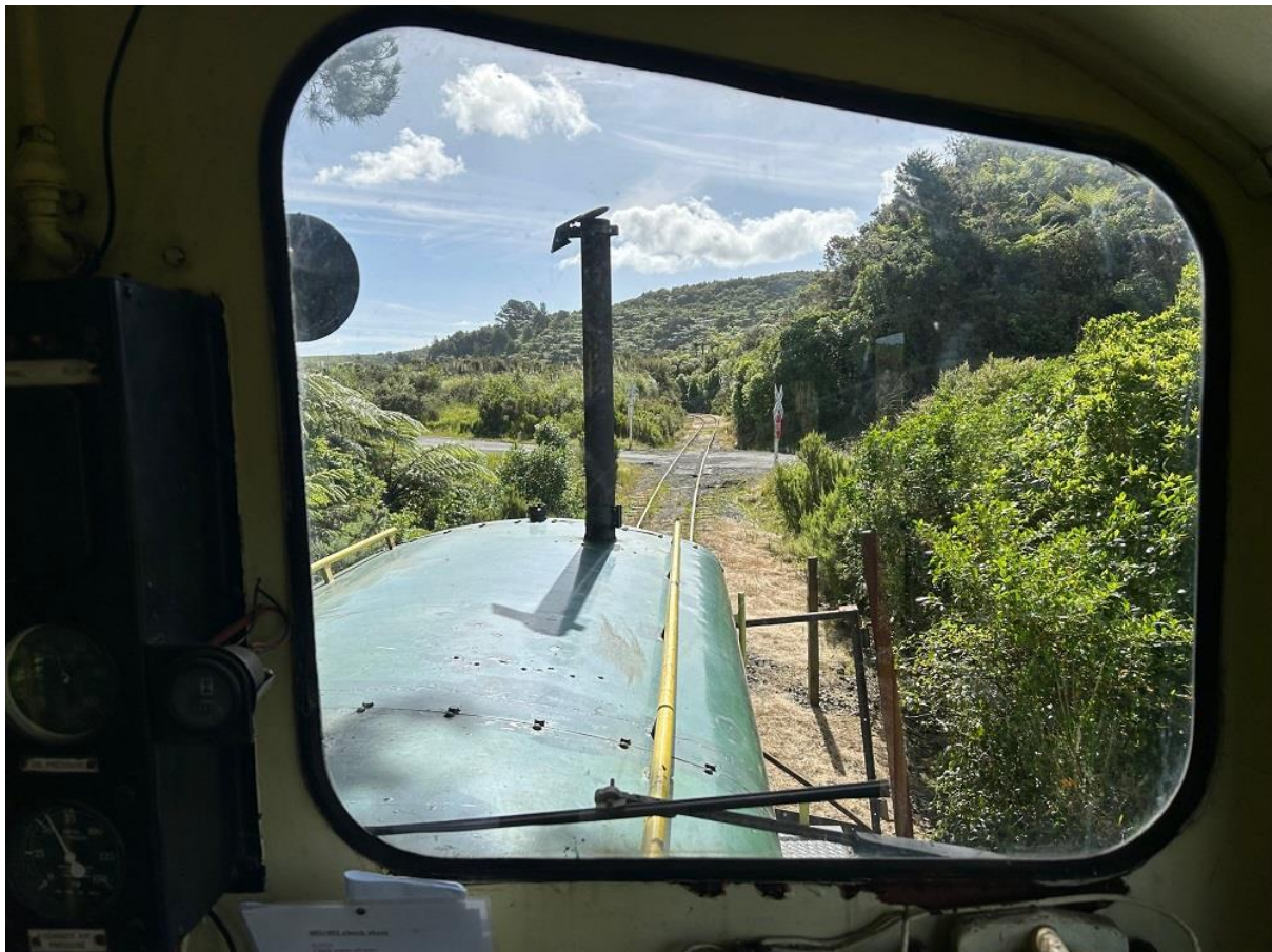
This view from one of our Meremere diesels shows the locality of the vandalism which has recently occurred to our security gate (C.Mann)

This is the second time the gate has been damaged in the last few months.