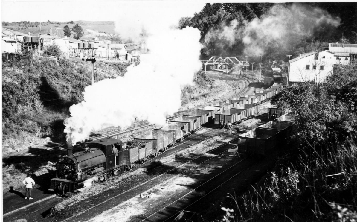
Peckett loco 1645 at Glen Afton colliery 1957