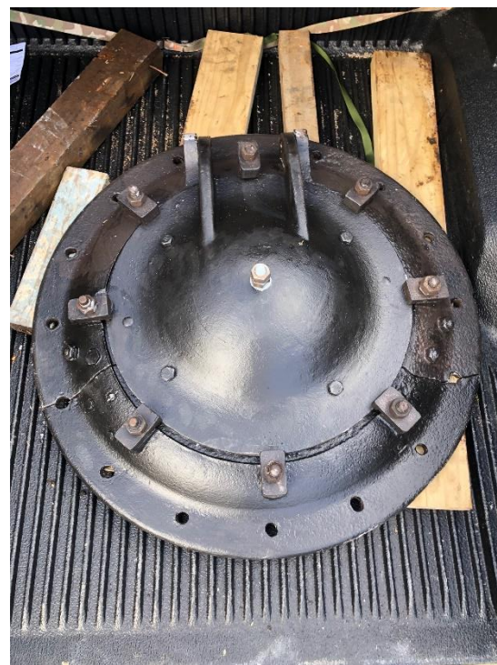
The Heisler smokebox door & safety valves are a focus of attention – the photos show the cracks in the smokebox door surround