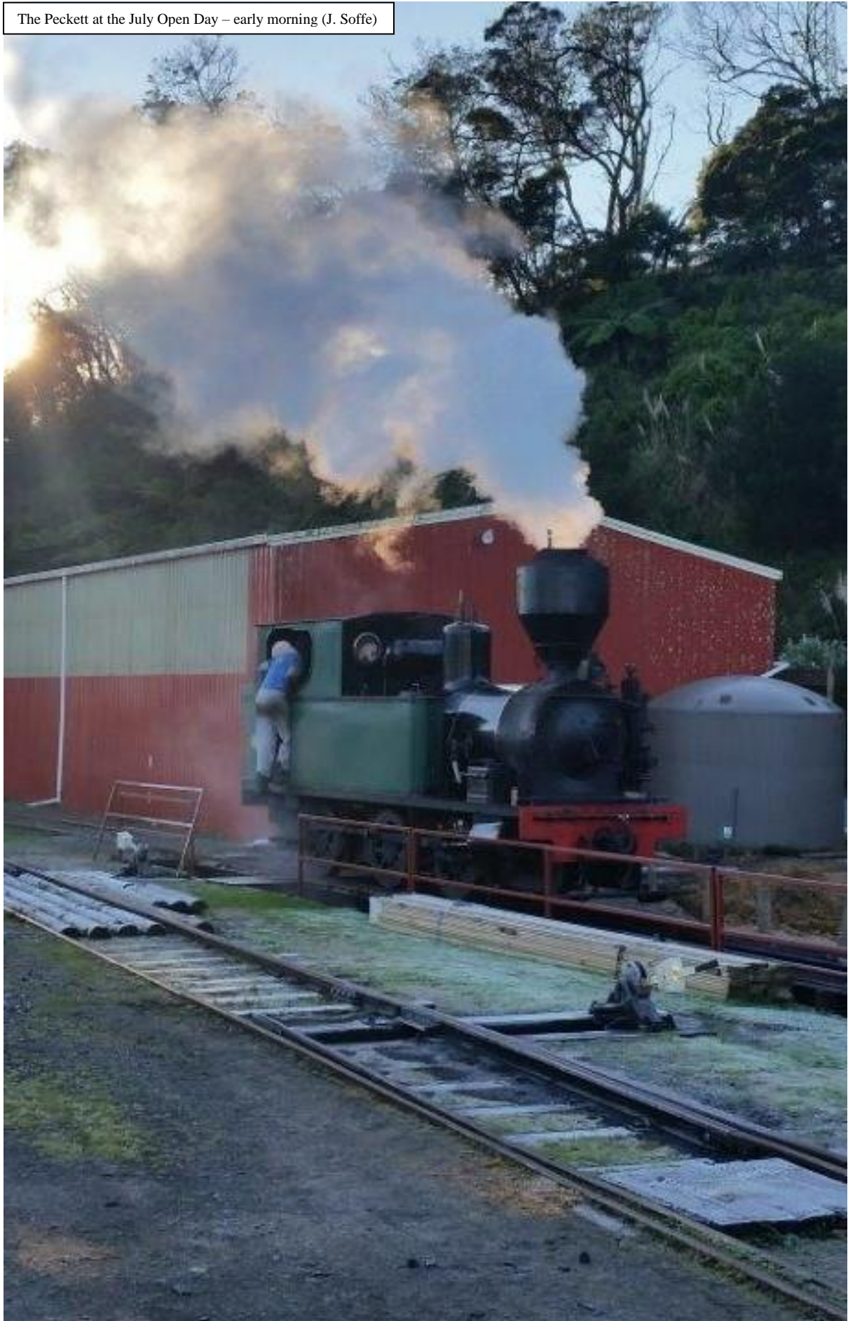
The Peckett at the July Open Day – early morning (J. Soffe)