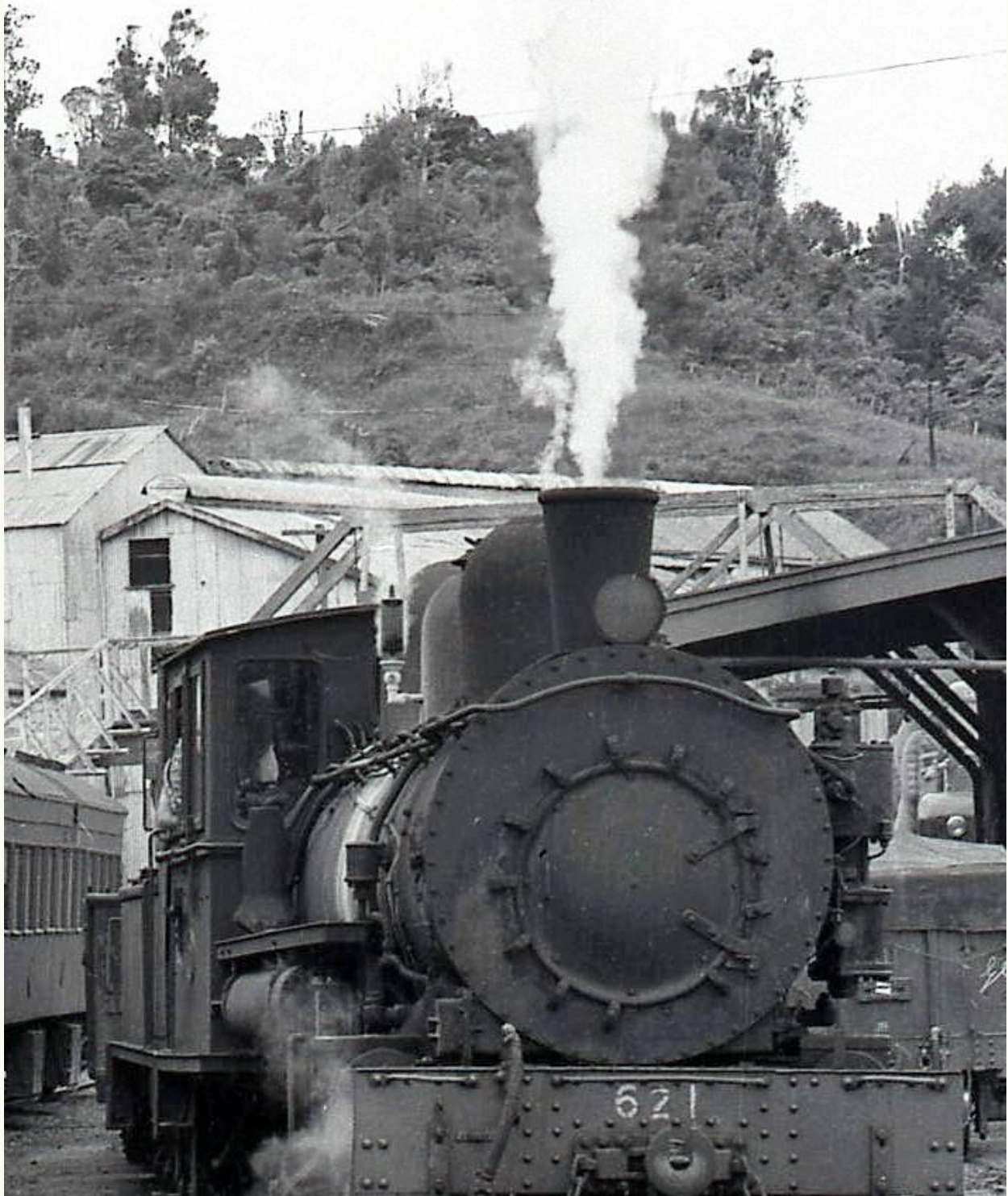
BB621 at Glen Afton 1956