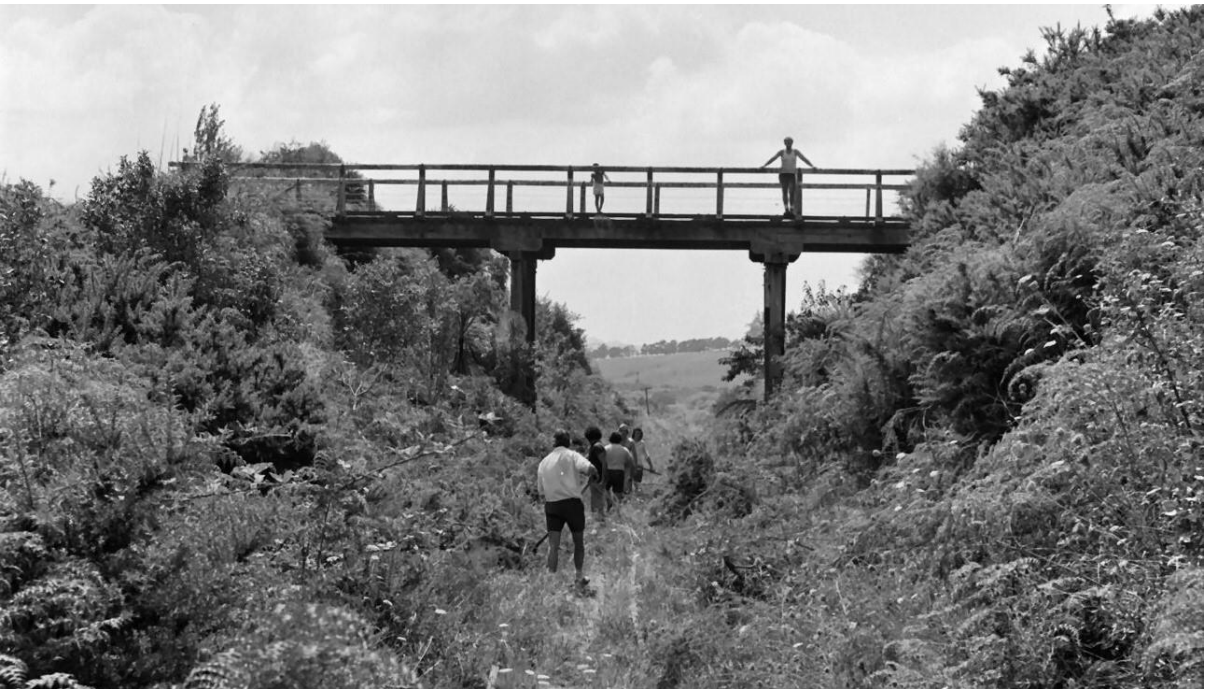
Hangapipi road bridge 1979