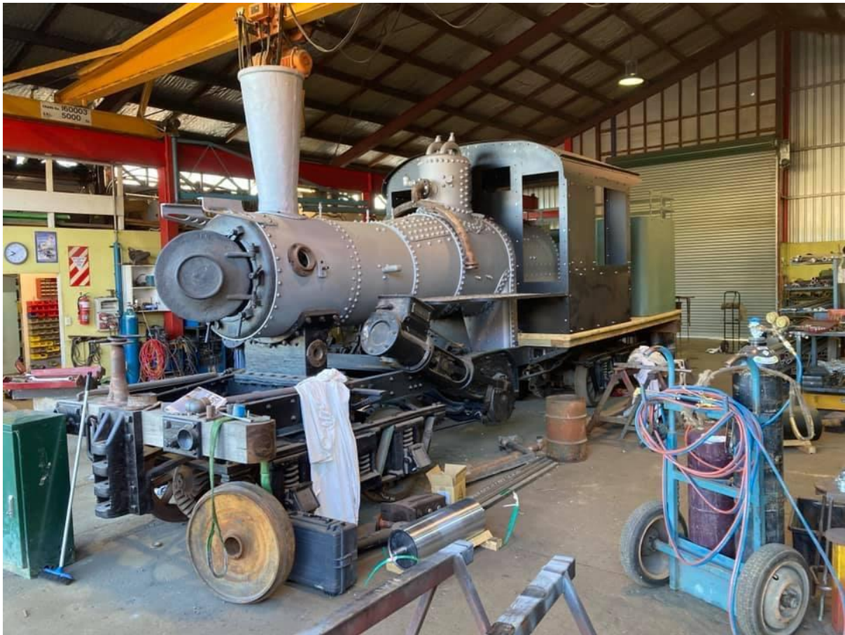
The Climax approaches completion in Te Kuiti (C. Mann)

Climax 1650 : Work continues on this loco at John Pitcorns' Te Kuiti workshop.