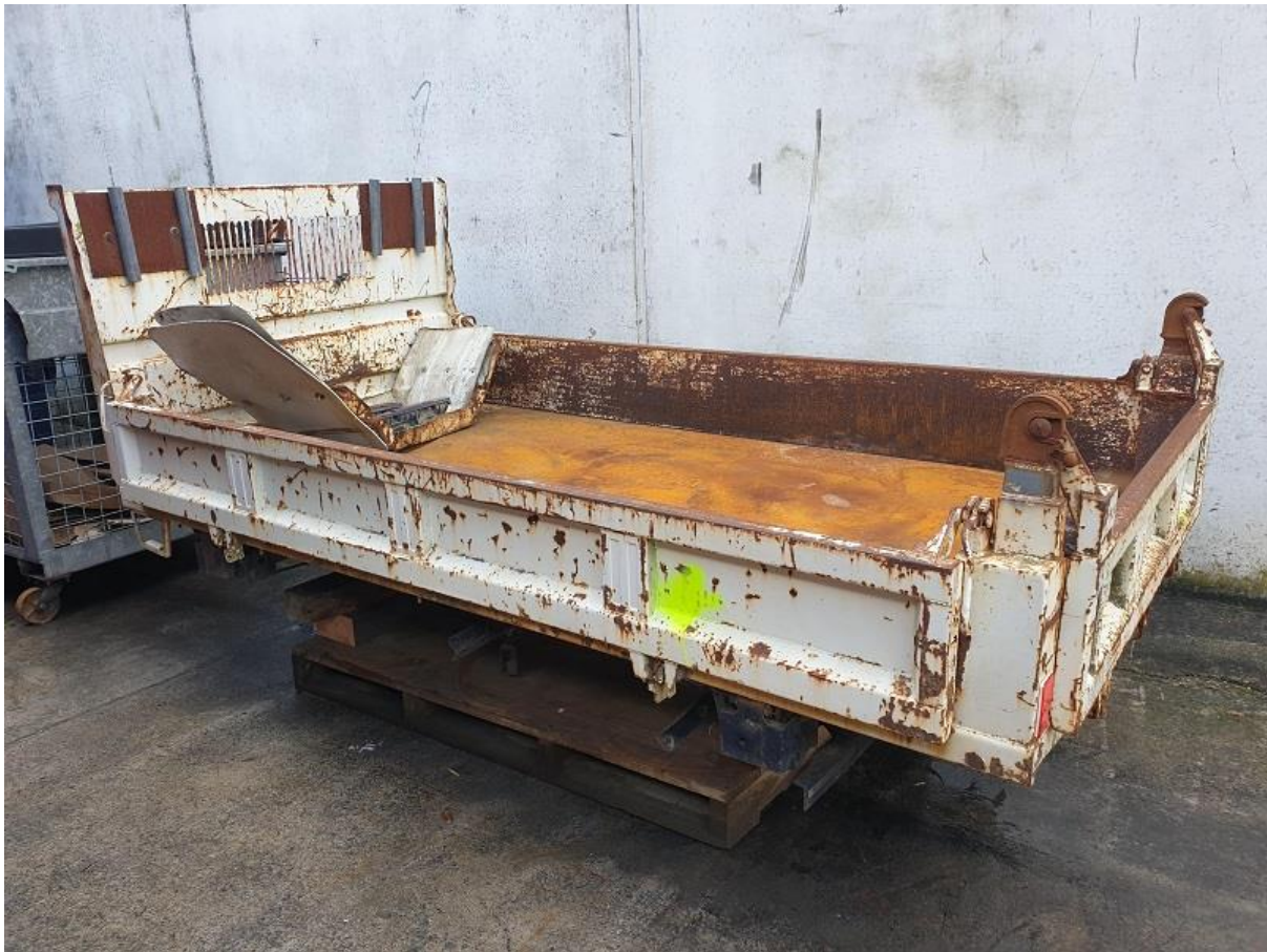
Tip truck body bought for mounting on the large flat wagon (I. Jenner)

La 17313: Dave M has been chipping rust that had bubbled through the paintwork & then applying new paint.