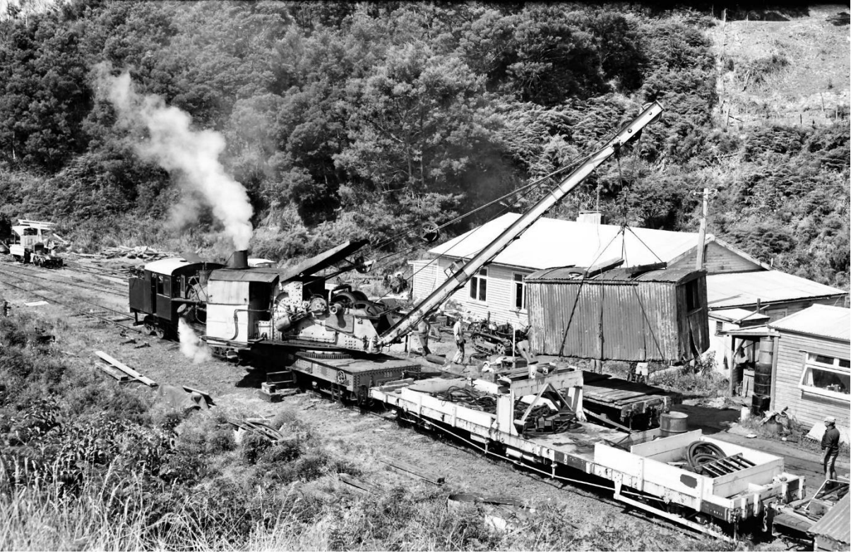
Steam crane in action & Heisler loco in action in 1979 at Pukemiro Jcn.