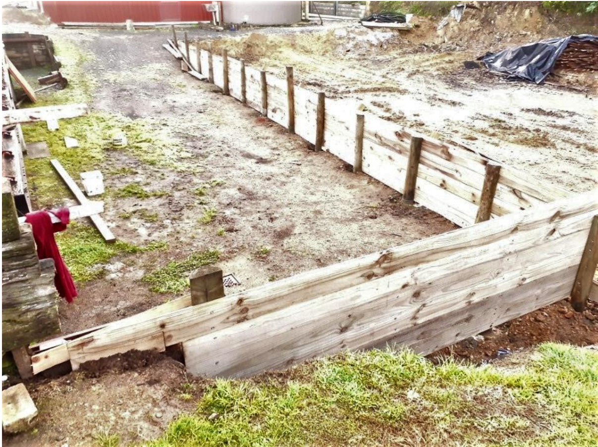
The new retaining wall next to the pit & where the hall used to be

Lawns: Russell W has continued to cut the lawns. He has, again, tidied up the drive up to the Junction. This presently scours badly with the heavy rain we have been having lately. He has also been tidying up some of our gardens. He has obtained some large tractor tyres & is intending to make them into gardens.