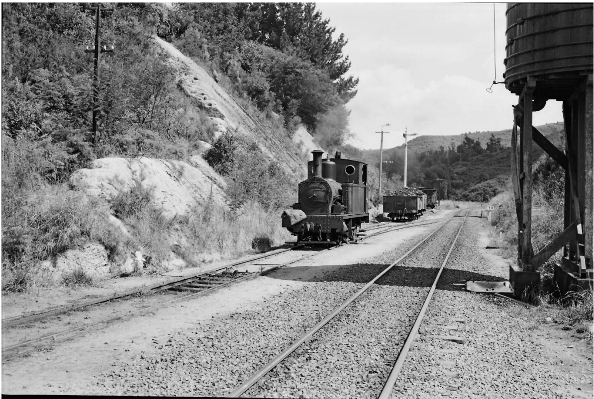
Peckett at Pukemiro 1957