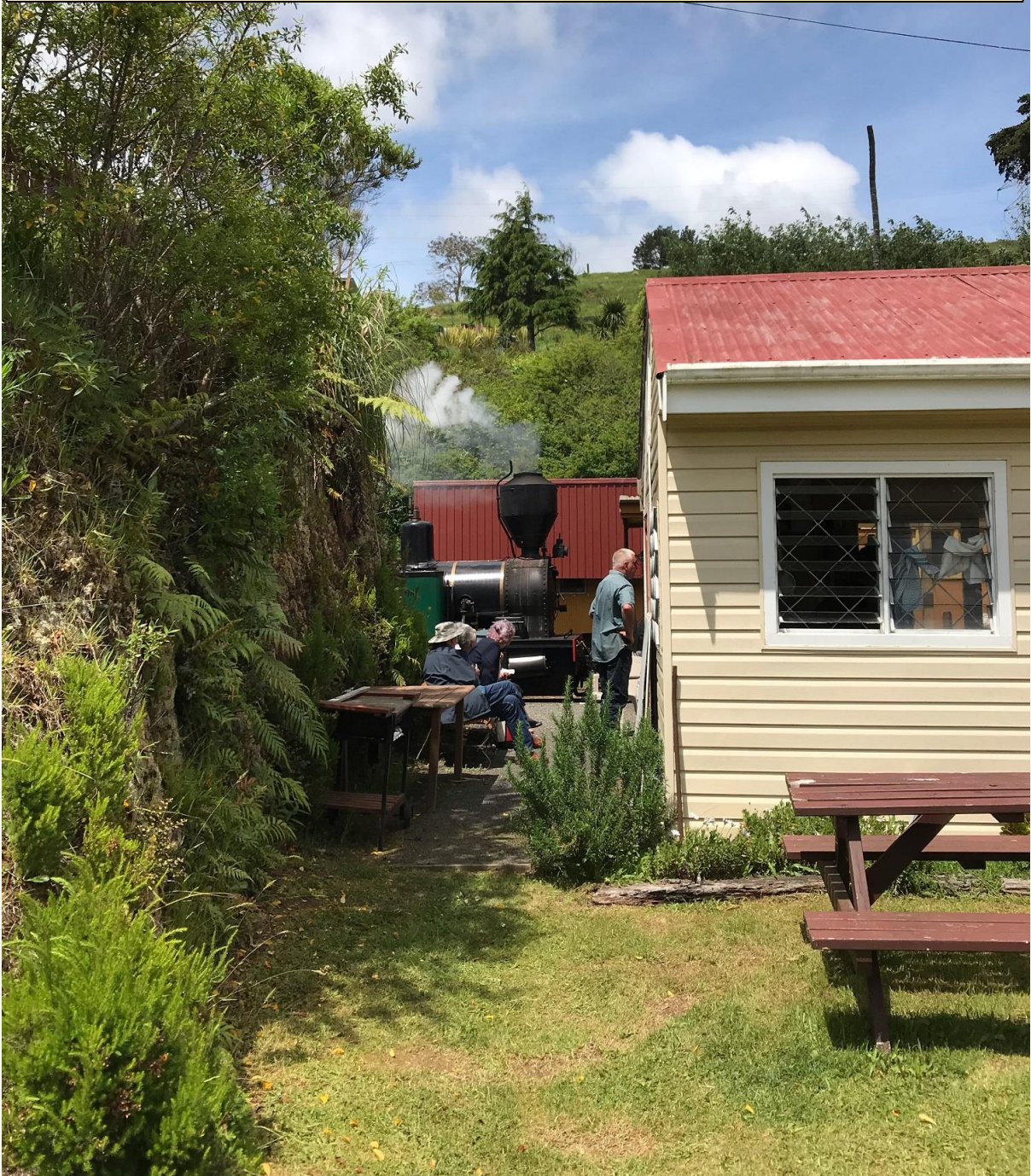
A bush setting view shows the Peckett – here seen from the back of the hill & the cafe