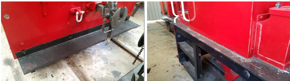
Tr 105 (Tr367) has recently had its rear shunter's footplate & cabside repaired