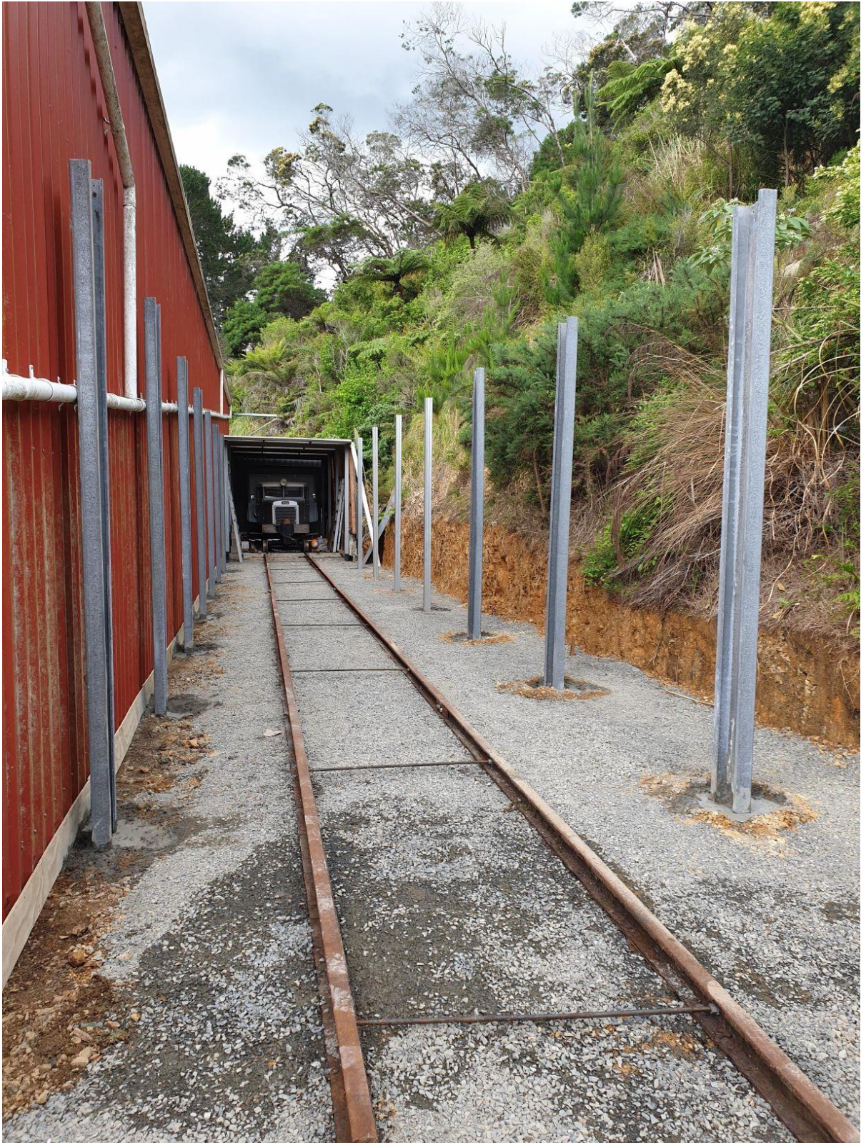
Progress on the woodwork shop “lean-to” showing the rails in place and posts concreted in