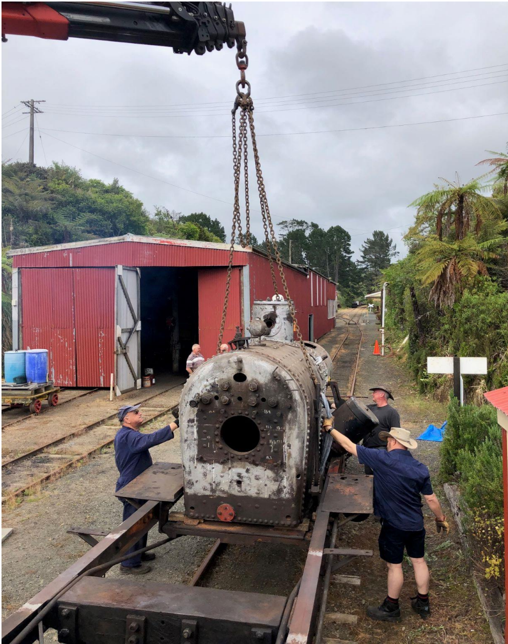
The Heisler boiler in the process of being lifted from its chassis, prior to being moved south

To make a donation see our website www.bustramwayclub.com for details.