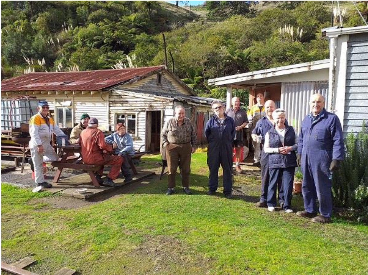
Members at the June working bee gathered for a group photo