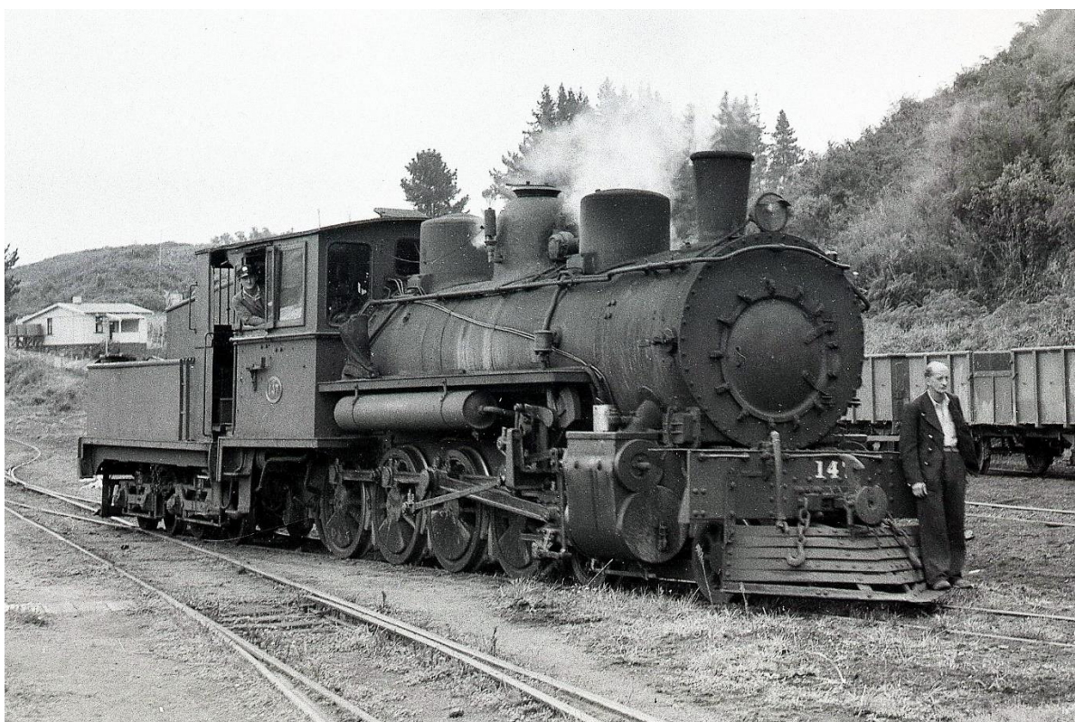
BB147 at Glen Afton in April 1955