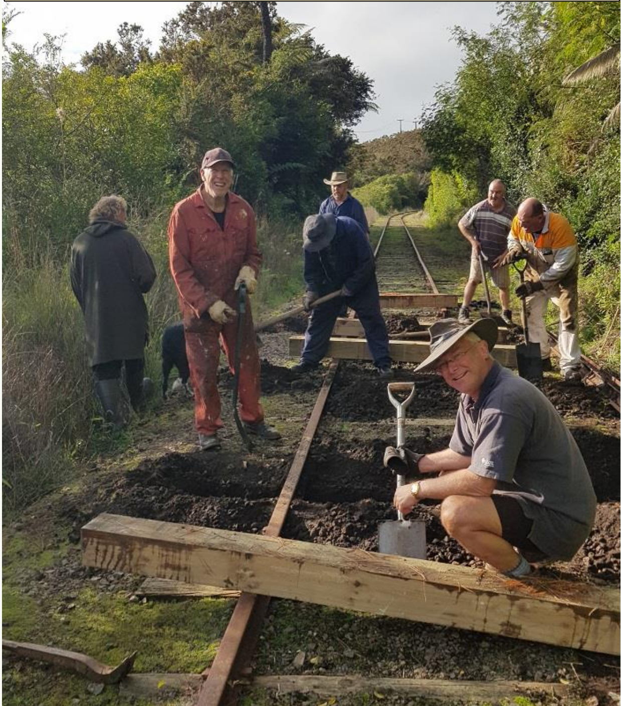
June working bee – down the line