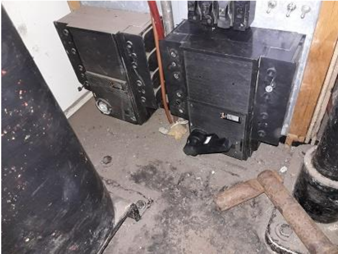
Switchgear inside the cab of the battery electric locomotive

Battery Electric Locomotive: Trevor T has been working on this locomotive including fitting a new isolation switch for the batteries.