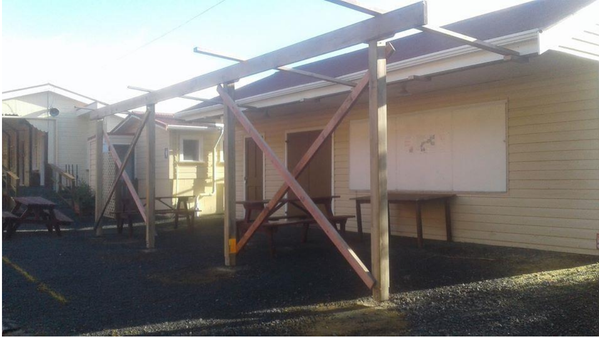
The new awning takes shape.

Bruce & Russell have been busy building the new awning in front of the café (Rec Room) to protect our sausage sizzler Trevor & the passing crowd from the sun & rain. Good progress is being made.