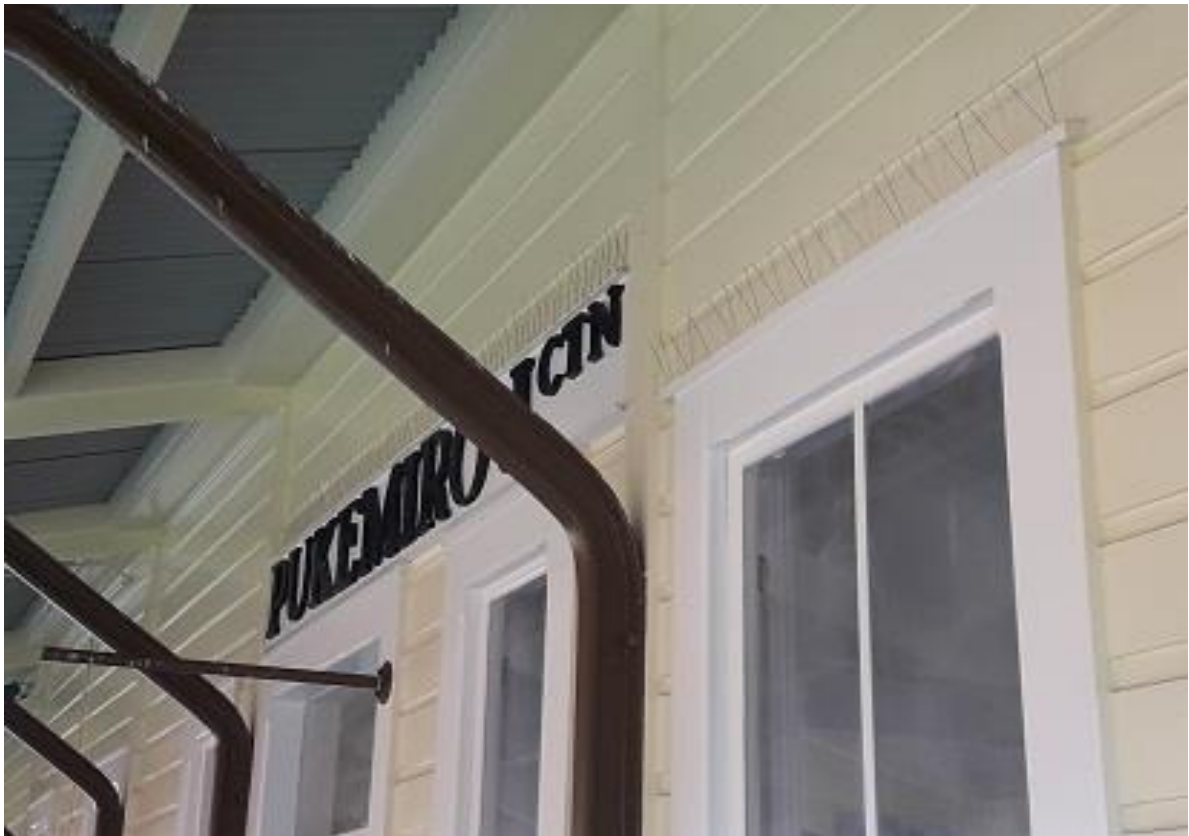
Spikes have been erected by Lesley & Maarten above the station windows to deter the birds: (Photo: T. Townsend)