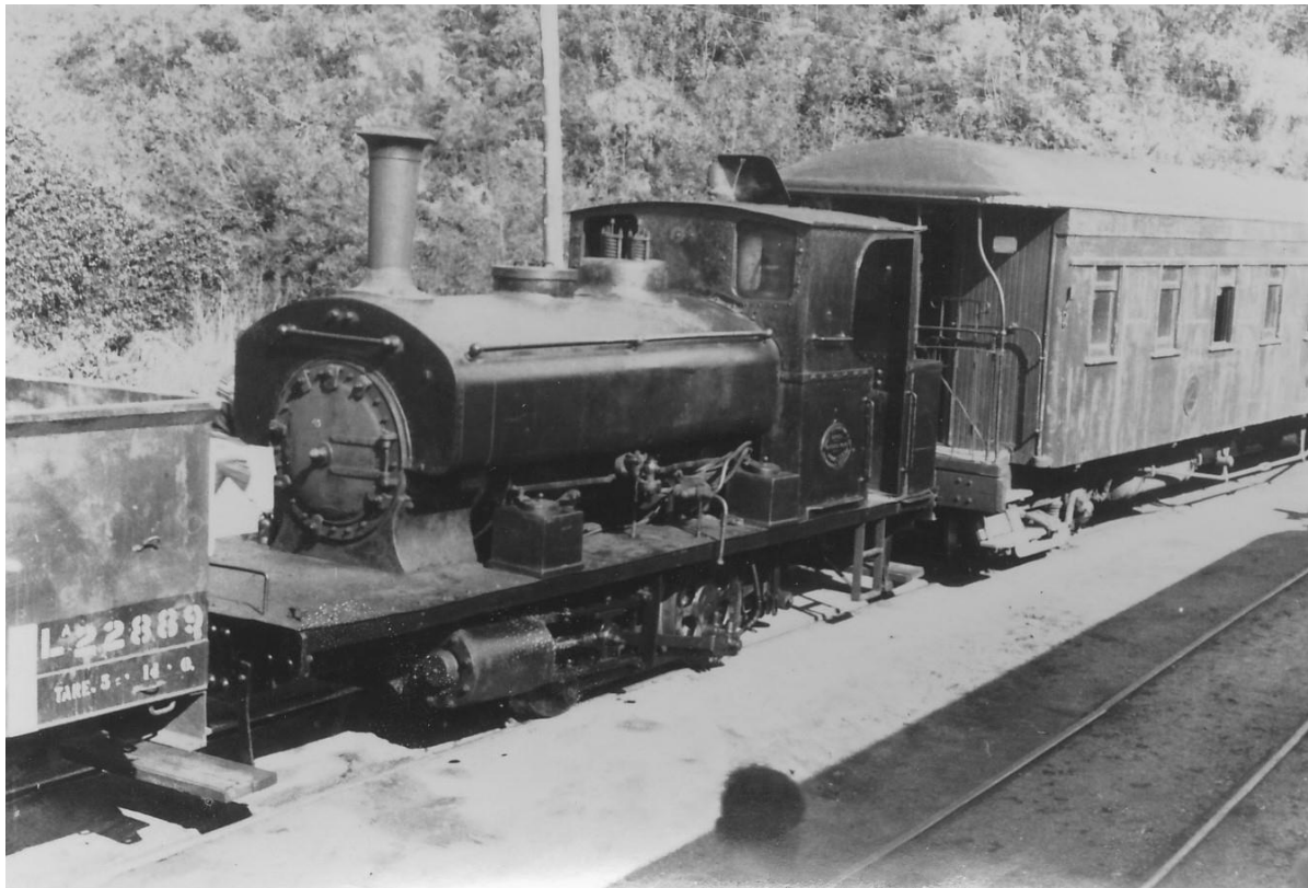
The Barclay locomotive at Pukemiro many years ago