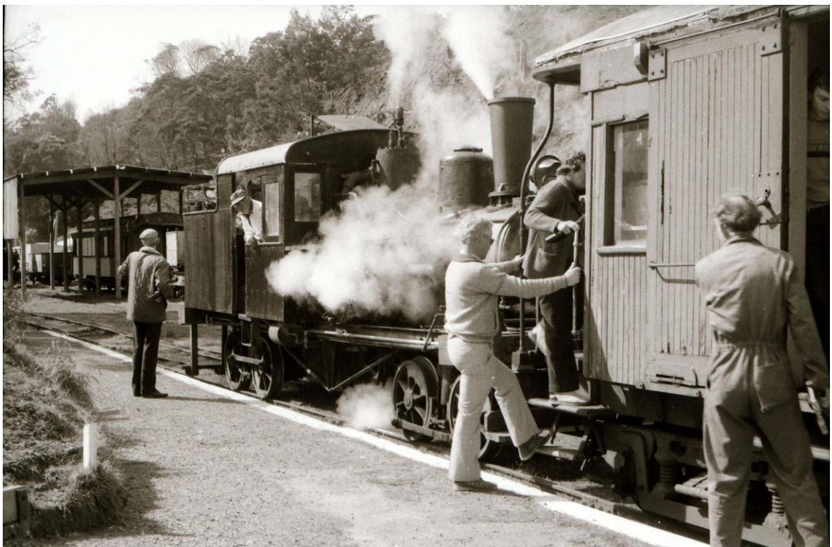
The Heisler locomotive and car van at Pukemiro Junction in the 1970/80's