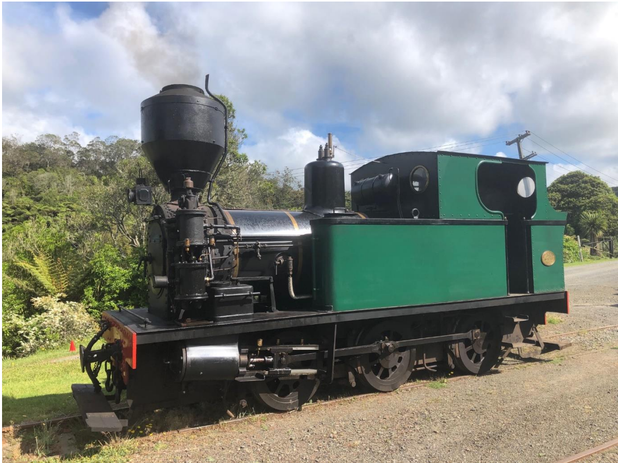
The Peckett seen at the December 2019 Open Day – now under survey (C. Mann)

Both steam locos are out of service for their annual surveys.