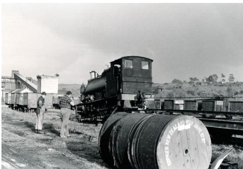
The "F" being unloaded at Rotowaro in the 1970's