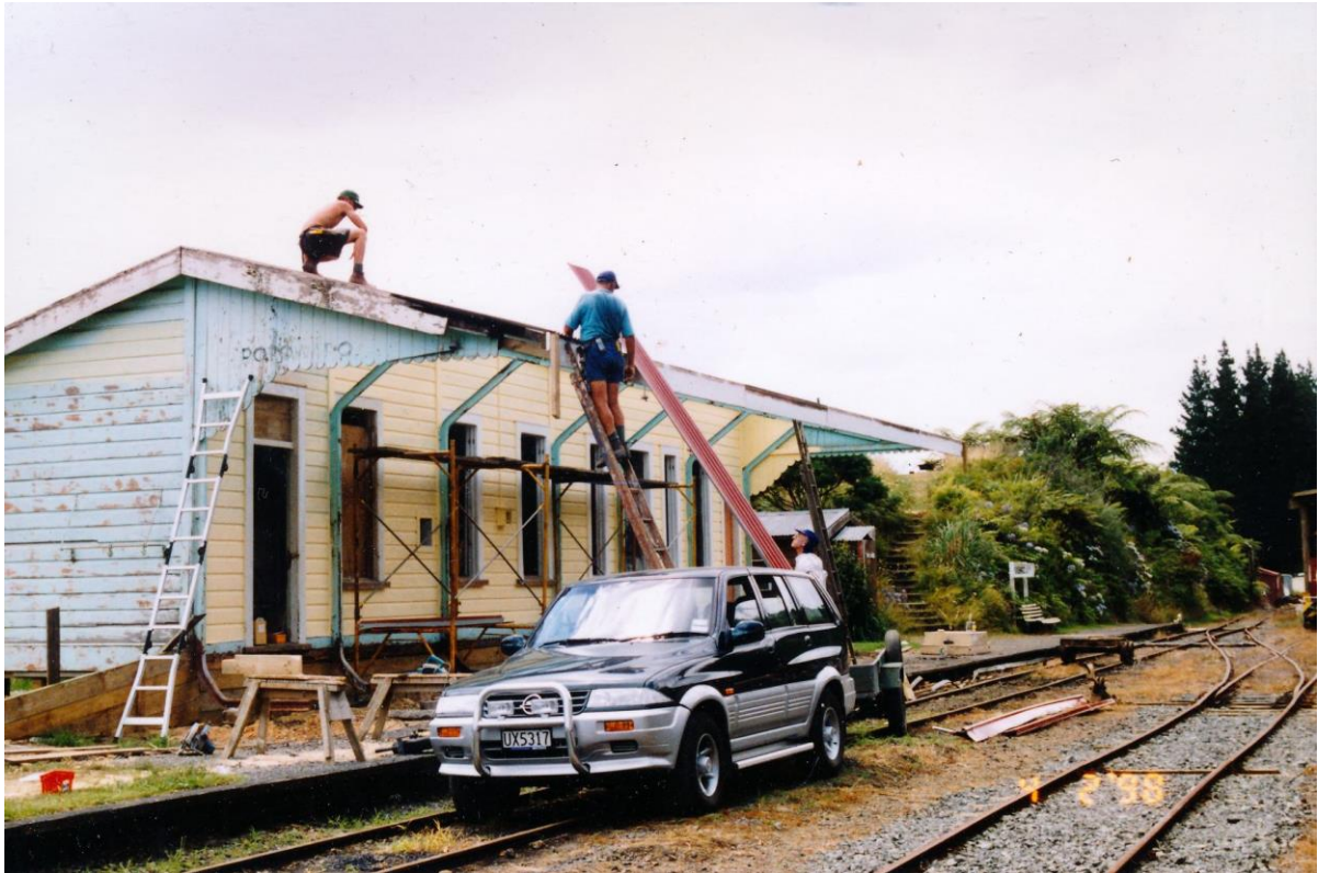
The old Rotowaro Station is seen here in the process of being relocated to Pukemiro Junction in the 1990's