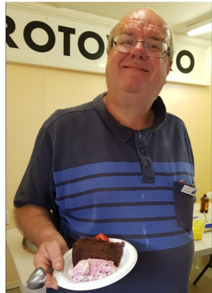
Members & guests enjoy the December 2019 Open Day