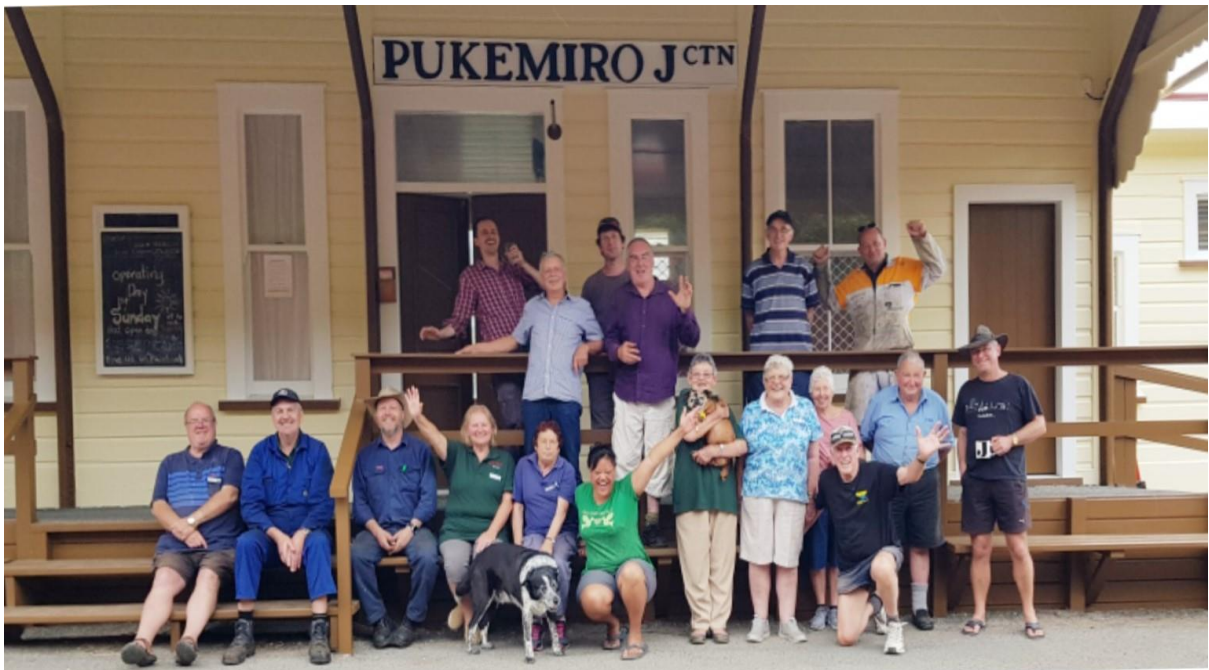
Attendees of the December 2019 “Nosh Up “ Christmas Celebrations