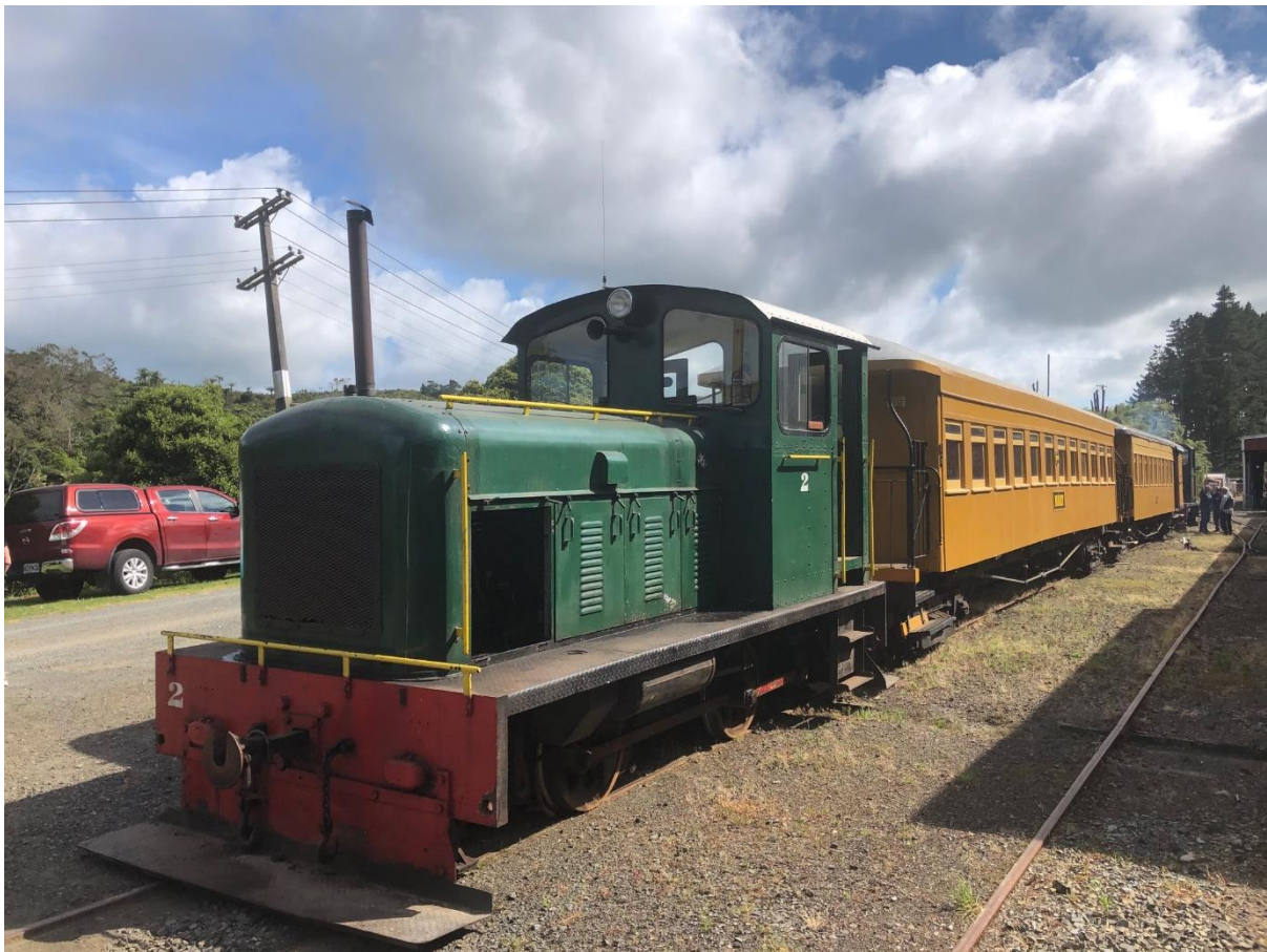
The Meremere diesels remain as the key locomotives on Open Days

November was not too bad passenger wise but December was the quietest we have had for many years. The drier weather meant that the Peckett was confined to the yard both days. The Cb was running up & down the yard during the November Open Day. The Peckett earned some money by allowing members of the Public to have a (supervised!) drive up the yard.