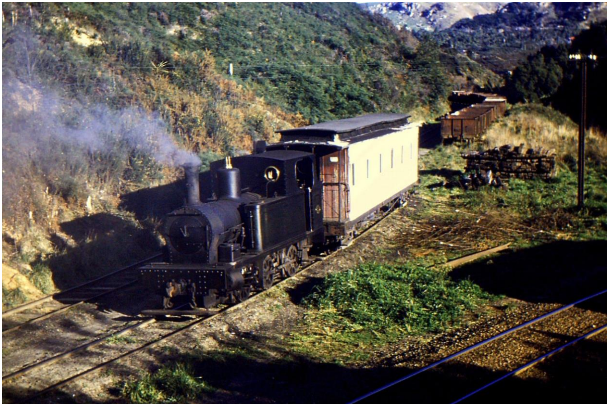
The Peckett at Pukemiro Junction around 1960...the coal wagons are on the Pukemiro colliery branch line