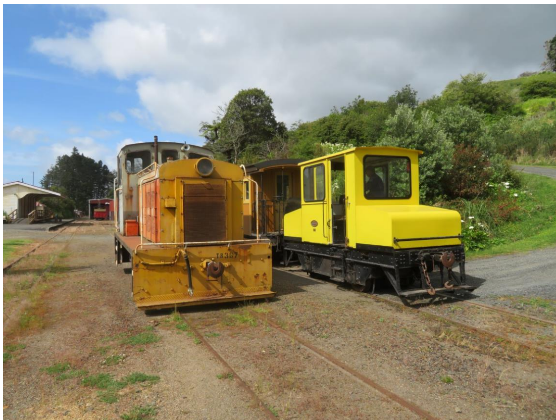
The new Tr367 acquisition is seen with the Battery-electric loco on 1 November 2019

They were both built by A & G Price's in Thames for NZR, one in 1958 & the other a couple of years later. They are both fitted with Gardner 6 LW engines.