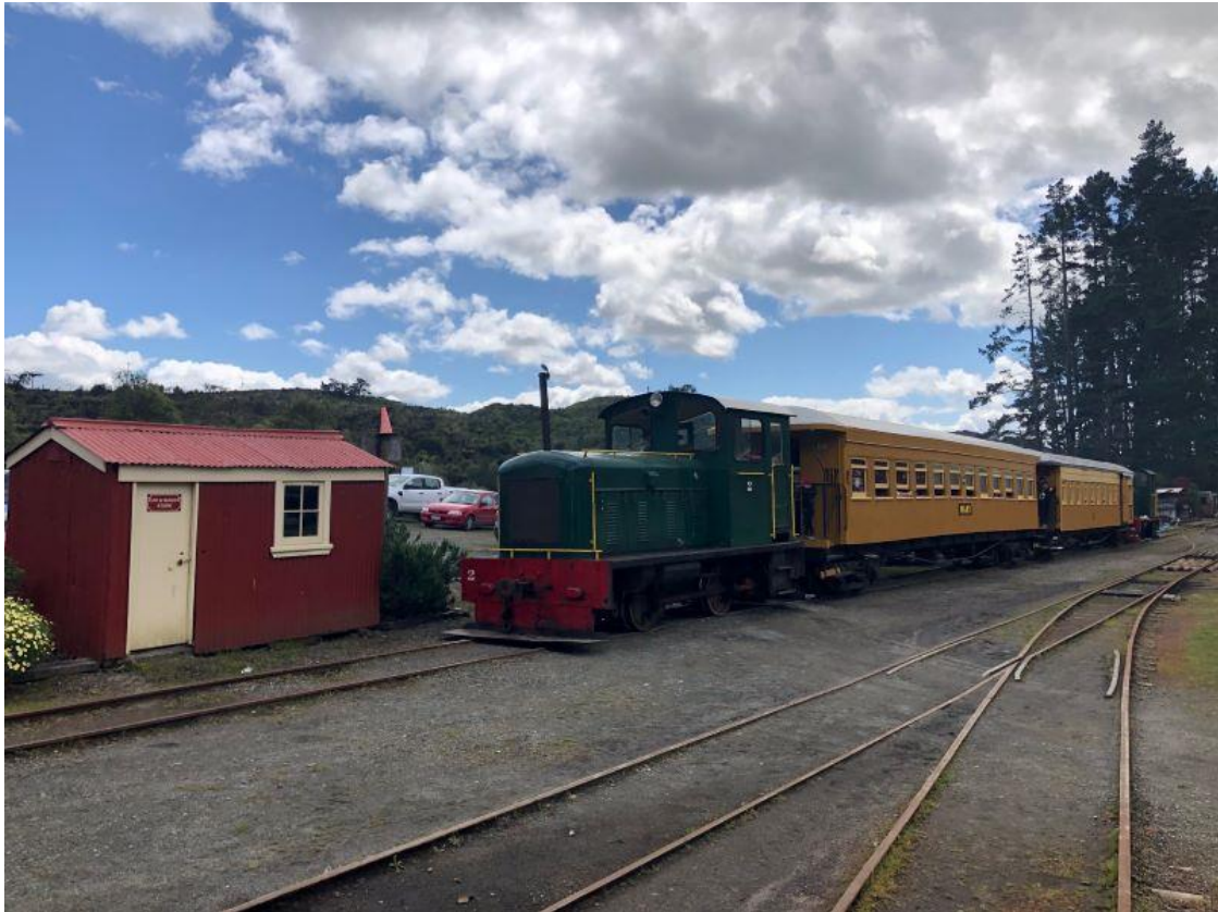
The Meremere locos & train at the October Open Day