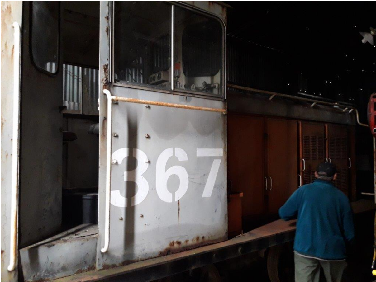
Tr 367 seen at Pukemiro Junction

Climax 1650 : Alistair has spent most of a week welding on this boiler.