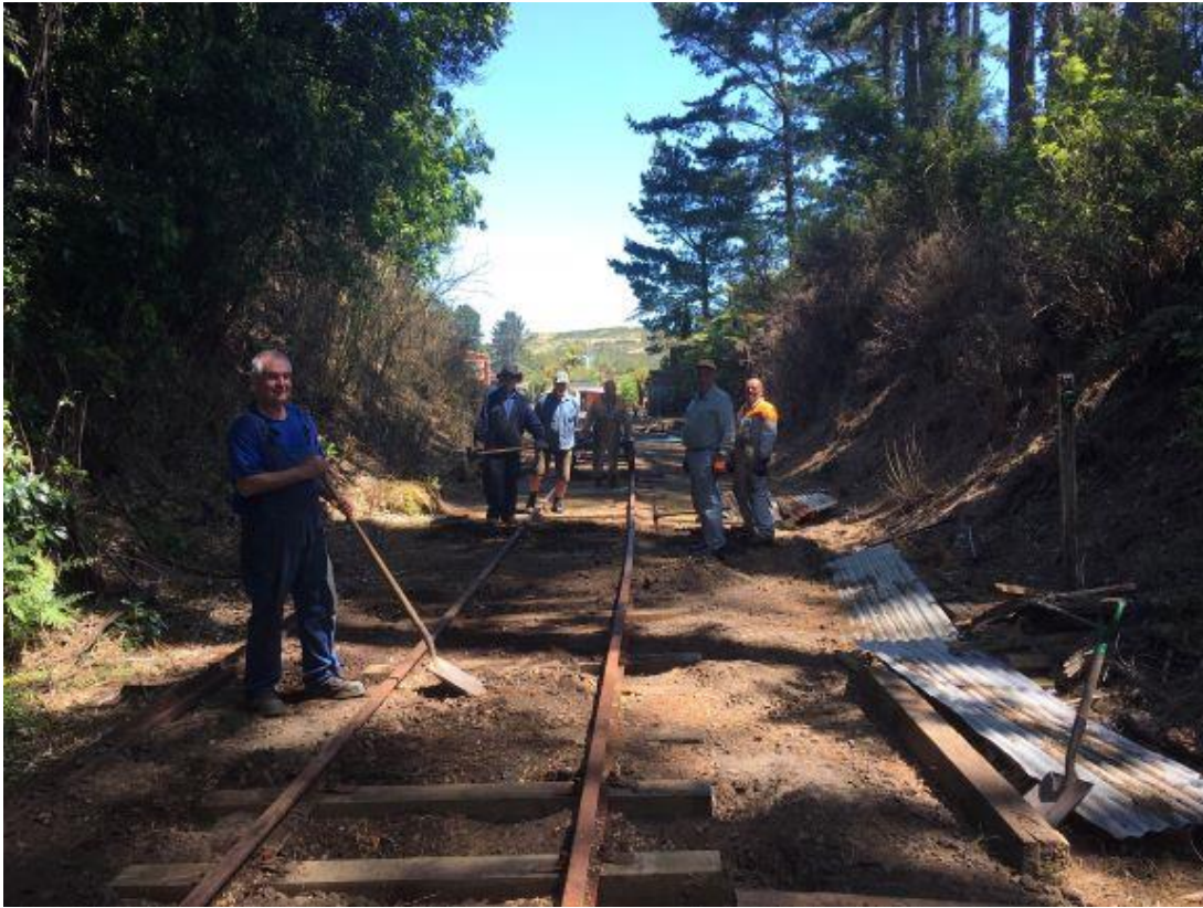
The BTC track gang hard at work at the October working bee

We also had a very successful track gang working bee in October...many thanks to those who were able to be there.