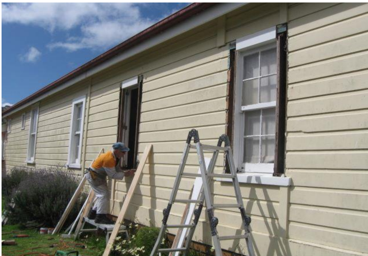
(Upper) Ashley & Bruce repairing the Platform edge; (Lower) Repairing the station windows