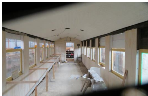
The interior of our A1477 "A" Class carriage is being lined with plywood prior to painting