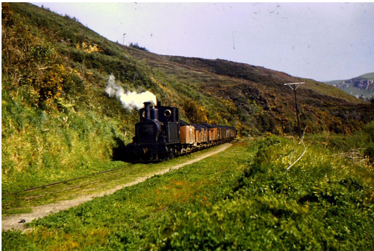
The Peckett locomotive coming down the Pukemiro branch line in around 1960