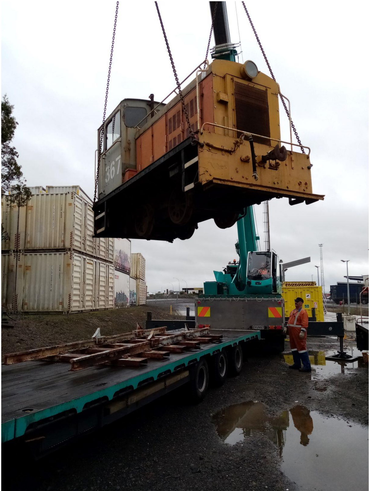
The new acquisition 367 seen being craned onto a low deck truck at KiwiRail Te Rapa depot