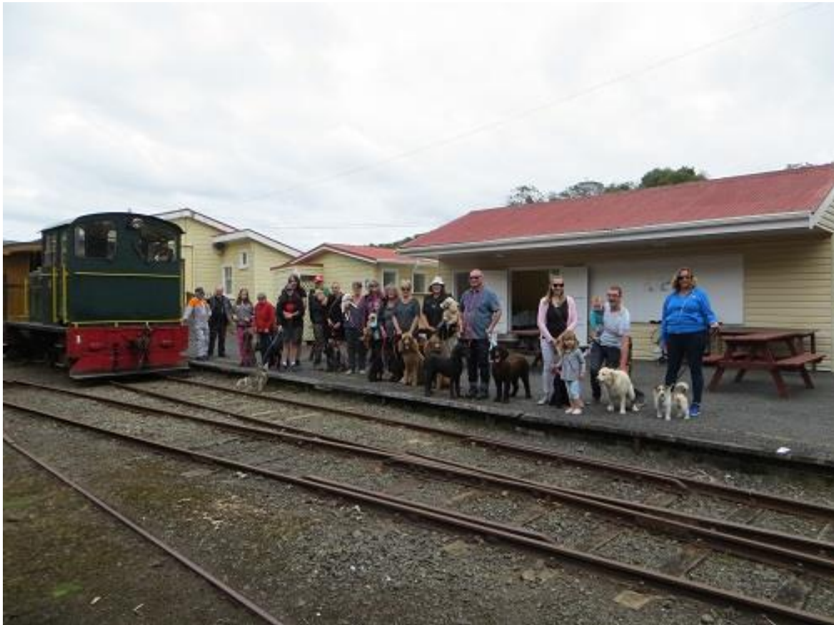
The Poodle Club with their diesel hauled charter train

This year we have had a marked increase in charter bookings over previous years. On Saturday the 27 th October we had a visit from a Hamilton Poodle club. They have been coming regularly for a number of years. Thanks to the Charter crew for running these trips.