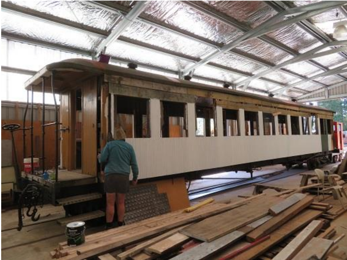
A1477 is progressing well (R. Ellis)

La 17313. - The frame work for the roof has been adjusted and will be welded onto the top of the wagon body corners.