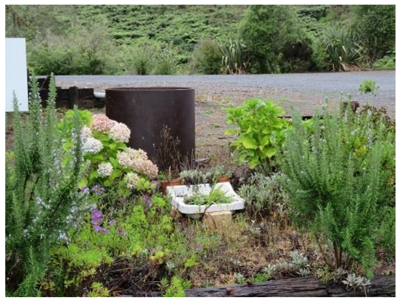
One of Russell's many garden creations at the Junction - Image RE