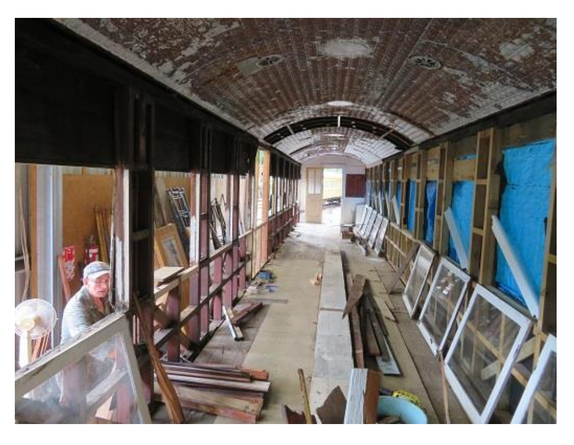
The No.3 Car shortly after arriving in the Woodwork shop - Rob Beaumont examining - Image RE