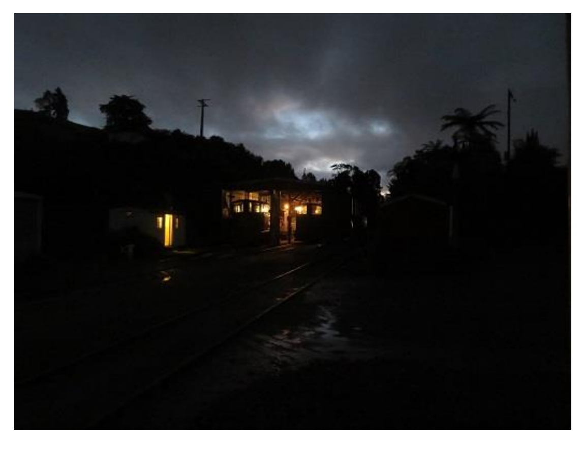
Evening activity at the Bush Tramway Club as RS does work on the Climax boiler - Image RE