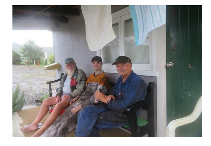
Members relax at the end of the day