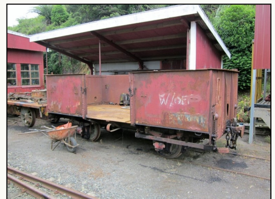
La wagon sans-rubbish