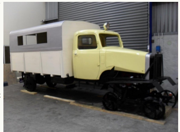
Jigger #2 in all its glory