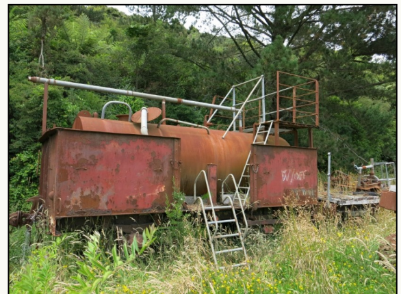
The La tank wagon in state