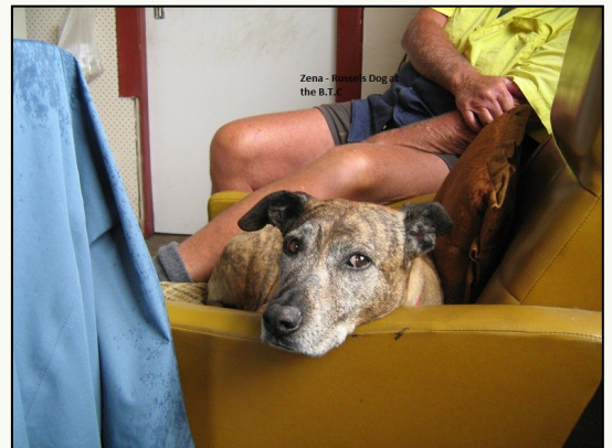
She will be missed