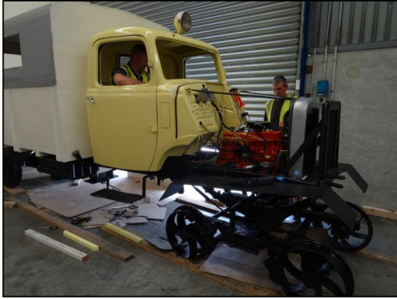
First running of Mamaku Jigger #2