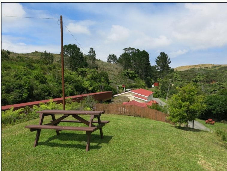
Sun shining on a junction at rest