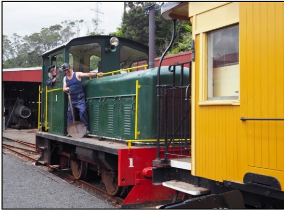
Just another miner on his way to work on the December Open Day