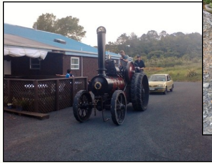
The Blue Rooms look new compared to this beauty! (I.: R.E.)