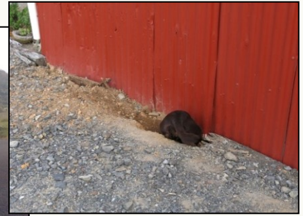
Dog attempts to go subterranean to hunt it's prey in the Car & Wagon Store (I.: E.B.)