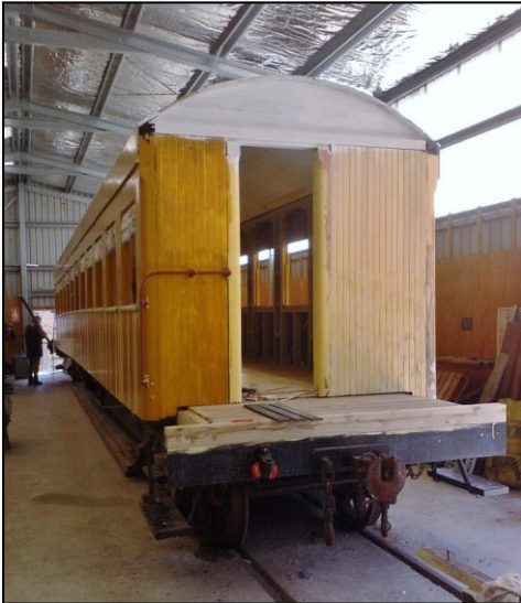
The new open air experience.

Once this was completed it was time to put a new set of timber on top of the rib to enable the steel roof to be fixed to it. All of this timber was painted before being fitted to the top side and the inside roof lining was tackled in a similar manner.