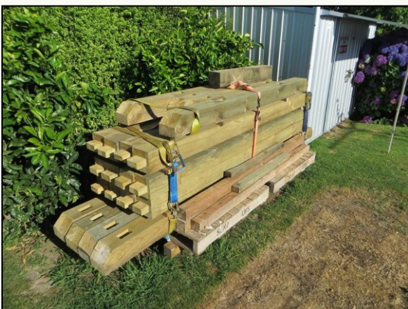
This is one kitset you won't be finding at the hobby shop.