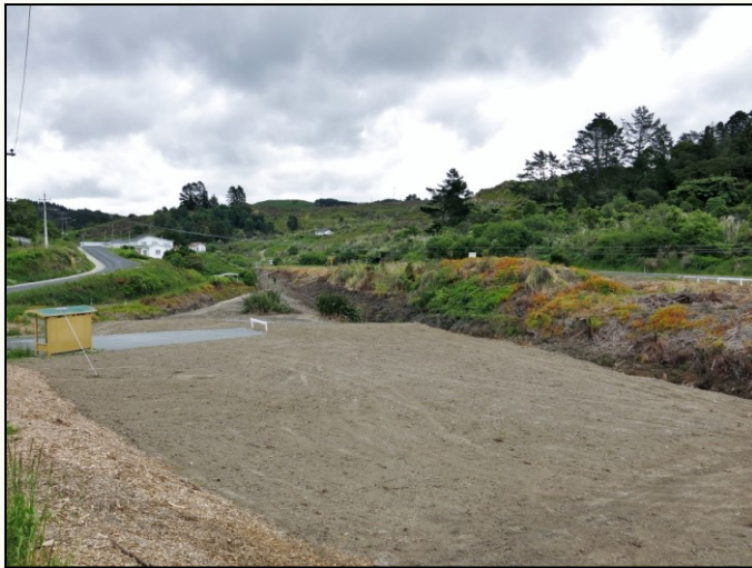
The Glen Afton terminus area has been transformed again by Waikato District Council work!

A digger has been back to Glen Afton and scraped all of the mud etc. off the top of almost all of the rails and done some excellent drainage work. Still more needs doing to get the wa-