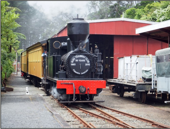
The Peckett steams into the station with the special 50th Anniversary Train having just taken over from diesel 402.