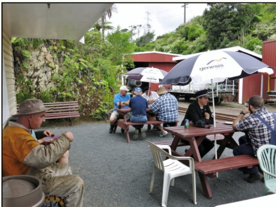
The end of year dinner was enjoyed greatly by those in attendance. With no worry of running out of deserts!