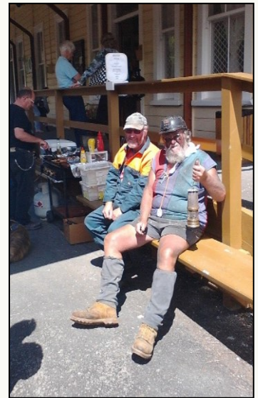
One of the “period” costumes of the day, a dirty young miner with helmet and lamp. (Image: R.E.)

A special thanks to everyone who helped on this special day.