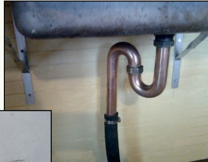
Copper U-bend, only in the shanty. (I.: R.E.)