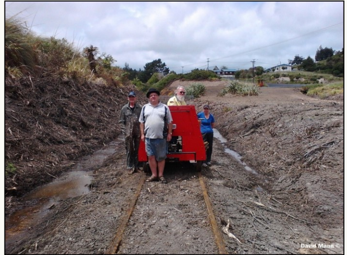
A very special jigger ride, The first rail vehicle to Glen Afton in 42 years. 11/12/2015

Please pencil this date on your calendars. Our usual shunting