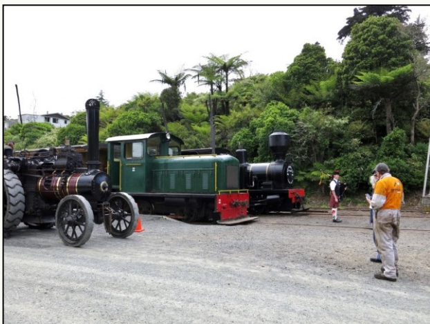
The big (as in tonnage, excluding the people) stars of the day. Nice to have steam out numbering diesel. 401 rams out so much smoke it should be an honorary steamer. (I.: E.B.)