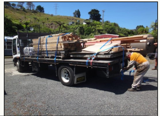
A load of many things including timber from shipping containers, new screw spikes and ceiling panels for the carriage. (I.: I.J.)