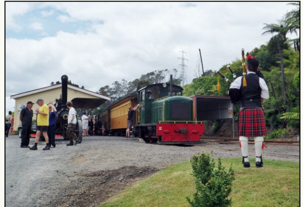
Thanks to piper Kevin O’Hara the departure and arrival of each train was met with the striking sounds of old.

Come along as there is always plenty to do.