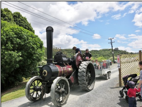
Traction engine rides, a rare treat at the junction. The open air experience seemed to go down well.