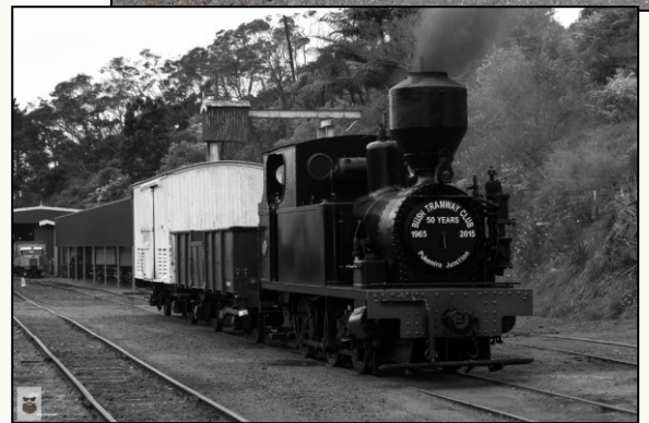
Looks rather dashing with it's 50th board on doesn't it? (I.: G.C.)