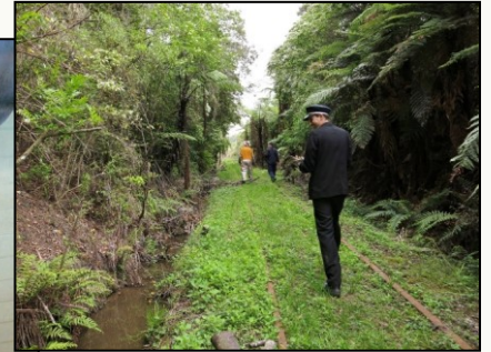
The cutting to Glen Afton is the bushiest bush on the line. Hopefully we can keep it that way while making it operational. (I.: E.B.)