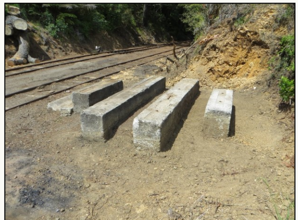
Uncovered, the foundations await their load.

This is located behind the wood-work shop, Alun, Trev and his brother have been working on this project. They have laid the concrete blocks for the short wall and are pricing other bits and pieces for the wall and side door.