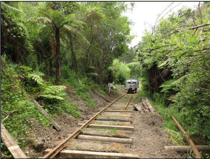
Onward to Glen Afton! This track presumably completed before the jigger trip to the end of the line.

In the area of the September derailment, all marked sleepers have now been replaced by a CW crew. Some sleepers have been laid out ready to replace a few in another area. Half a day was spent by the CW crew screwing down some new sleepers at the current end of the line to Glen Afton.