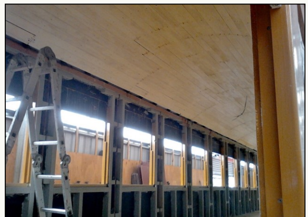
After much work, there is again a ceiling!