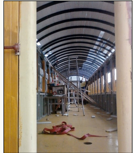
Roof-in-progress.