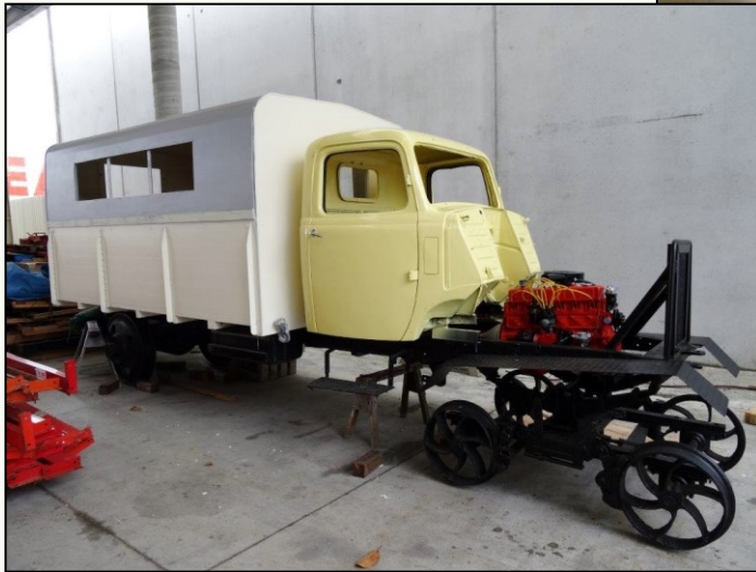
Mamaku Jigger No.2 up in Auckland. Cab, motor, passenger compartment, it's all coming along splendidly! (I.: I.J.)