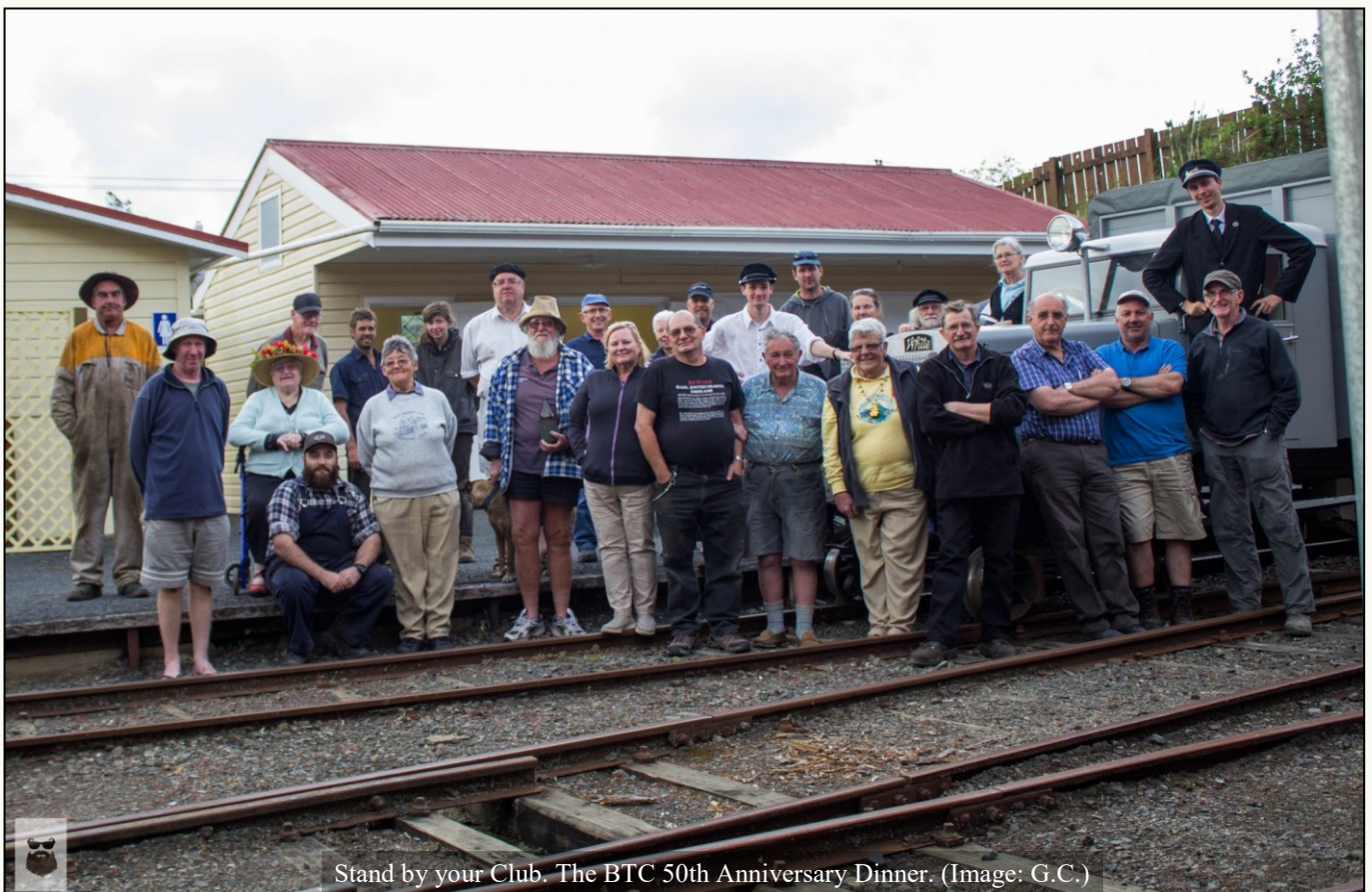
Stand by your Club. The BTC 50th Anniversary Dinner.