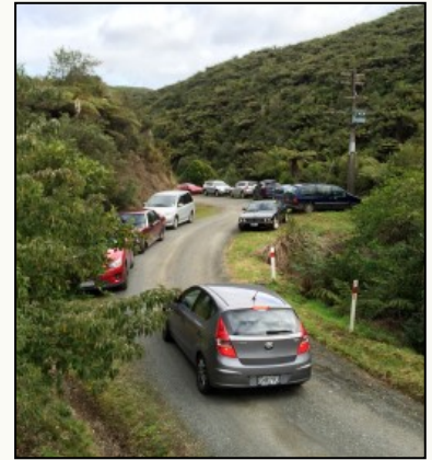
Visitors were even parking on the drive it was so busy on the July Open Day.

The MOTAT crew certainly like the much longer run possible on our line.