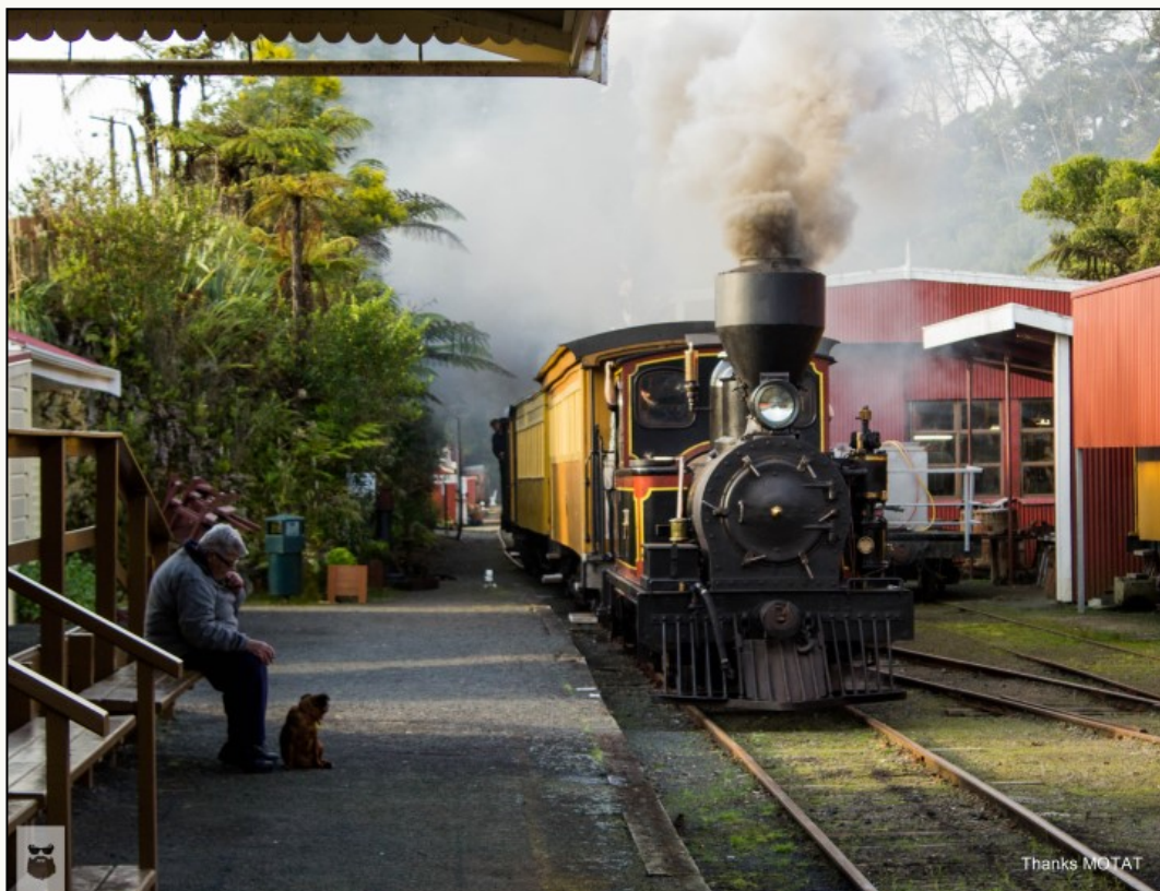
MOTAT's 'L507' pulling into the junction with 'passenger' train on the August Open Day.