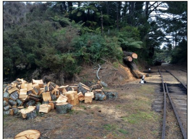
There are still some logs to be split for anyone who feels like some exercise.