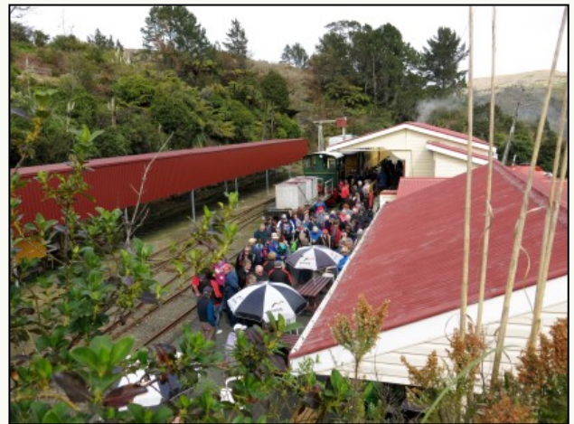
The NZMCA charter was also a roaring success with barely enough room for all the passengers.