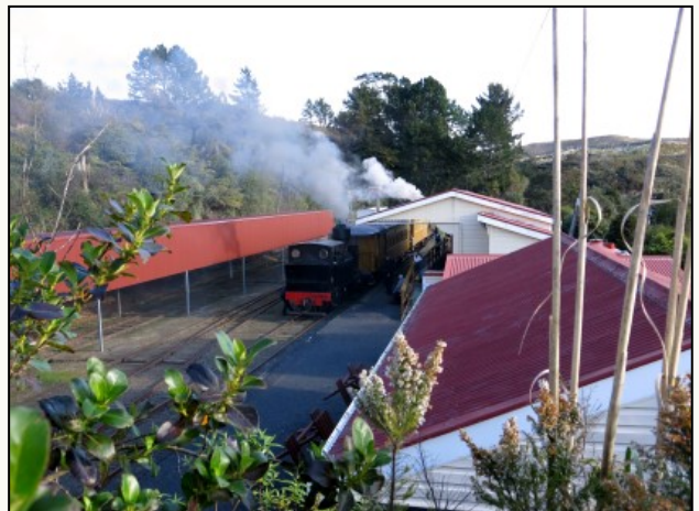
However it’s the August Open Day that shows what happens when there’s no advertising or charter, near the end of the day the place was very quiet.