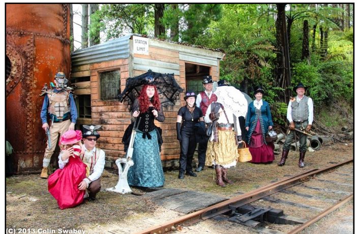
Taking a sneak peek at the next newsletter, we see some of the members of the two steampunk groups that visited us on the November open day. The gentleman in the left image in particular