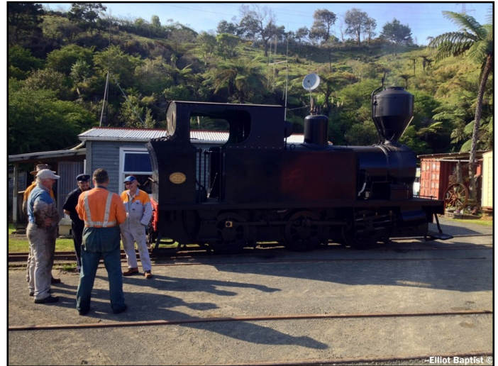
Those of you thinking “if I see any more images of the Peckett in this newsletter, I’m going to pass out!” Had better take a seat, because, surprise! It’s the Peckett again! So here on the left we