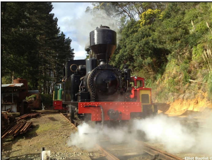
—Elliot Baptist ©