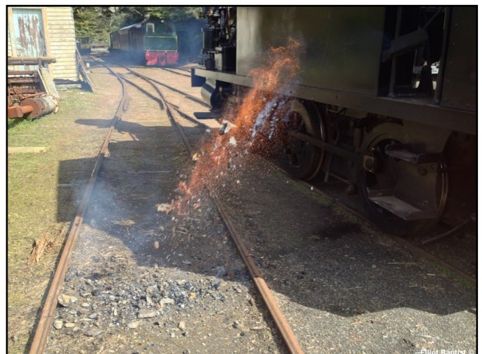
Here we see the September open day and, of course, the Peckett! On the left we have the Peckett moving to replace 402 on the