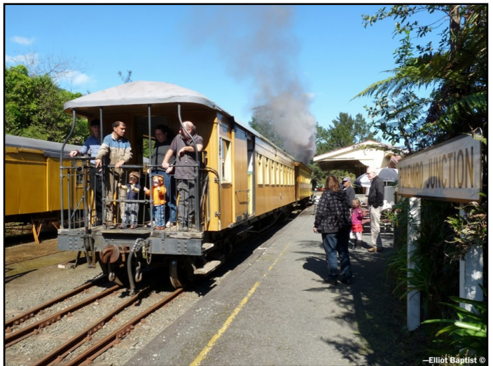
—Elliot Baptist ©