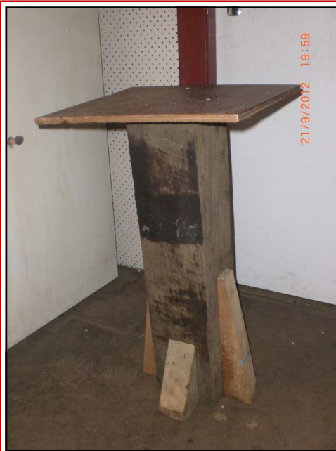
Here we have a guest photo by Chris Lucas, of a small DIY table seen in the shanty with the caption:

'An example of the high quality engineering products produced by the highly skilled artisans in the precision workshops of the Bush Tramway Club!'