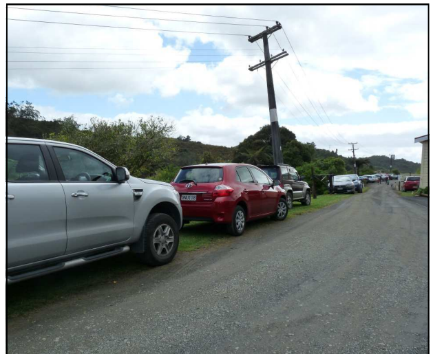
The morning of the October Open Day once again saw the car park overflowing. It's great to see so many passengers, although it does rather strain the car park.

Feel free to send in your own photo with a corresponding caption. The funnier the