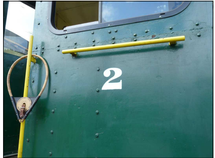
Just as the carriages have received their new number plates, the Meremere diesels have had their respective numbers painted back on to the sides of their cabs. A nice touch indeed.