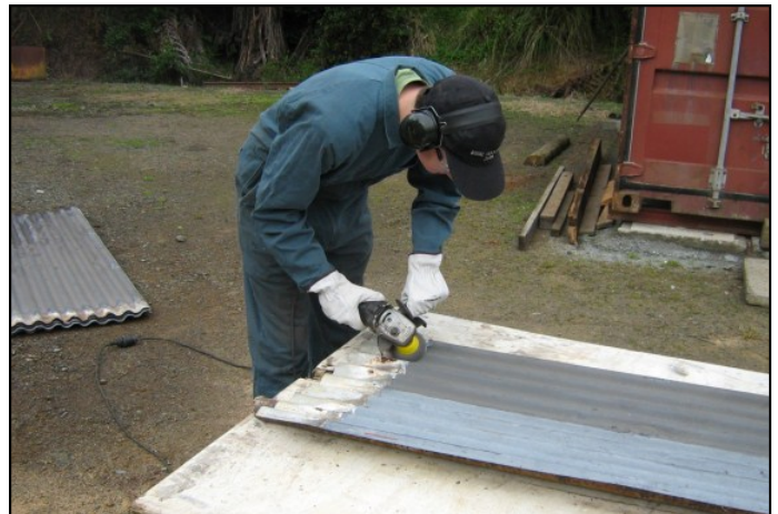
In what some might call a rare sight, here we have the editor at work with a grinder preparing the slightly used corrugated iron for the roof seen in the picture on the left.