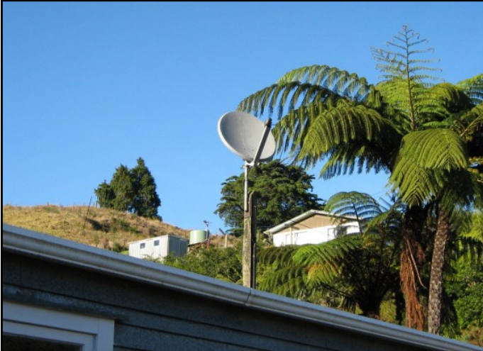
The club has joined the rest of the nation in the switch to digital with a satellite receiver. Now we just need something to decode the signal it's receiving from electronic non-sense!