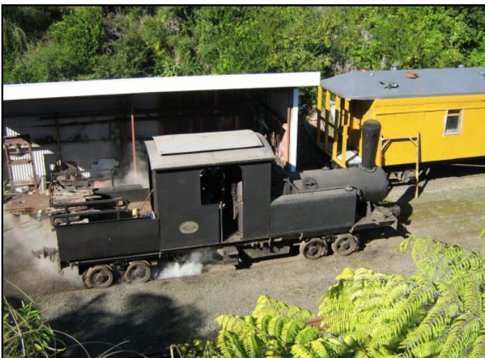
A lovely view of Cb 117 taken from the top of the hill on the May Open Day.