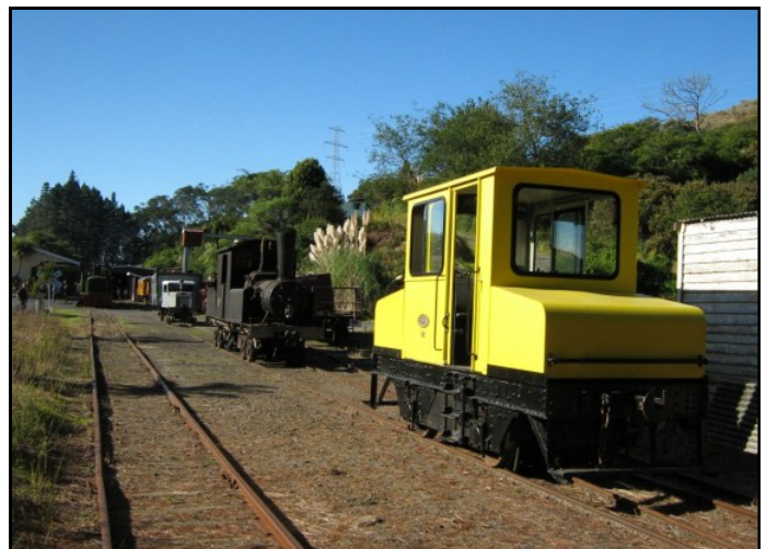
Another sight from the May Open Day: the Goodman, Cb, and Mamaku Jigger in a line, with 402 in the background.