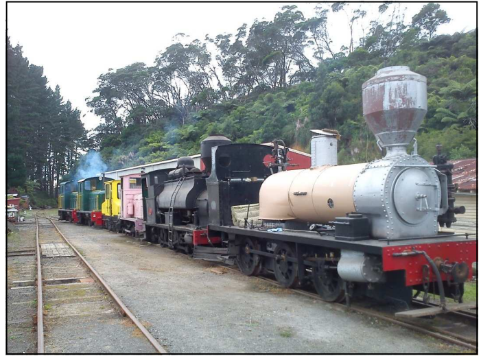
A rare occasion when the whole rake of engines was pulled out of the shed.