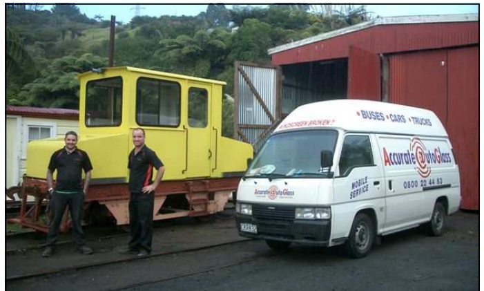
We would like to once again thank Accurate Auto Glass for supplying and installing all the windows on the Goodman electric loco.